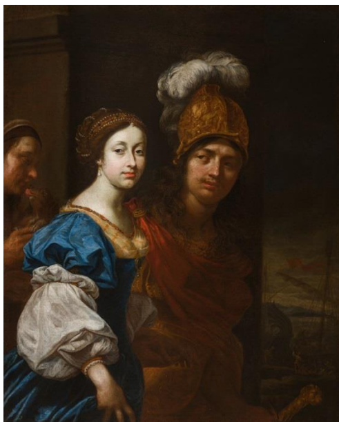
[1] Karel Škréta, Franz Anton Hovora Count Berka of Dubá and Lipá and Aloisia Ludovica Anna de Montecuccoli as Paris and Helena, 1672, National Gallery Prague

(1672), where Škréta masterfully captures the moment of looking at the viewer. The characters communicate with the viewer in a moment of surprise, which departs the image from conventional studio portraits. In addition, it also in a certain sense anticipates the way of painting influenced by photography- the figure in the left part of the painting is cropped, thus suggesting a cut from the scene instead of the compositional layout specific to the “theatrical” scene of Italian painting. Instead, there is a view into another space - the landscape in the background, referring to the story of Paris and Helena. Other portrait work by Karel Škréta includes Portrait of the Maltese Knight Bernard de Witte (after 1650), Portrait of a Mathematician and His Wife (1640s) and Portrait of a Miniature Painter (1640). Significant is also Škréta’s painting St Karel Borromeo visits the plague patients in Milan from 1647 which often highlighted for its diagonal composition, but it is mainly known because the viewer can find there a crypto-portrait of Karel Škréta.