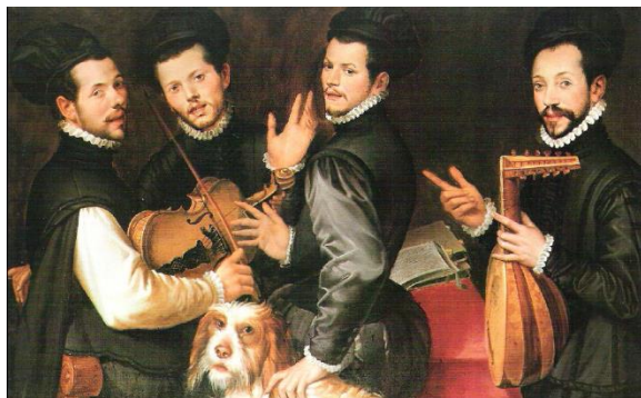
[VIII] Bartolomeo Passarotti, Ritratto dei Fratelli Monaldini , 16th century

Škréta sought contacts with Italians living in Prague at the time. Dionysio Miseroni (1607–1661) belonged to the second generation of gem-cutters from the Miseroni family living in Prague. He was a son of Octavian Miseroni (1567–1624), who was invited to Bohemia from Milan in 1588 and settled in Pisecka Street in Prague 63 . Besides his gem-cutting praxis, Octavian became a chief of the Imperial Treasure Camera 64 , signifying that the family was close to the royal court of Rudolf II. (1552–1612).