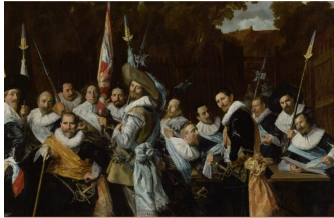
[XIII] Frans Hals, Meeting of the Officers and Sergeants of the Civic Cavalry Guard , 1633

Rijn (1606–1669), who is believed to never travel to Italy. His work is nevertheless characterised by chiaroscuro, which he used across themes, from portraits and self-portraits to genre scenes, allegorical and historical scenes. Apart from numerous self-portraits, his famous likenesses include the Portrait of Jan Six