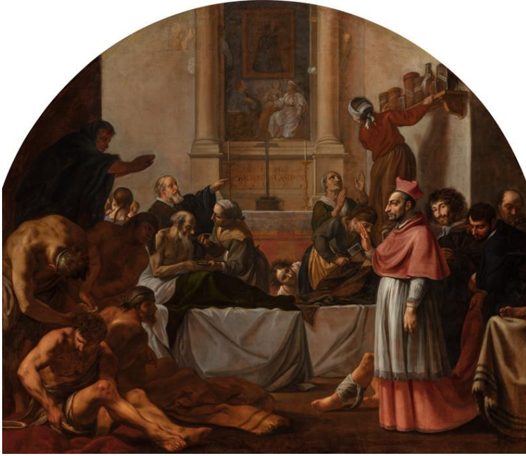
[II] Karel Škréta, St Charles Borromeo Visiting Plague Victims in Milan, 1647, National Gallery Prague