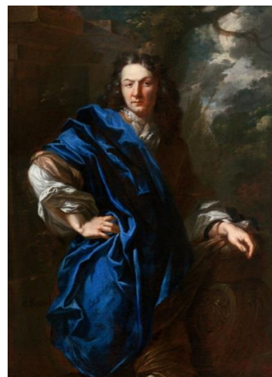
[XVI] Petr Brandl, Portrait of a Nobleman in a Blue Cloak , 1710, National Gallery Prague

Both painters are considered to be influenced by the work of Karel Škréta, and in both painters, but especially in Petr Brandl, a distinct dynamism is present with rich colours, flowing draperies and chiaroscuro. In the case of Brandl, this can be seen, for example, in his Portrait of a Nobleman in a Blue Cloak (1710), signifying the importance of Karel Škréta's legacy in the Czech lands.