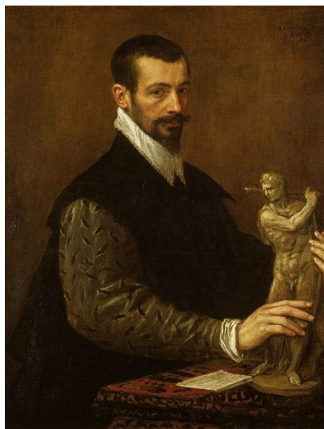
[VII] Leandro Bassano, Portrait of Tiziano Aspetti Holding a Statuette , 1592 – 1593