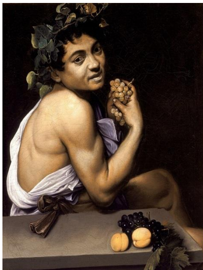
[X] Michelangelo Merisi da Caravaggio, Young Sick Bacchus , 1593

work, characterised by strong drama achieved with the use of light and shadow, significantly influenced painting not only in Italy, where he was active but also abroad 74 .