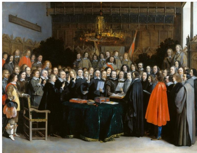
[XIV] Gerard ter Borch, The Ratification of the Treaty of Münster , 15 May 1648, 1648