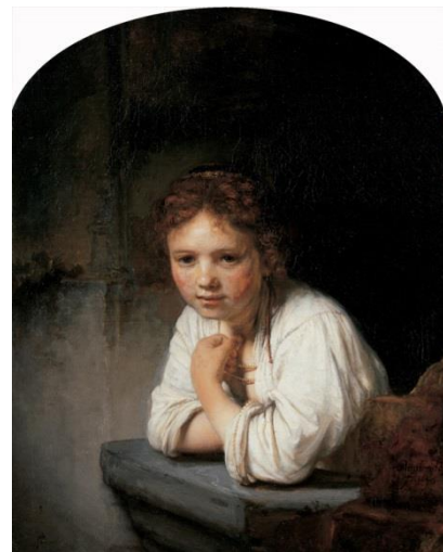
[XII] Rembrandt Harmenszoon van Rijn, Girl in the Window , 1645