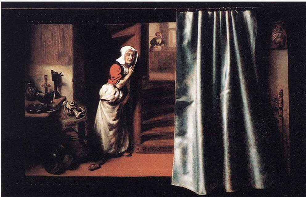
[XX] Nicolaes Maes, The Eavesdropper , 1655, Private collection