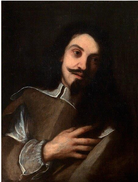
[IV] Tiberio Tinelli, Portrait of Karel Škréta , 1635, National Gallery Prague