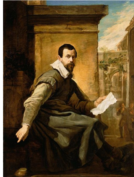
[IX] Domenico Fetti, Portrait of a Man with a Sheet of Music , 1620

Although there were no foreign artists, who would come to the Czech lands and bring new trends in painting, there was Karel Škréta, who, as described in the previous chapters, travelled to Italy and Germany, where he became acquainted with the works of Italian artists and artists active in the north of the Alps. At that time, several important painters were active in Italy, whose work Karel Škréta could follow. While in Venice, where Škréta travelled first among the Italian cities, it was Domenico Fetti (1589–1623), who was during that time one of the leading authors of many portrait works, such as the Ideal Portrait of Gonzaga (1620), Portrait of an Actor (1621), or Portrait of a Man with a Sheet of Music (1620), in Rome Škréta got acquainted with the legacy of Michelangelo Merisi Caravaggio (1571–1610), whose