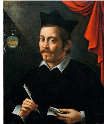
[XI] Michelangelo Merisi da Caravaggio, Portrait of a Prelate , 1592 - 1599

In the Dutch Republic, the leading painter of the 17th century is considered Rembrandt Harmenszoon van