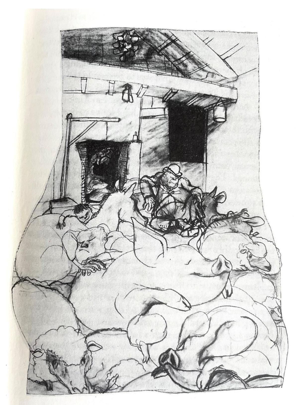
The sheep used often start fighting and many times I went without a wink of sleep from the bleating and the roaring they used have.