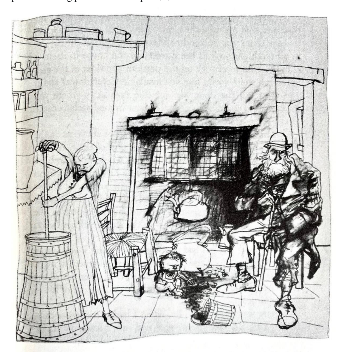
She took a bucket full of muck, mud and ashes and hen's droppings from the roadside, and spread it around the hearth gladly in front of me. When everything was arranged, I moved over near the fire and for five hours I became a child in the ashes—a raw youngster rising up according to the old Gaelic tradition. Later at midnight I was taken and put into bed but the foul stench of the fireplace stayed with me for a week; it was a stale, putrid smell and I do not think that the like will ever be there again.

His net worth is currently estimated at $8 million, with some of his auctioned pieces reaching price estimates up to $4,000.<sup>38</sup>