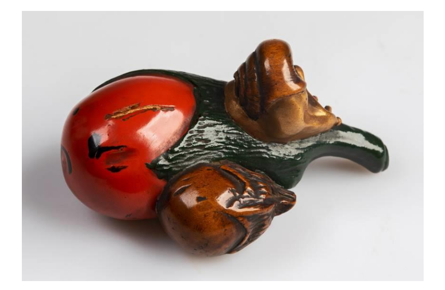
13/ Object 32.255, from the front