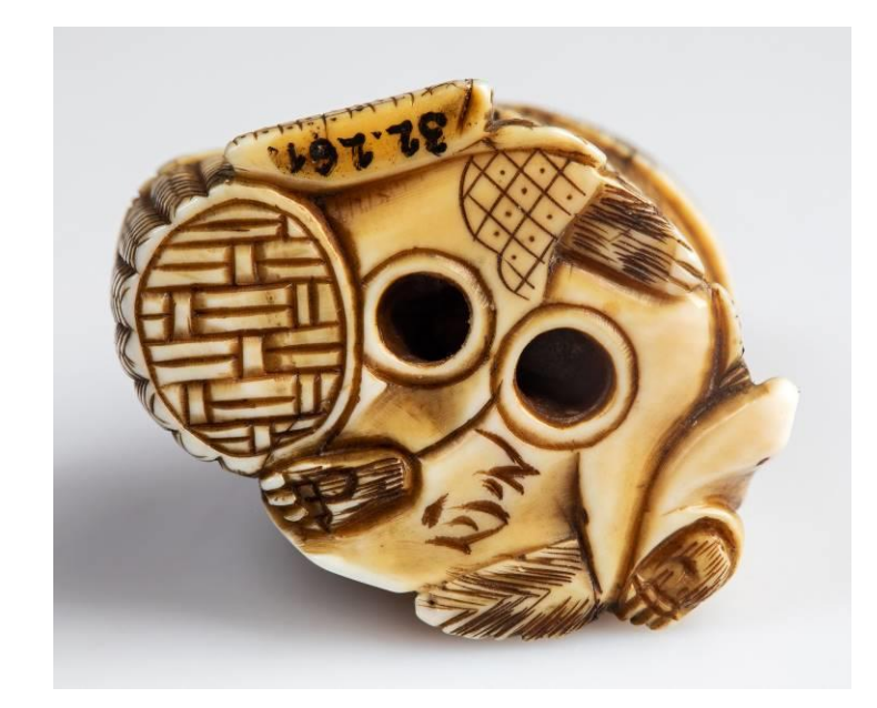
23/ Object 32.261, from the bottom