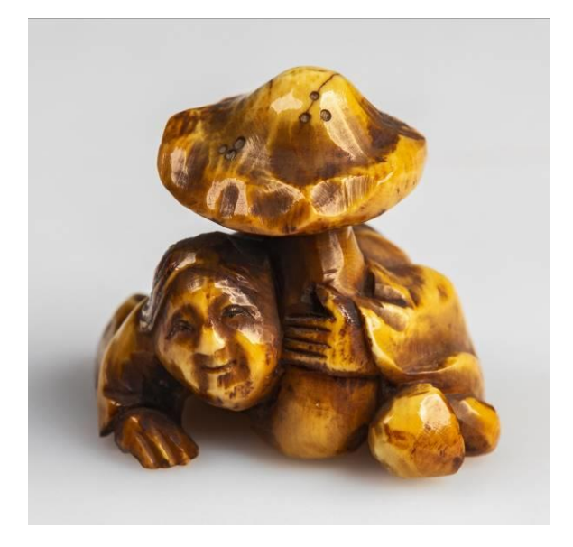
26/ Object 32.275, from the front