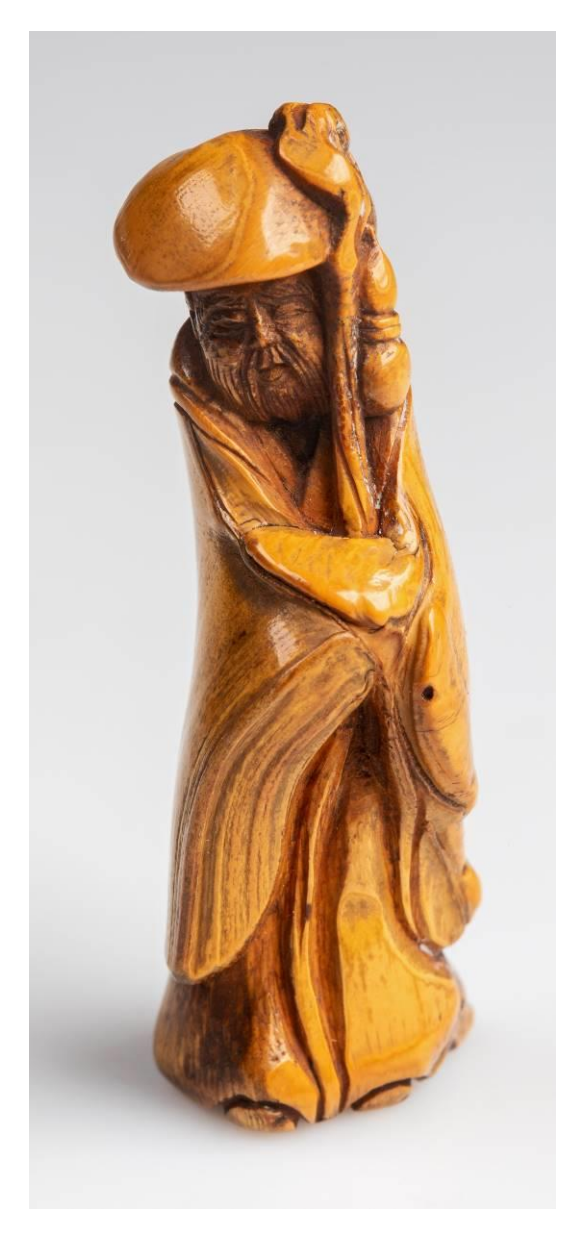
5/ Object 11.557, from the front