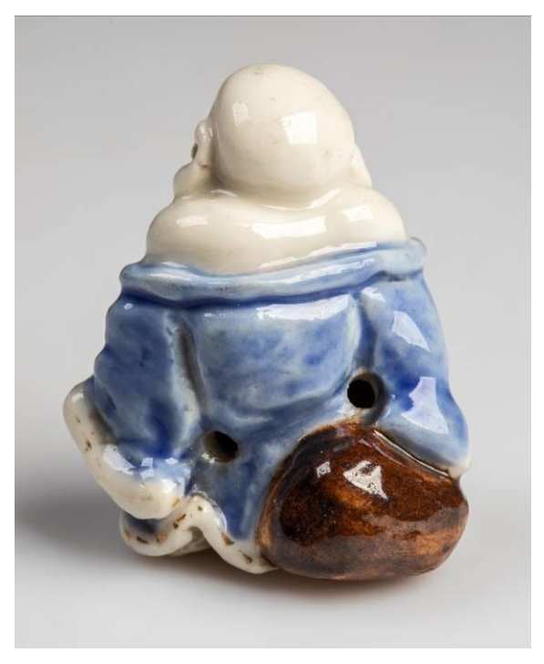
44/ Object 32.307, from the back