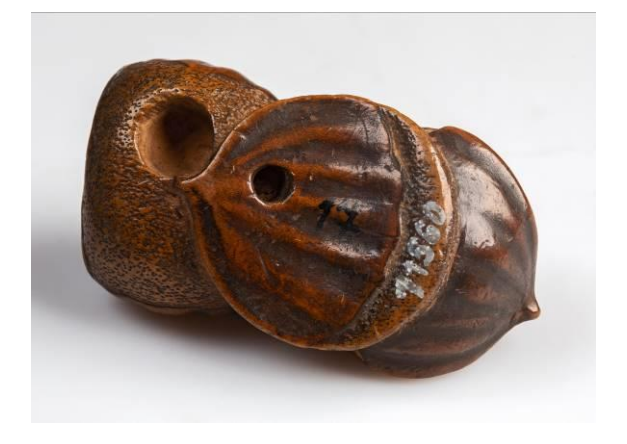
8/ Object 11.560, from the back