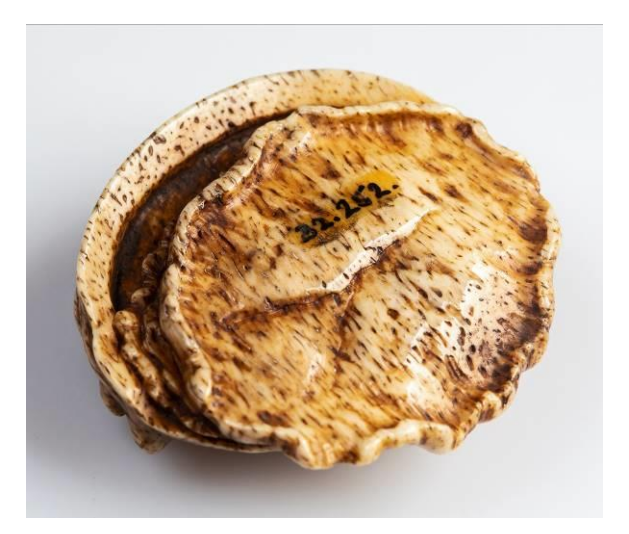
12/ Object 32.252, from the back