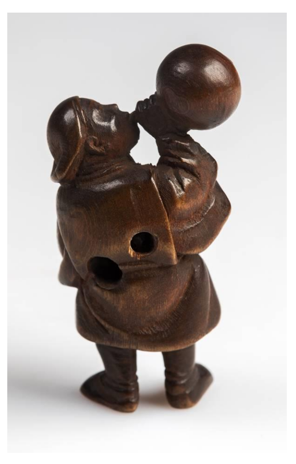
9/ Object 32.260, from the front