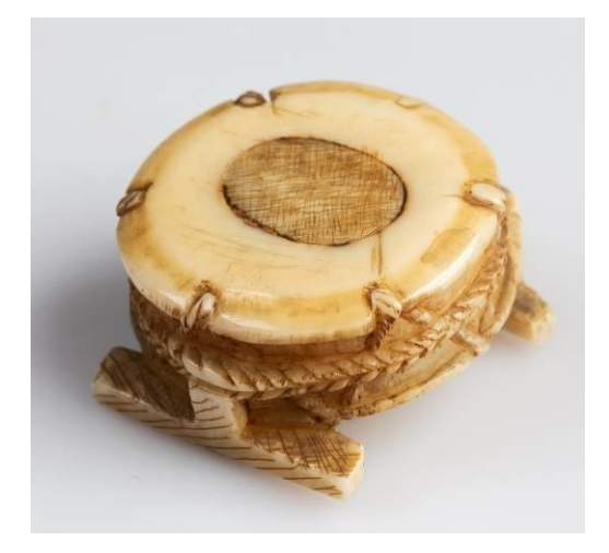
28/ Object 32.276, from the top