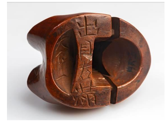
36/ Object 32.285, from the back