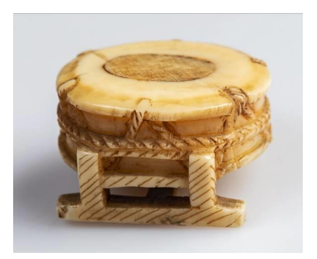
29/ Object 32.276, from the side