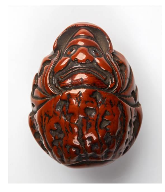
32/ Object 32.284, from the front