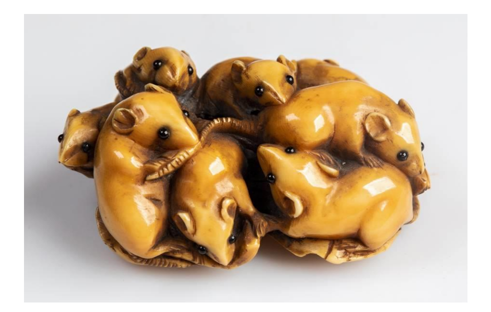
49/ Object 32.321, from the top