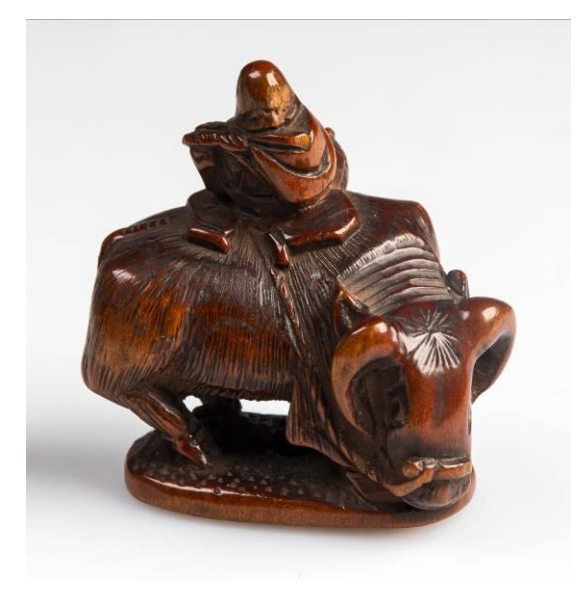
37/ Object 32.288, from the front