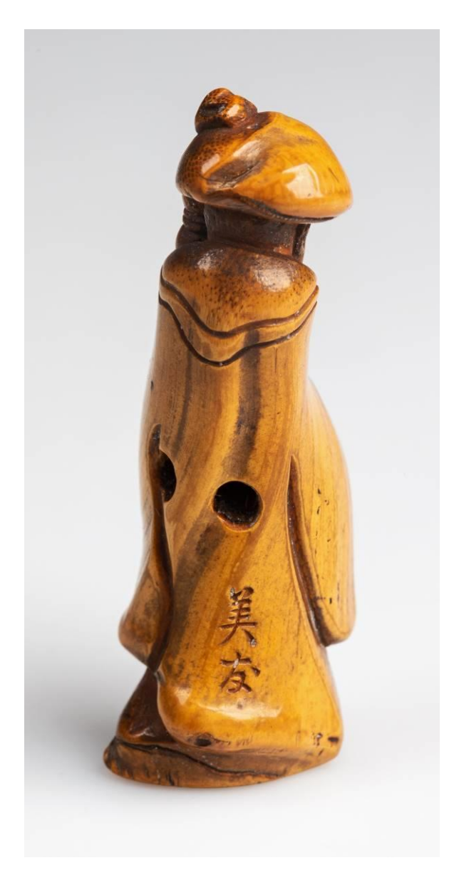
6/ Object 11.557, from the back