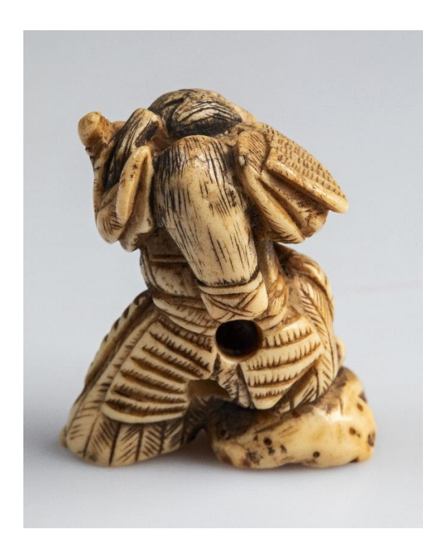
40/ Object 32.292, from the back