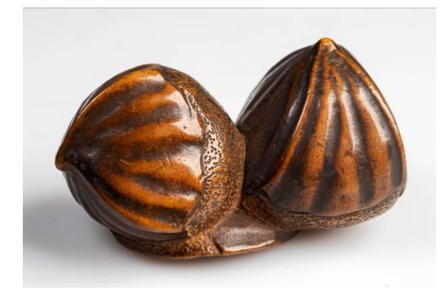
7/ Object 11.560, from the front