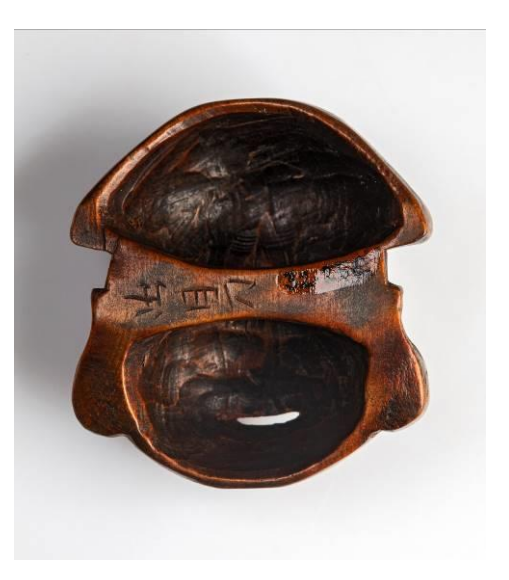
16/ Object 32.256, from the back