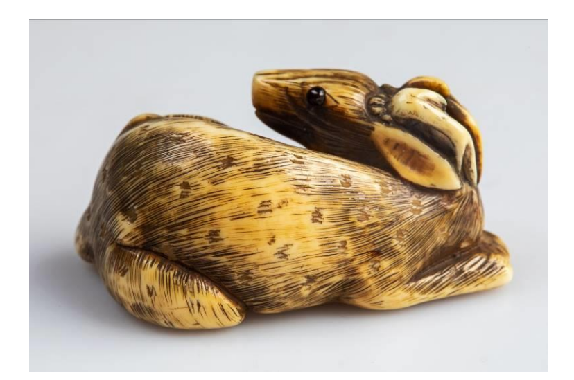
18/ Object 32.257, from the back