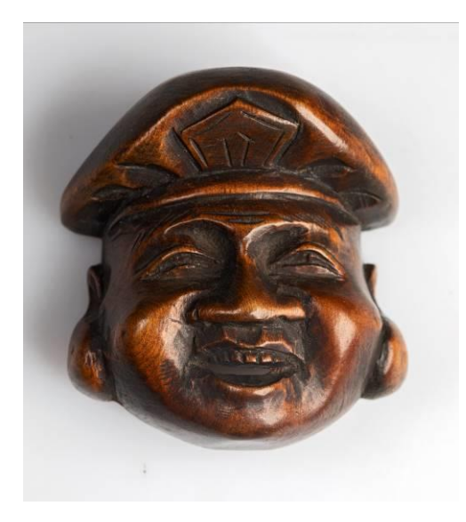
15/ Object 32.256, from the front