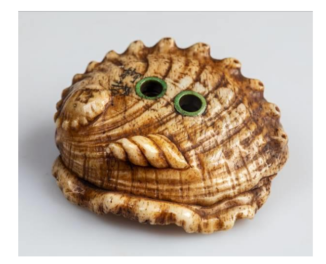
11/ Object 32.252, from the front