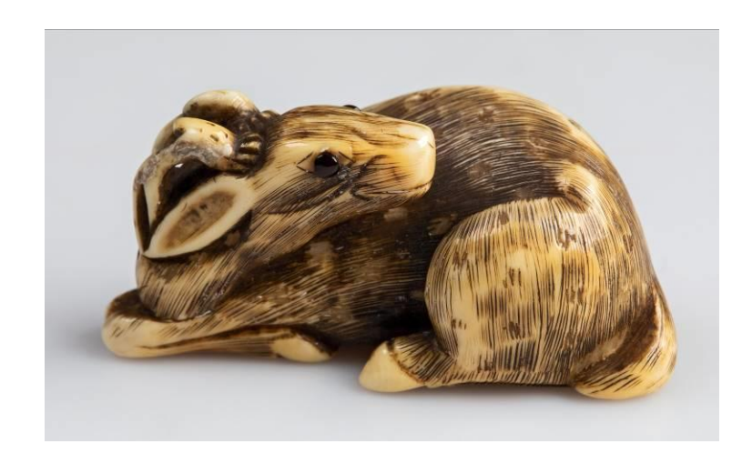
17/ Object 32.257, from the front