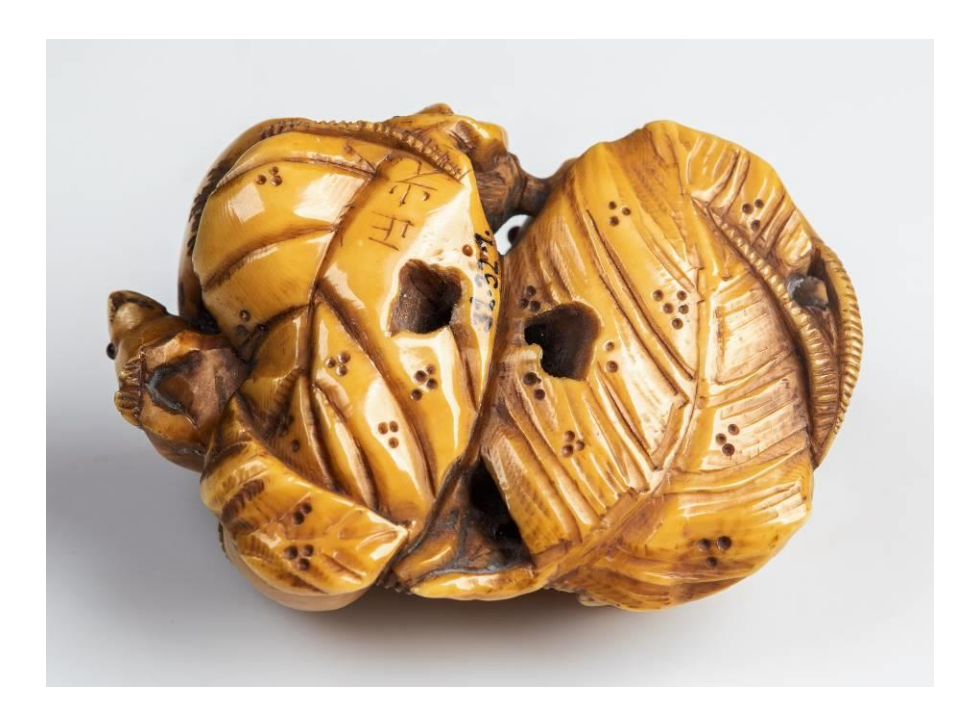
50/ Object 32.321, from the bottom