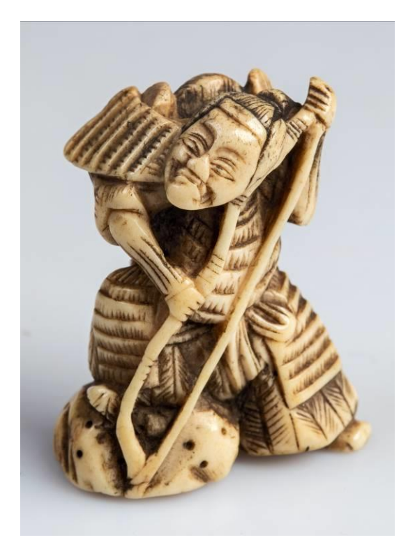
39/ Object 32.292, from the front