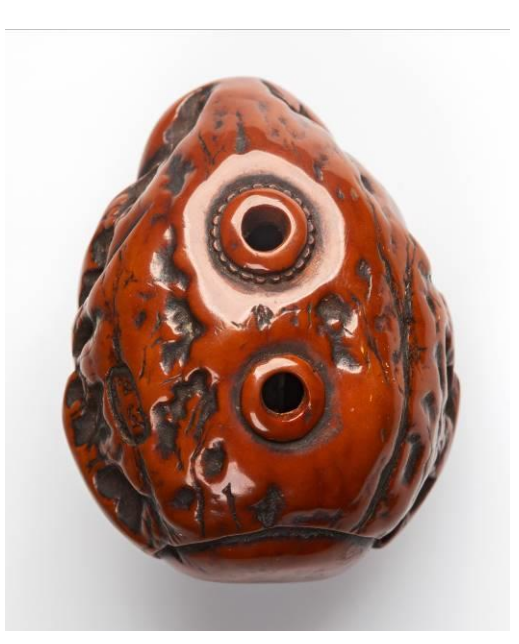
33/ Object 32.284, from the back