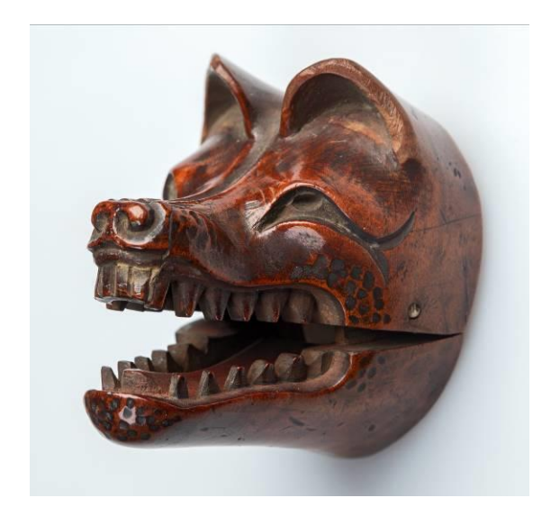
34/ Object 32.285, from the front