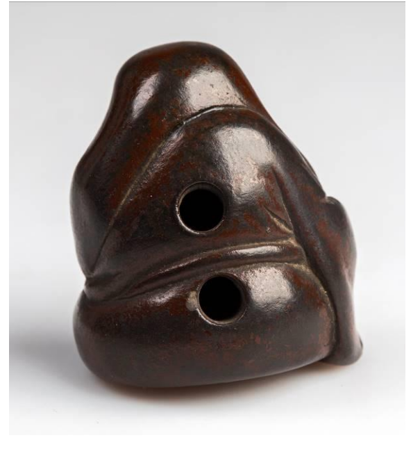
4/ Object 11.556, from the back