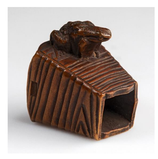
19/ Object 32.259, from the front