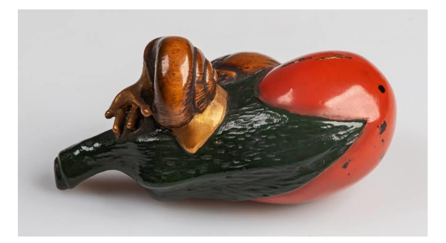
14/ Object 32.255, from the back