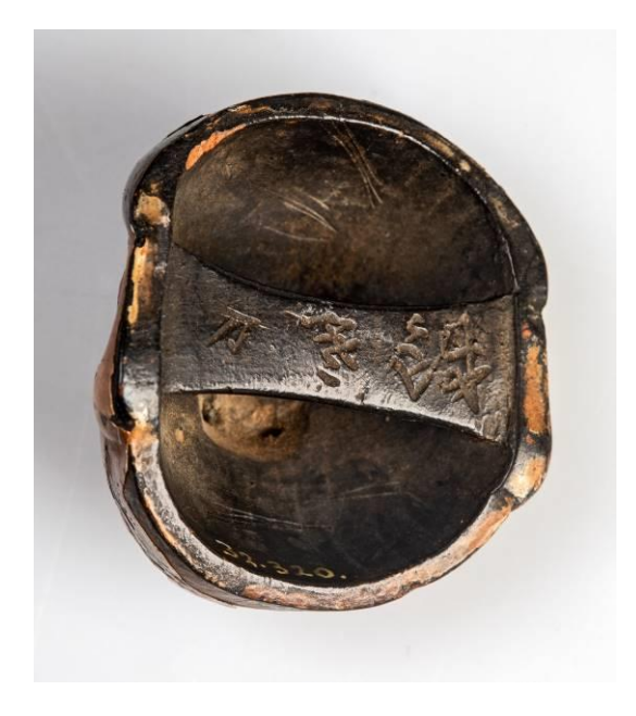
48/ Object 32.320 from the back