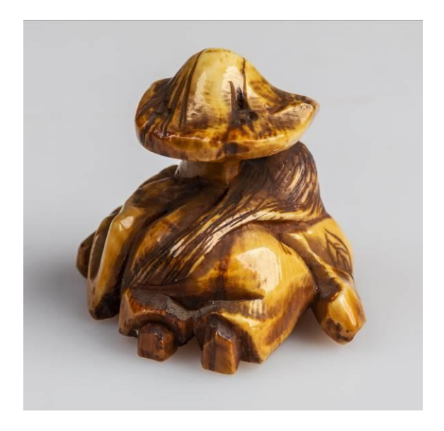
27/ Object 32.275, from the back