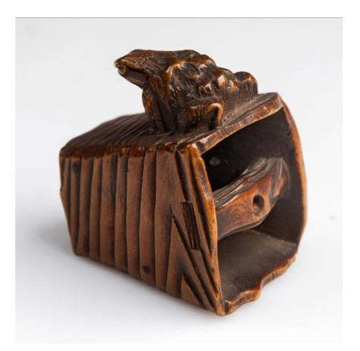
20/ Object 32.259, from the back