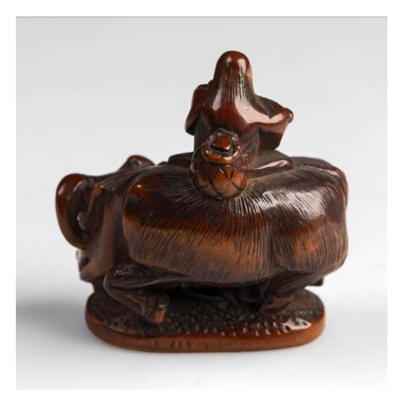
38/ Object 32.288, from the back