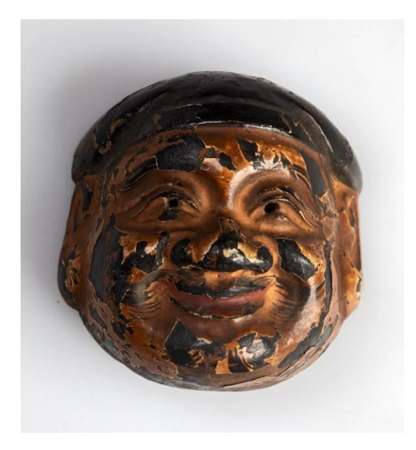
47/ Object 32.320, from the front