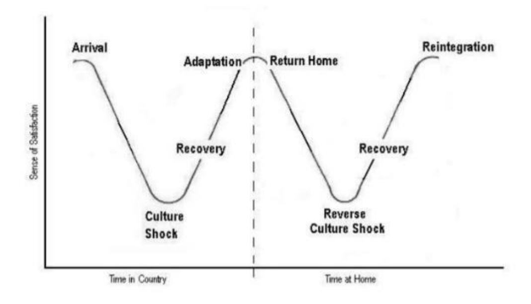
Figure 3: The W-curve: cultural adjustment

must readjust and adapt their identity to function properly. Parts of this readjustment process are acclimatization with the environment, personal finances and getting used to the corporate structure again (Adler, 1981, pp. 344–350). This process is also described as a "reverse culture shock" (Gullahorn & Gullahorn, 1963, pp. 41–46). This is often a major challenge in the repatriation process, which could possibly be simplified and improved with support from the organization.