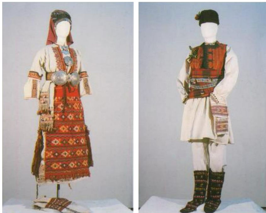
Examples of Traditional Bulgarian Clothing