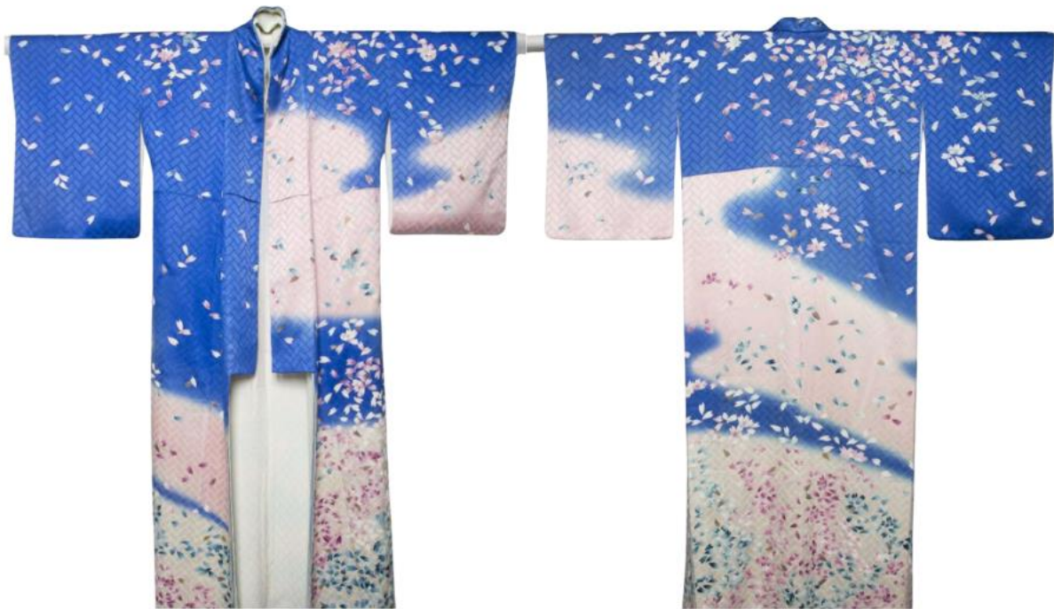
Figure 2 Kimono, Dräkt (mid-20 th century)

I have made modifications removing the background of the image.