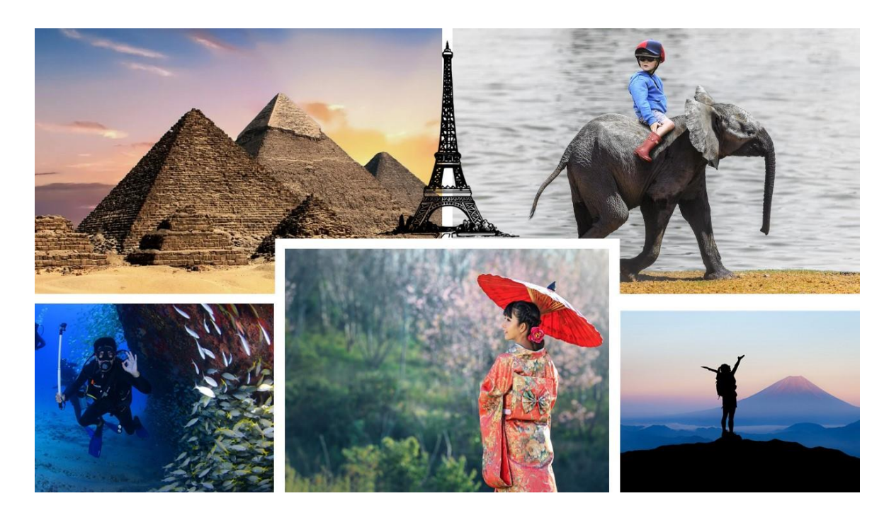
Appendix 4: Pictures of Experiences