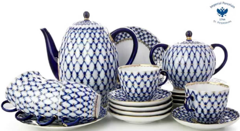
Source: Products of the Imperial Porcelain Factory, service