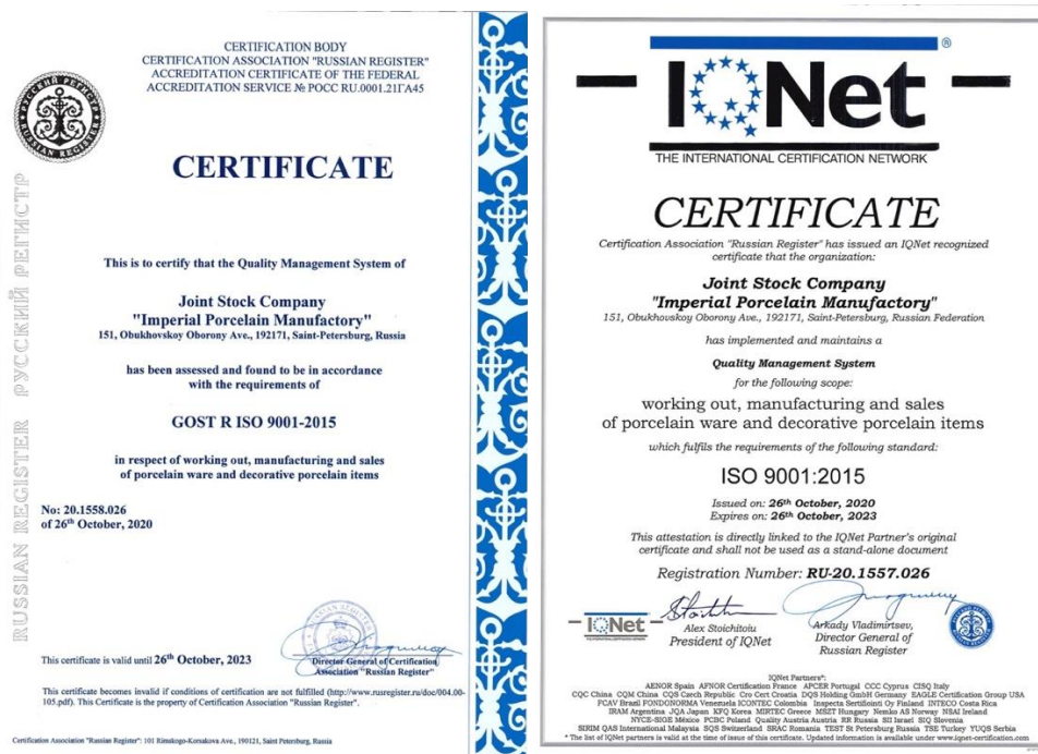
Figure 5 - Certificates of the Joint Stock Company "Imperial Porcelain Manufactory"