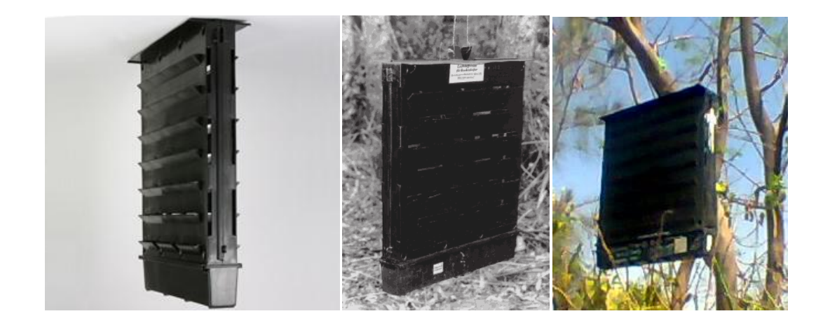
Fig. 2. Theysohn pheromone slot traps (Ridex s.r.o., Vrbno pod Pradědem, Czech Republic), hanged on trees in experimental area.

Theysohn pheromone slot traps (Ridex s.r.o., Vrbno pod Pradědem, Czech Republic) were hanged on fruit trees 2 m above the ground. A 49- \times 49-cm collection sheet was installed 1.5 m above the ground. Five traps were distributed in both localities (in 20 to 50 m spacing). Orientation was perpendicular to wind direction (North to West) Fig (2).