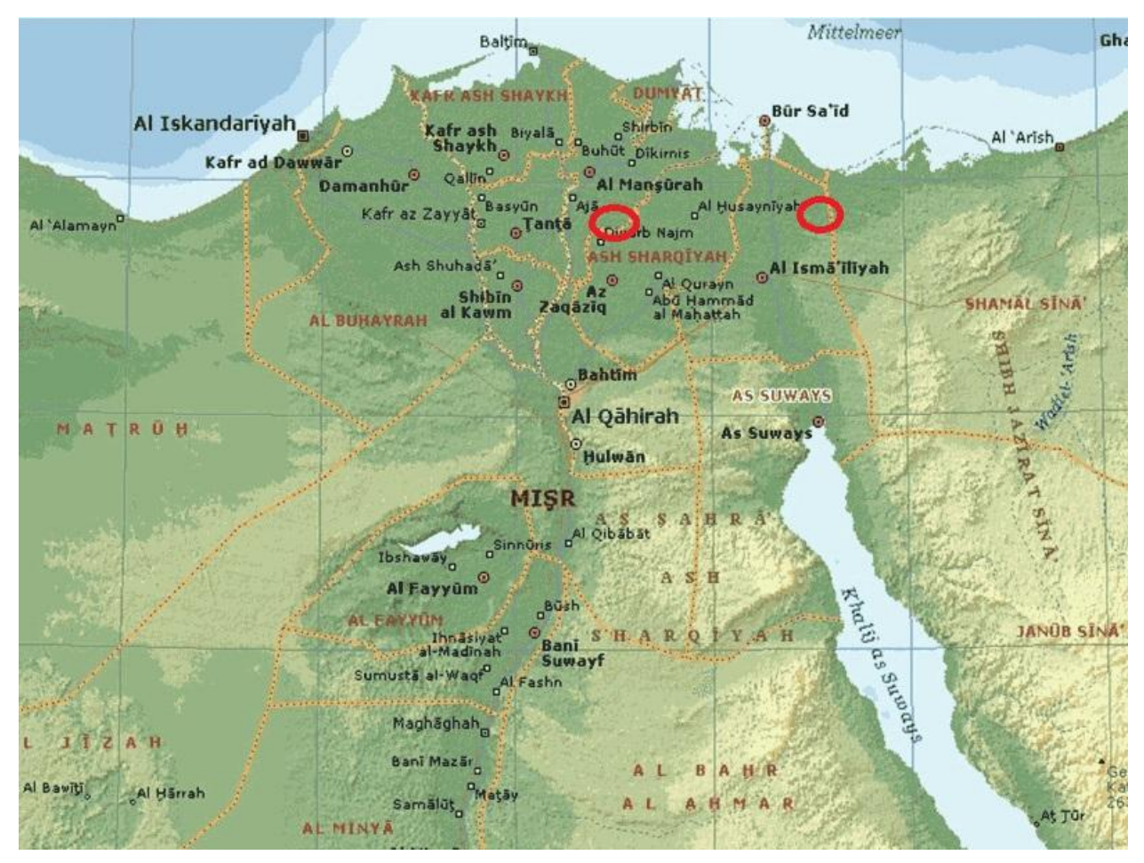
Fig. 1. Map of Delta Egypt cleared 10 sites of pheromone traps distributed in both two localities (Sharkia and Ismailia) during period (May till September 2012)

The field experiments were carried out at two localities, Ismailia (30°35'N 32°16'E) and Sharkia (30°36'27"N, 31°44'47"E) localities in Egypt Fig. (1). Ismailia locality is placed at Suez Canal and Mediterranean Sea, 20 km southerly from the Mediterranean seashore (Port Fuad). Sharkia locality is placed in the delta of river Nile the distance 84 km south-westerly from the Mediterranean seashore (Port Fuad). Both localities are placed in wind blowing direction. In the area of Gulf of Suez, the average wind speed is ranging between 7 - 10 m/s on the ability to a height of 50 m from the surface of the earth, and the wind speed is high especially in the direction of west to east of the river Nile Valley, between latitudes 27°N, 29°south (Abd Allah, 2013).