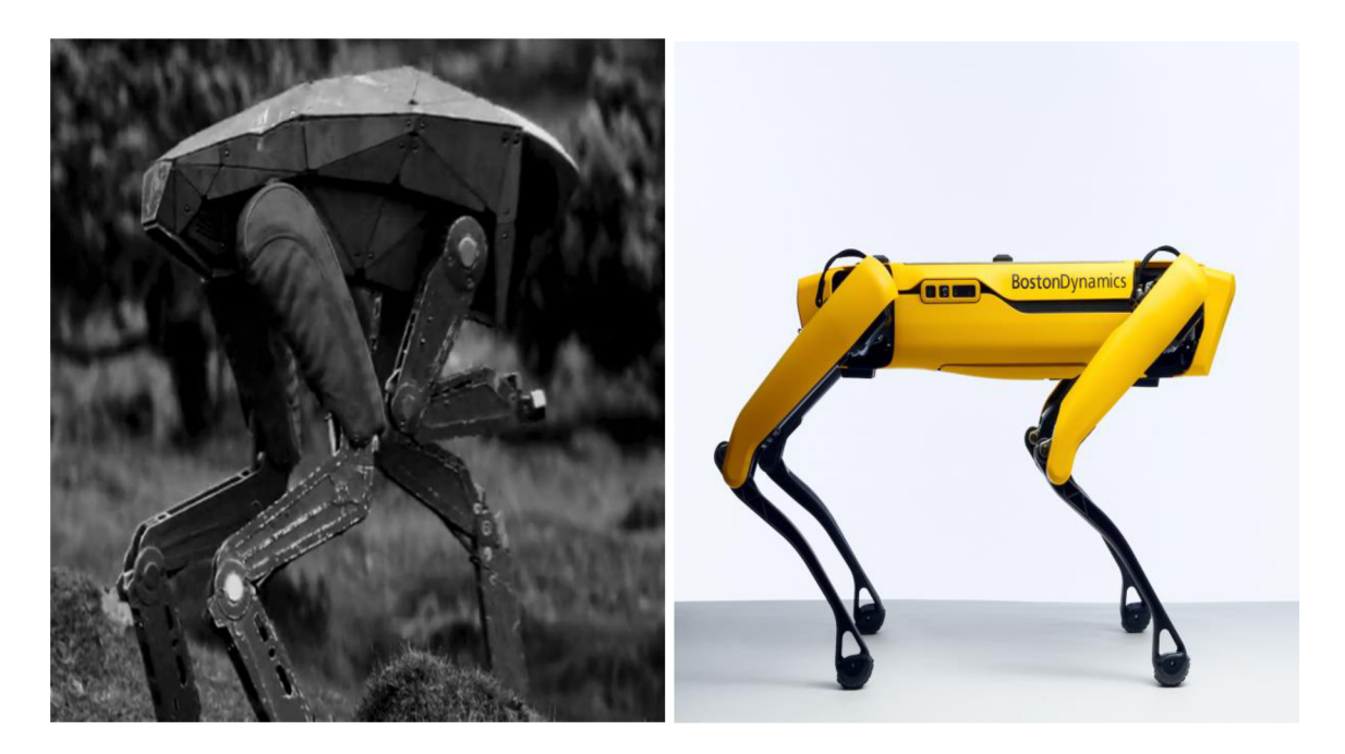
Figure 3. The dog

of it can be different, depending on the industry where it is applied. The Spot is available to developers for purchase for $ 74,500 and is ready to work as soon as it arrives ( SPOT ®).