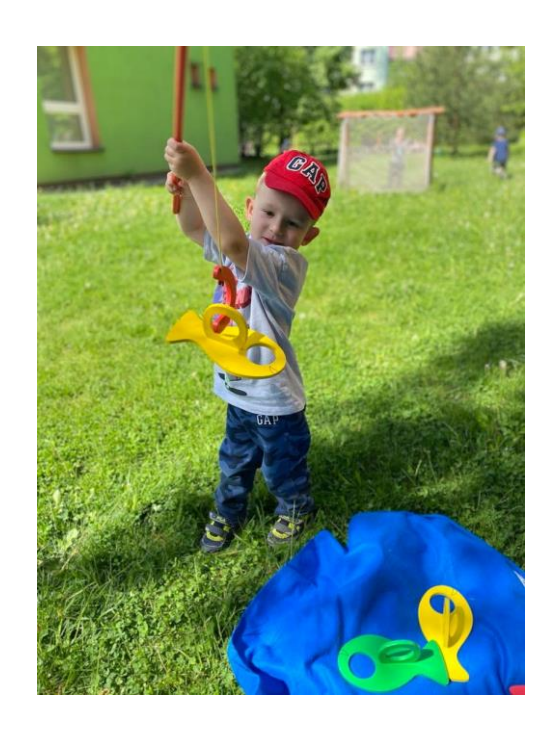
Pic. 4 Game "Gone fishing"