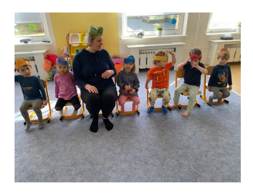
Pic. 11 Dramatization of the story "Brown bear, brown bear, what do you see?"