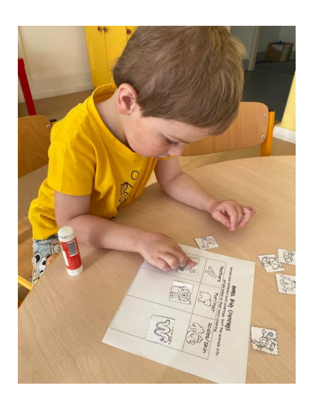
Pic. 10 Individual work on the Animal body covering activity, worksheet taken from https://www.liveworksheets.com/worksheets/en/Science/Animals/Animal_Coverings_fu1406 036if.