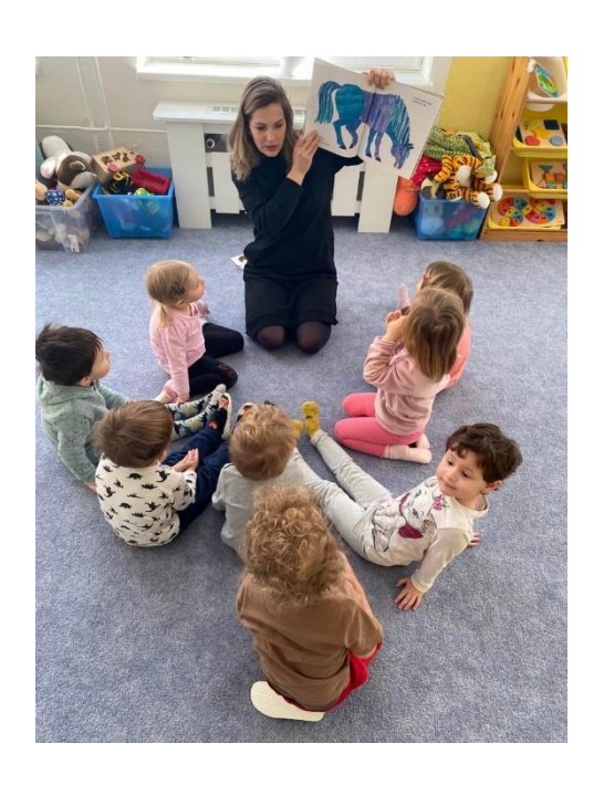
Pic. 2 First telling of the story "Brown bear, brown bear, what do you see?"