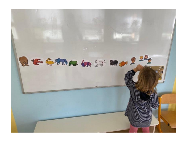
Pic.3 Pictures of the animals used for instruction of the vocabulary, taken from: <a href="https://www.twinkl.cz/resource/t-t-1451-brown-bear-brown-bear-stick-puppets">https://www.twinkl.cz/resource/t-t-1451-brown-bear-brown-bear-stick-puppets</a>.