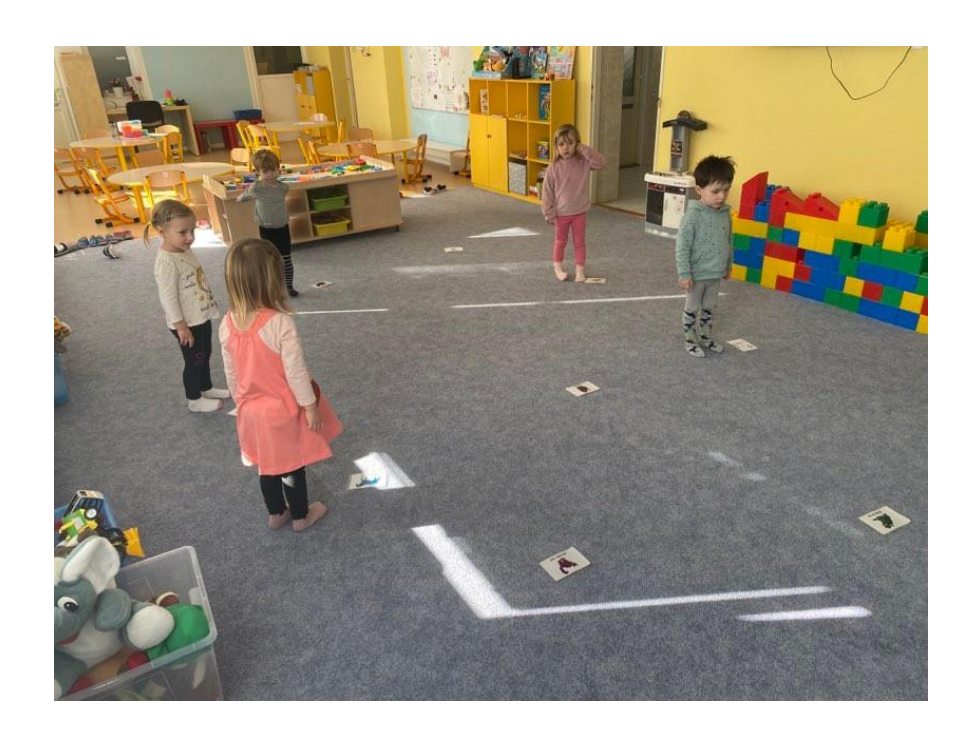
Pic. 12 Playing games with flashcards, taken from https://www.twinkl.cz/resource/t-t-1437a-brown-bear-brown-bear-story-sequencing.