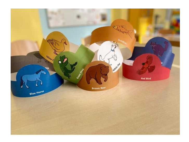
Pic. 6 Animal headbands, taken from https://www.twinkl.cz/resource/t-t-11905-brown-bear-brown-bear-role-play-headbands.