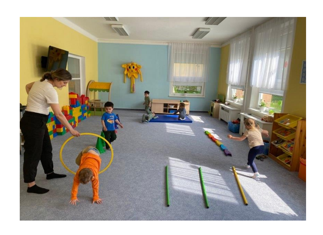
Pic. 9 Doing Obstacle Course during Morning Circle time.