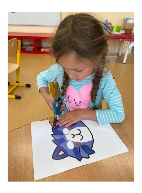
Pic. 7 Making animal masks, taken from https://www.twinkl.cz/resource/t-t-1255-brown-bear-brown-bear-role-play-masks.