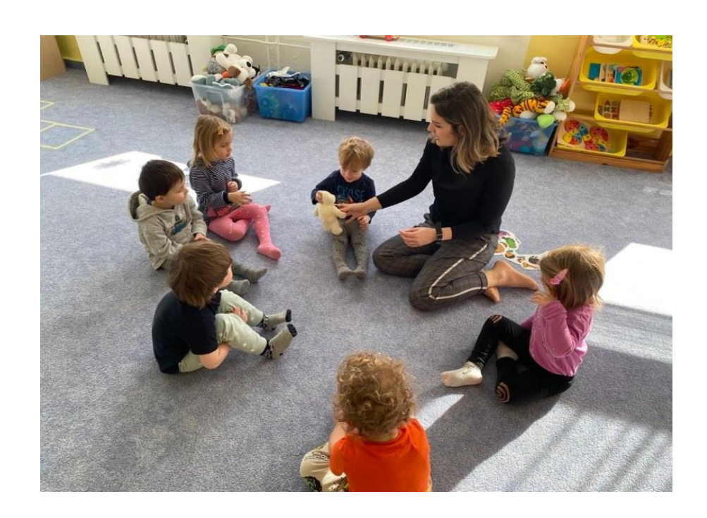
Pic. 8 Playing "Pass the ball (animal)" during Morning Circle time.