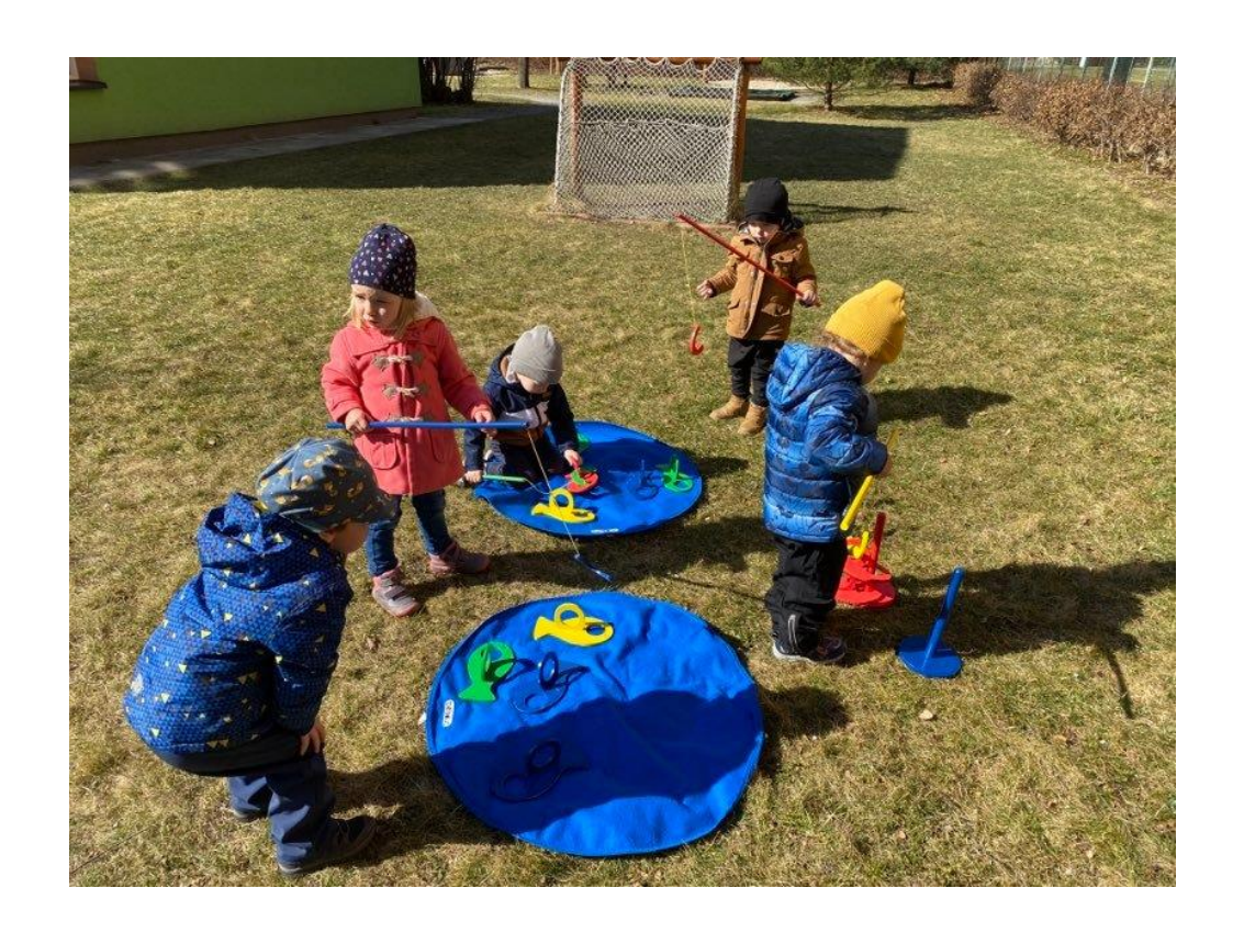
Pic. 5 Children playing game "Gone fishing" (the property of Galileo School).