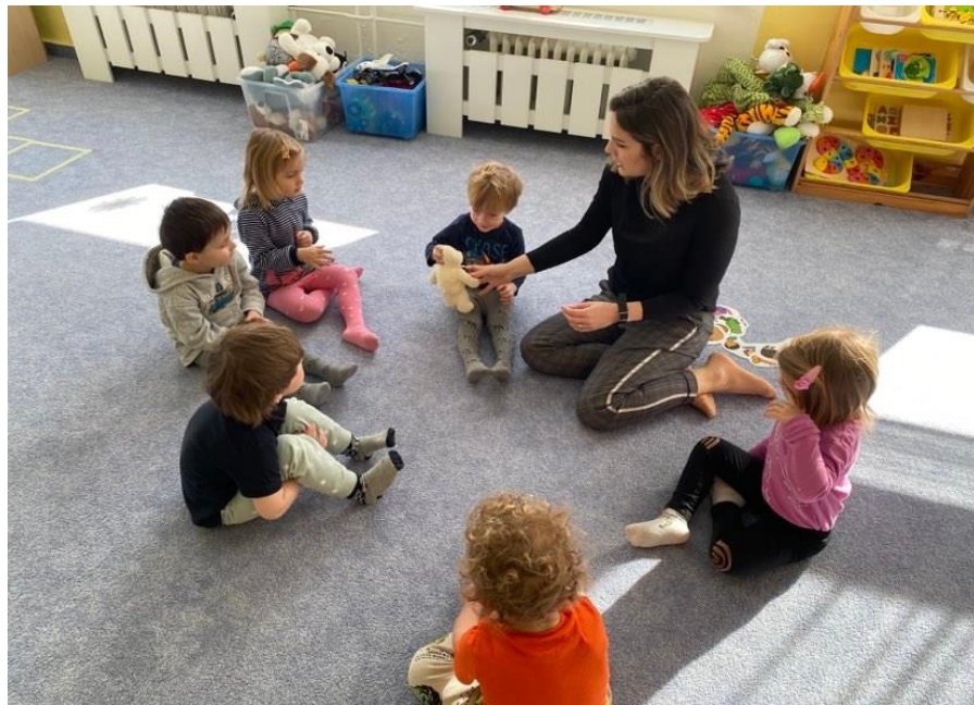
Pic. 8 Playing “Pass the ball (animal)” during Morning Circle time.