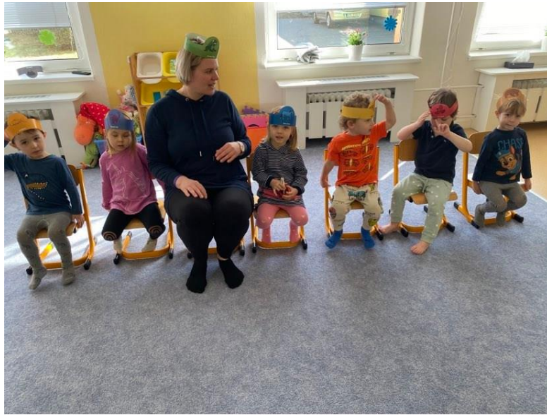
Pic. 11 Dramatization of the story “Brown bear, brown bear, what do you see?”