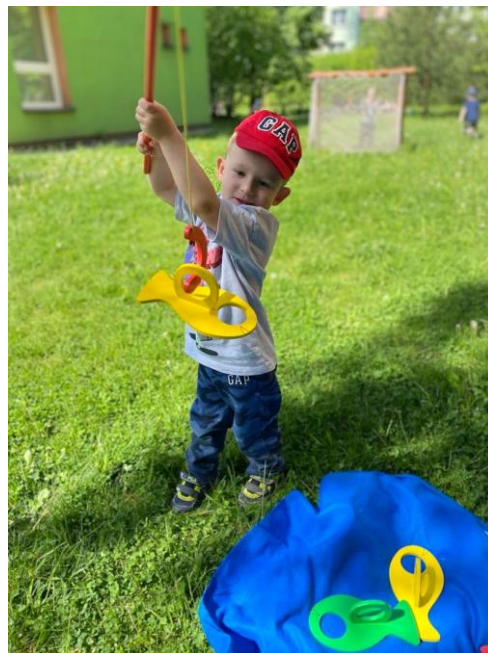
Pic. 4 Game “Gone fishing”