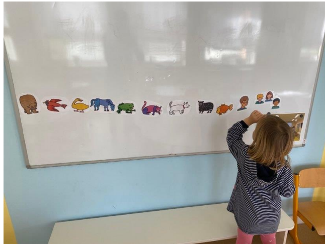
Pic.3 Pictures of the animals used for instruction of the vocabulary, taken from: https://www.twinkl.cz/resource/t-t-1451-brown-bear-brown-bear-stick-puppets.