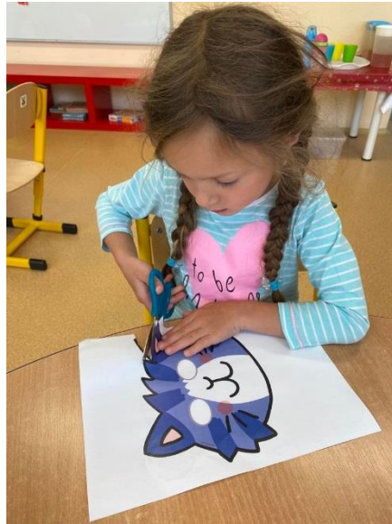
Pic. 7 Making animal masks, taken from https://www.twinkl.cz/resource/t-t-1255-brown-bear-brown-bear-role-play-masks .