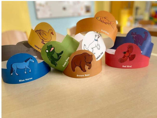
Pic. 6 Animal headbands, taken from https://www.twinkl.cz/resource/t-t-11905-brown-bear-brown-bear-role-play-headbands .