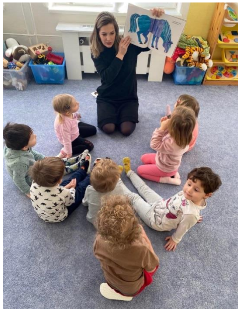
Pic. 2 First telling of the story "Brown bear, brown bear, what do you see?"