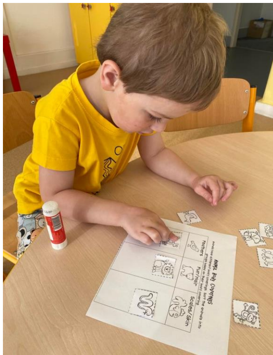
Pic. 10 Individual work on the Animal body covering activity, worksheet taken from https://www.liveworksheets.com/worksheets/en/Science/Animals/Animal_Coverings_fu1406