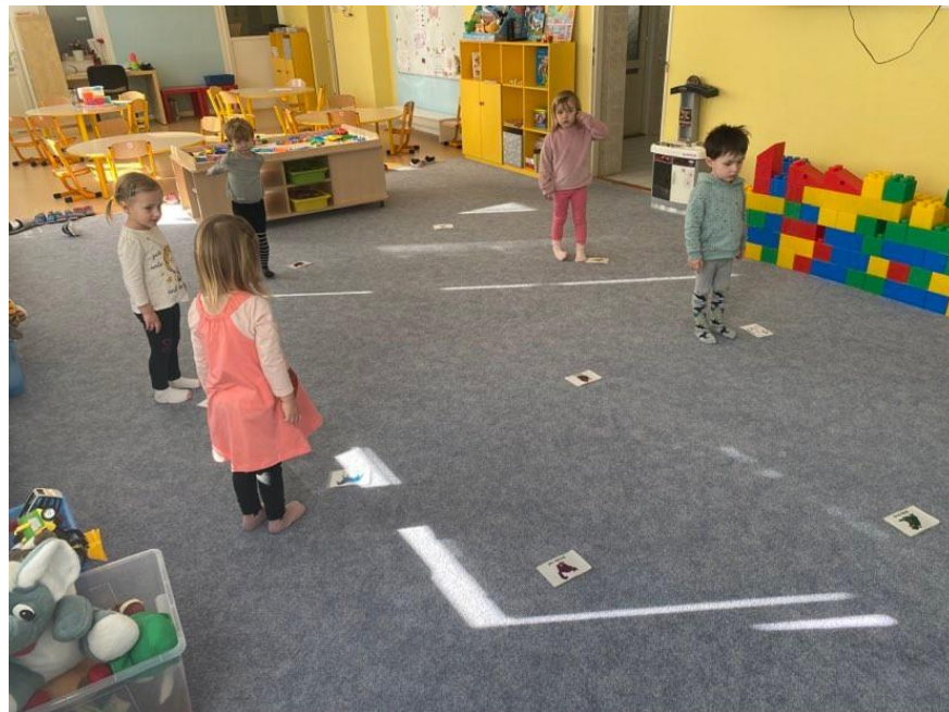
Pic. 12 Playing games with flashcards, taken from https://www.twinkl.cz/resource/t-t-1437a-brown-bear-brown-bear-story-sequencing .