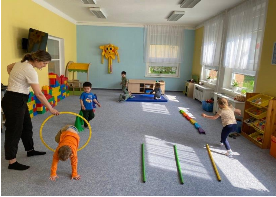
Pic. 9 Doing Obstacle Course during Morning Circle time.