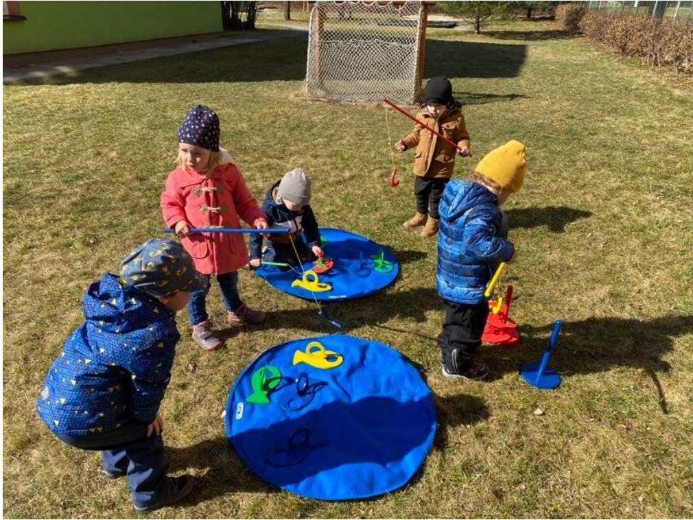
Pic. 5 Children playing game “Gone fishing” (the property of Galileo School).