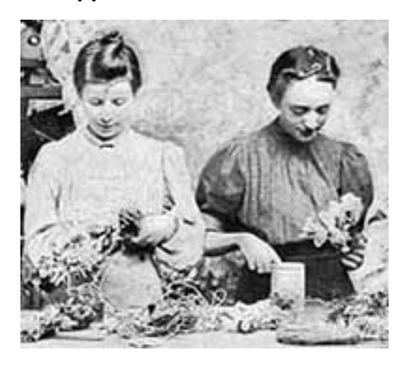
Appendix 1: Workers in a hat factory