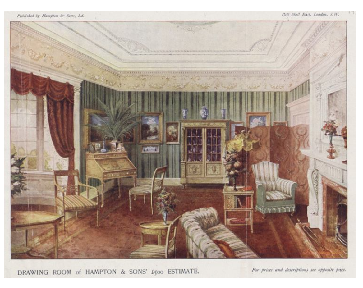
Appendix 2: Drawing room