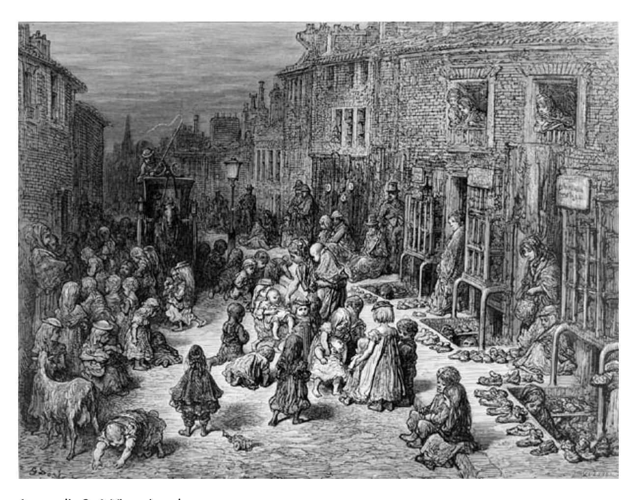
Appendix 3: A Victorian slum