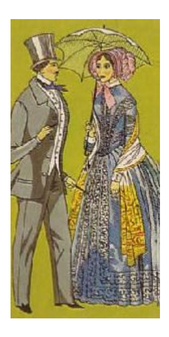
Appendix 7: Day Clothes about 1848/9