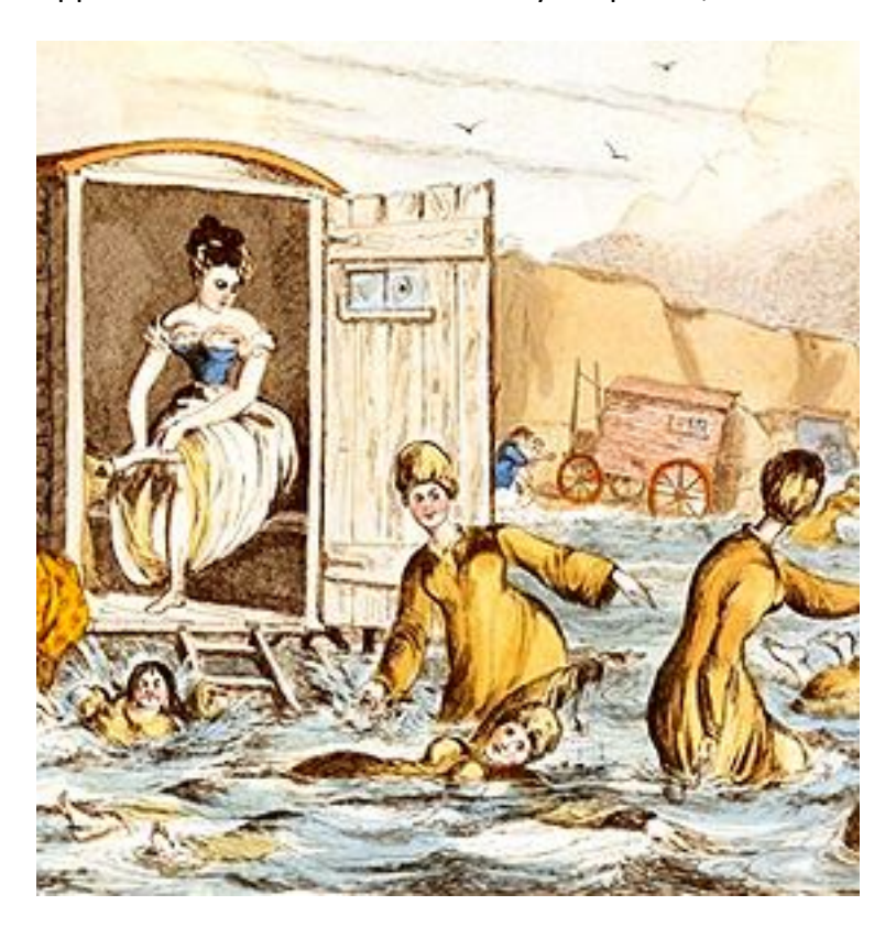
Appendix 6: Bathing machine