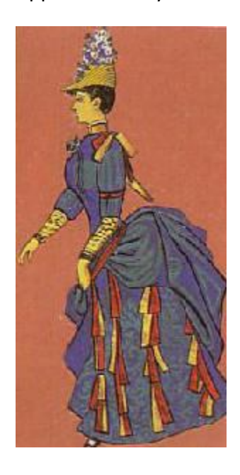
Appendix 8: Lady's Dress about 1885