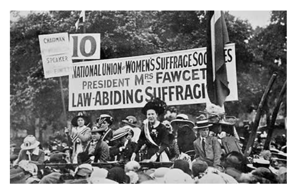
Appendix 4: The NUWSS campaigned peacefully. Here Mrs Fawcett is addressing a rally