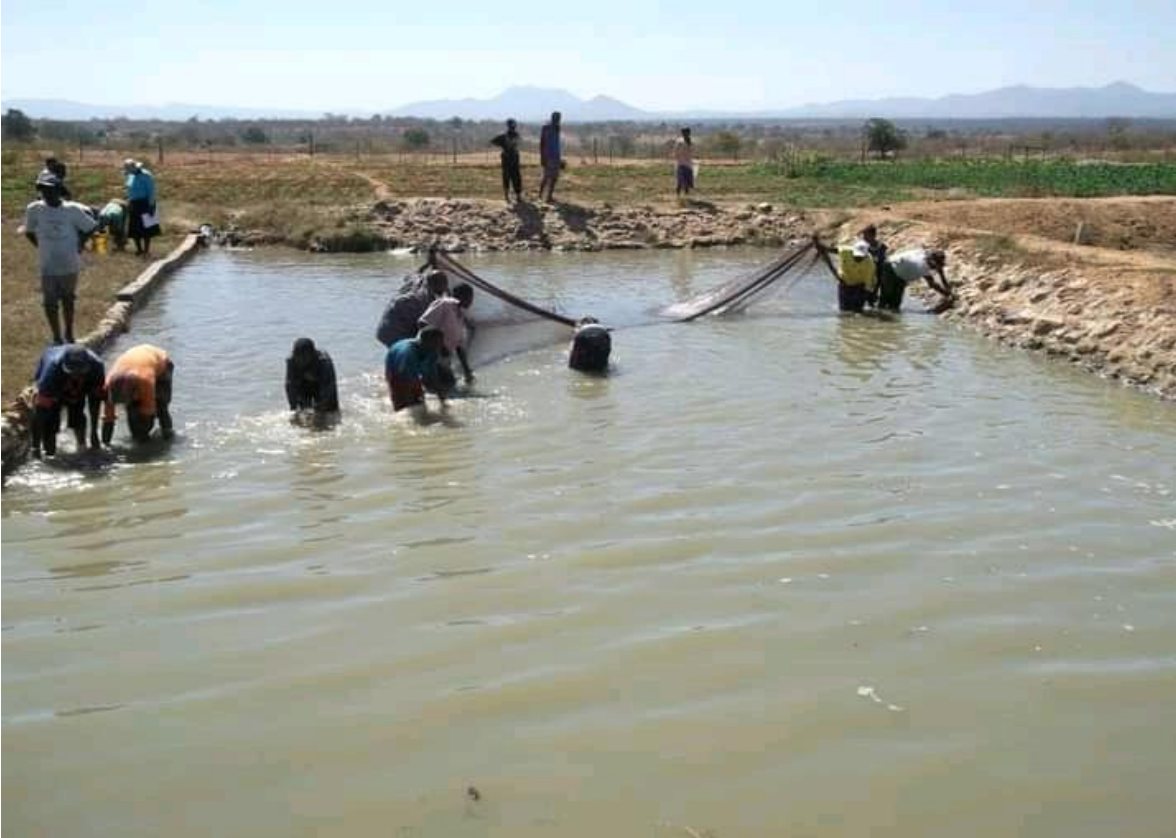
Fish harvesting at Chiwariro cooperative