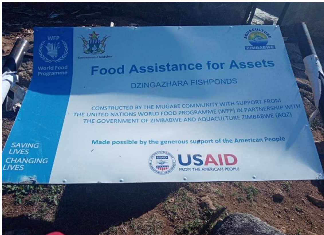
Dzingazhara Cooperative billboard