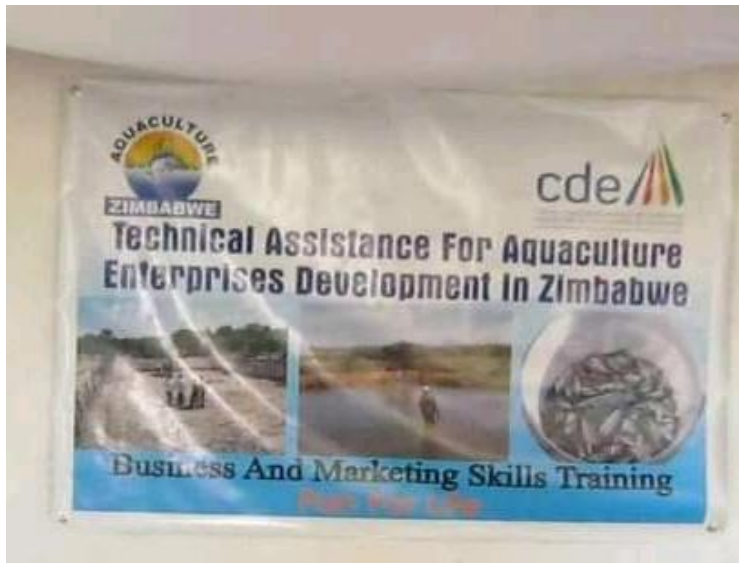
Aquaculture Zimbabwe training materials