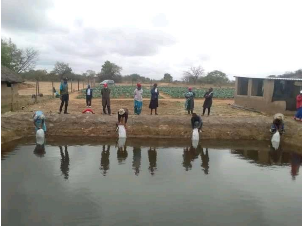
Fish stocking at Mushenjere Cooperative