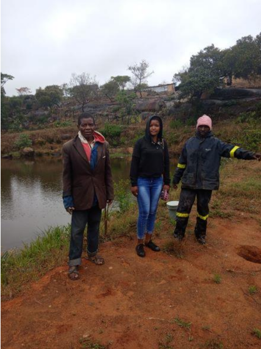
The Author discussing with male members at Dzingazhara Cooperative