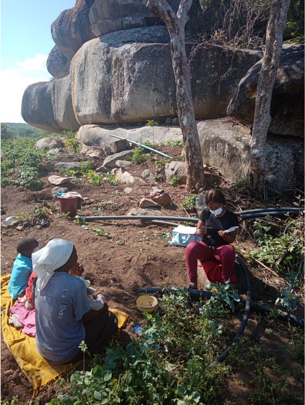
Author interviewing women at Mugwisi Cooperative