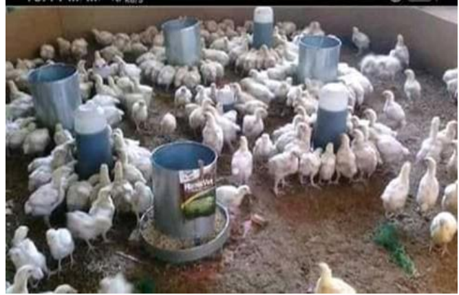
Members engaged in Integrated Agriculture Aquaculture (IAA) doing poultry and vegetable farming