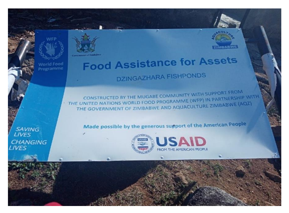
Dzingazhara Cooperative billboard