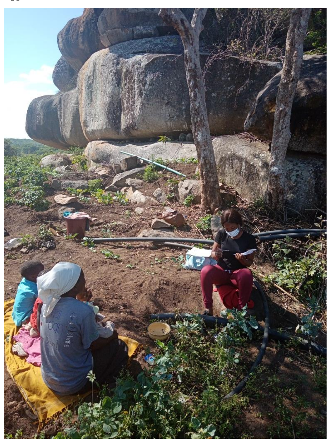
Appendix 3. Photo documentation of research data collection

Author interviewing women at Mugwisi Cooperative