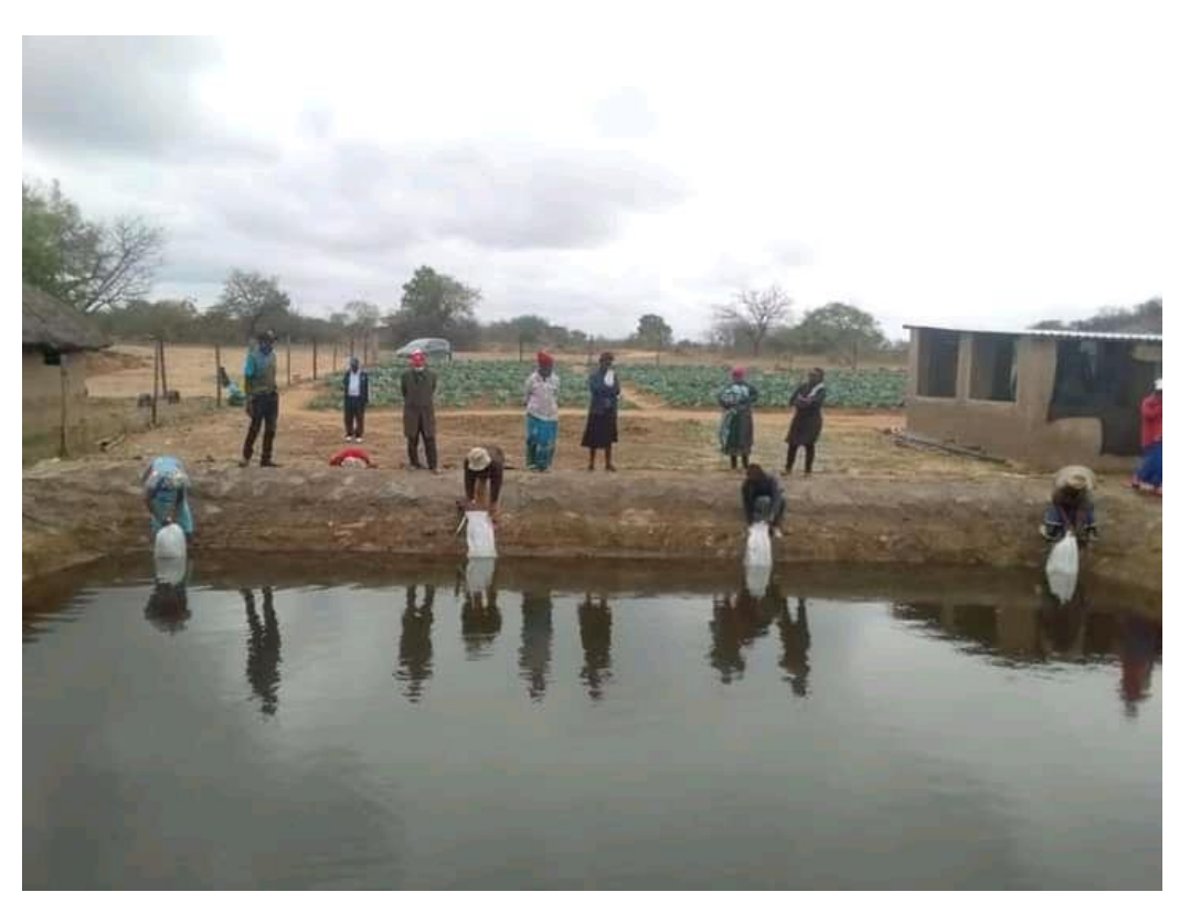
Fish stocking at Mushenjere Cooperative