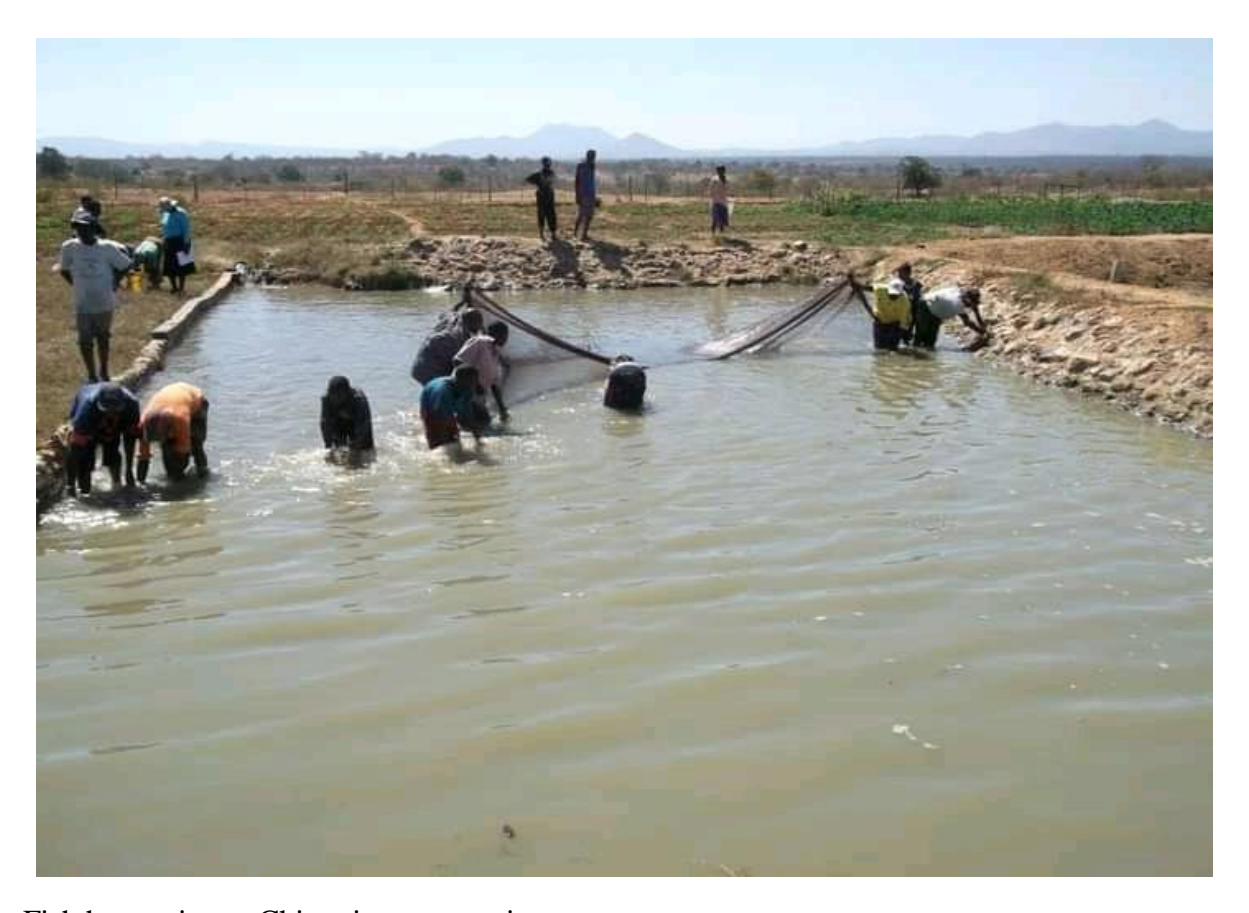
Fish harvesting at Chiwariro cooperative