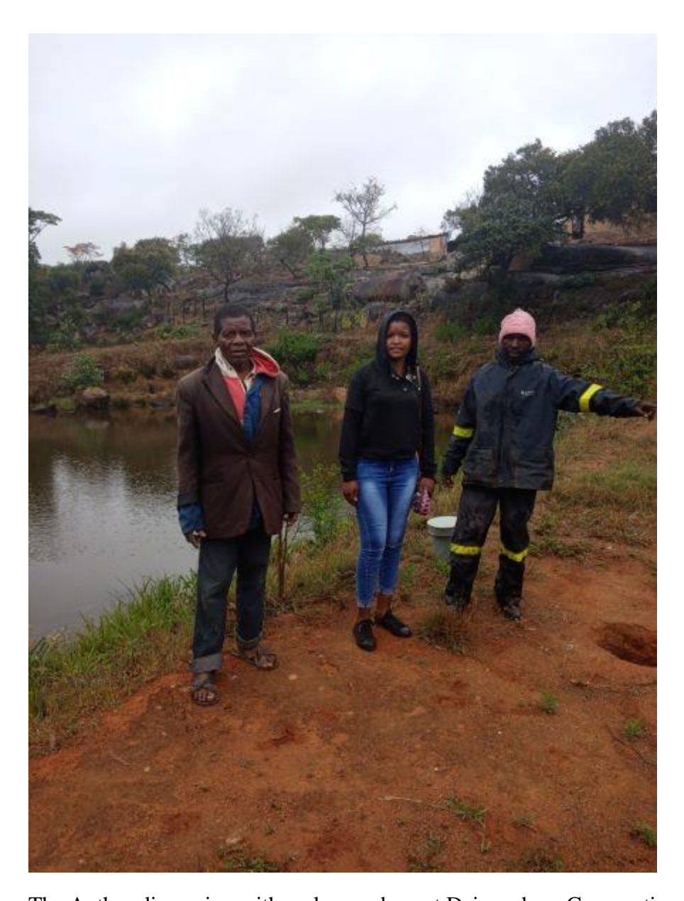
The Author discussing with male members at Dzingazhara Cooperative