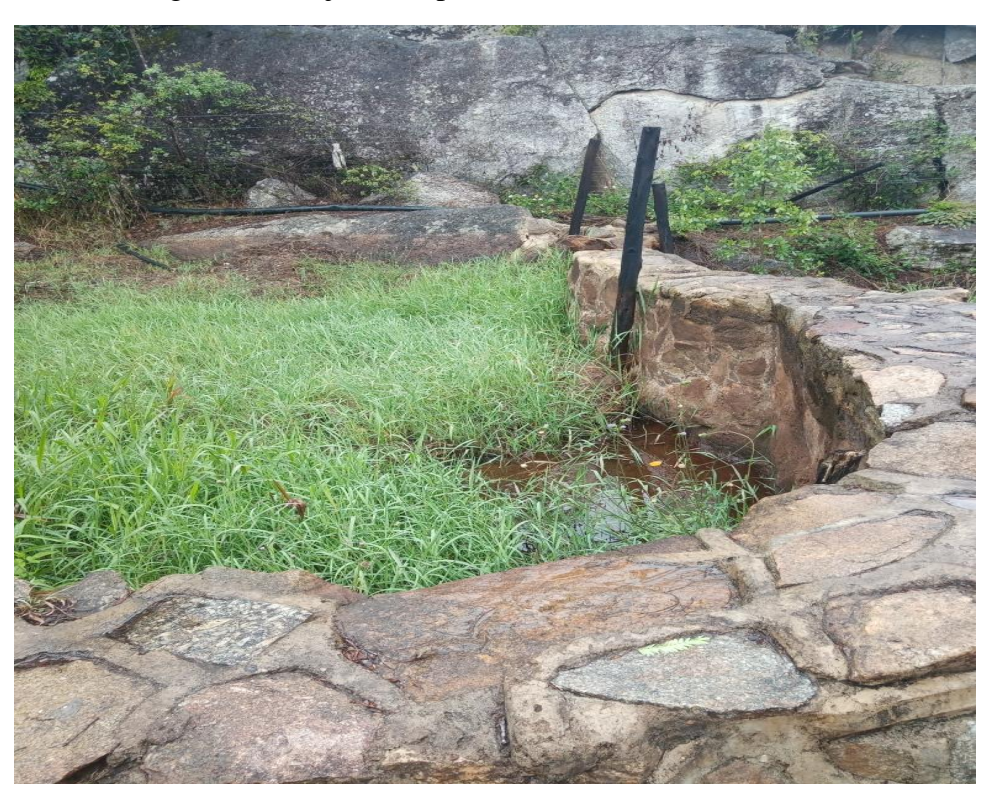
Hatchery pond at a deserted cooperative (Tafara Cooperative)