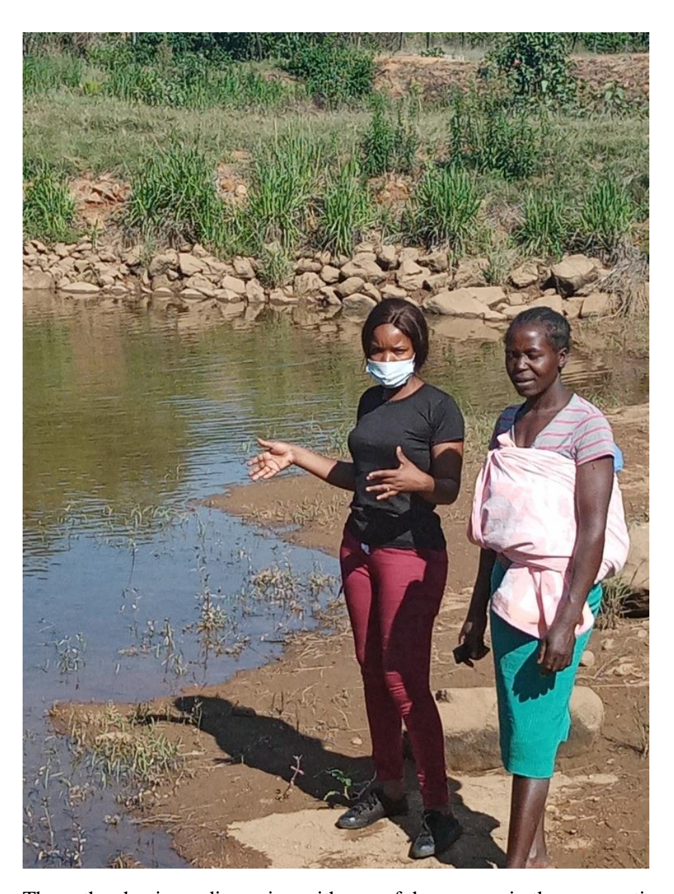
The author having a discussion with one of the women in the cooperative