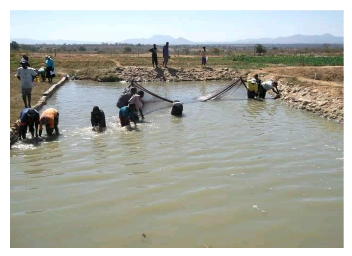
Fish harvesting at Chiwariro cooperative