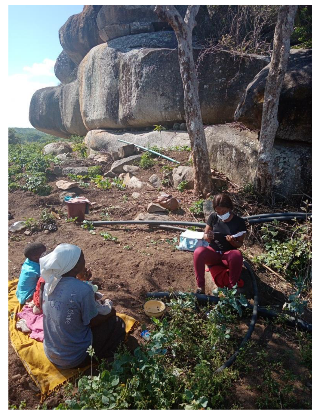
Appendix 3. Photo documentation of research data collection

Author interviewing women at Mugwisi Cooperative