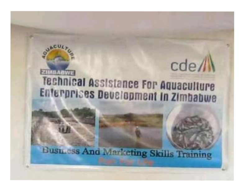
Aquaculture Zimbabwe training materials