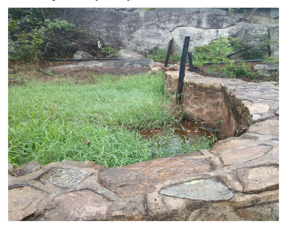
Hatchery pond at a deserted cooperative (Tafara Cooperative)