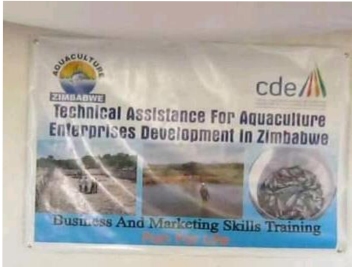
Aquaculture Zimbabwe training materials