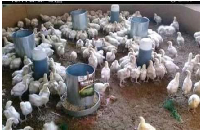
Members engaged in Integrated Agriculture Aquaculture (IAA) doing poultry and vegetable farming