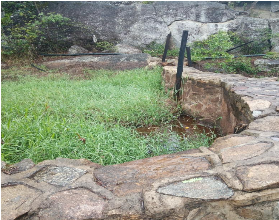
Hatchery pond at a deserted cooperative (Tafara Cooperative)