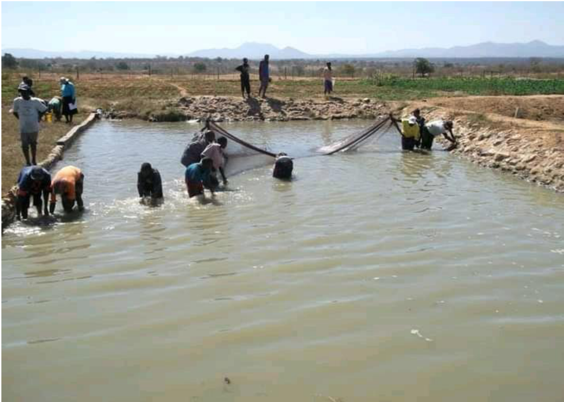
Fish harvesting at Chiwariro cooperative