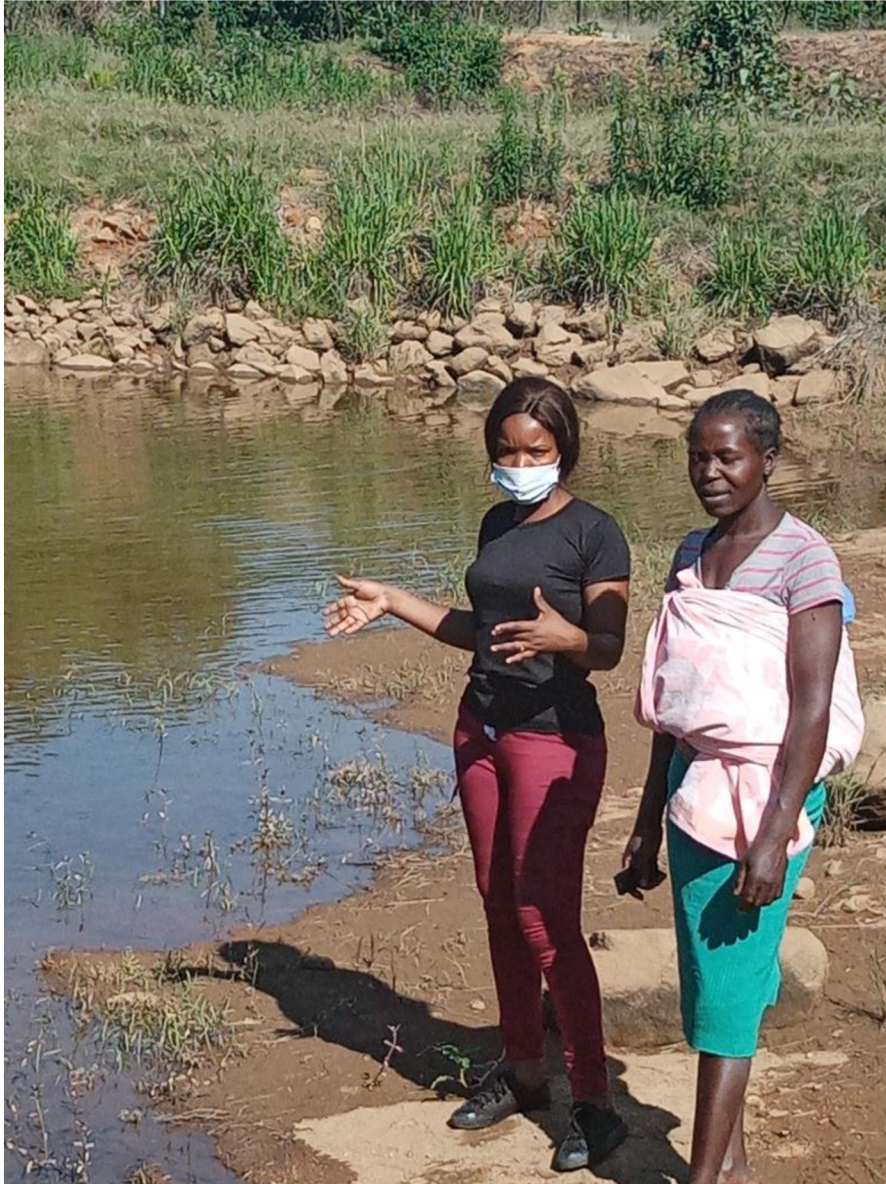
The author having a discussion with one of the women in the cooperative