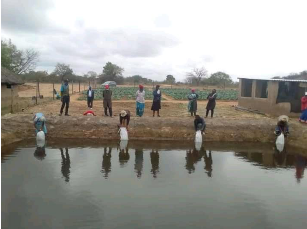
Fish stocking at Mushenjere Cooperative