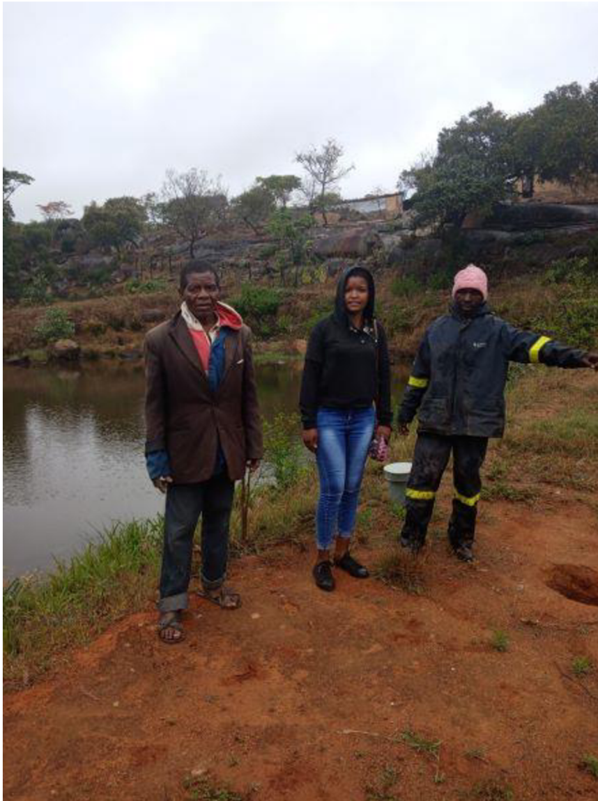
The Author discussing with male members at Dzingazhara Cooperative