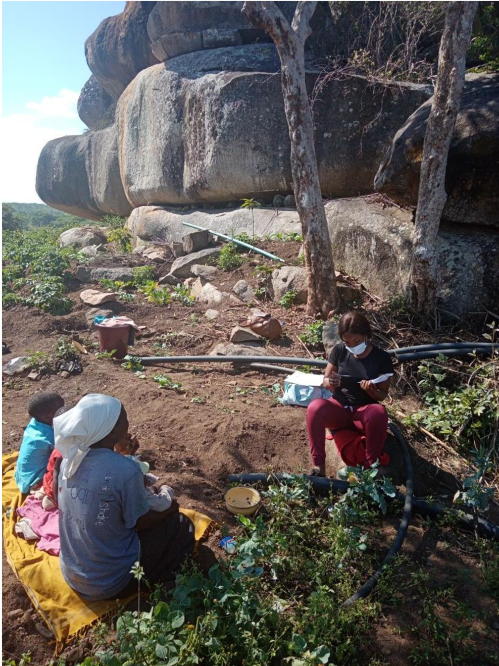
Author interviewing women at Mugwisi Cooperative