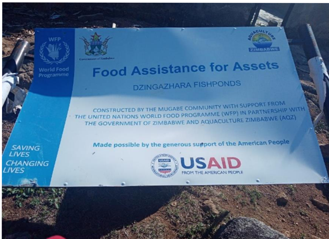
Dzingazhara Cooperative billboard