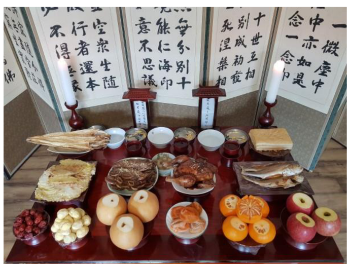
Figure 2: Offerings table

Kijesa is performed after the end of the mourning period, on the anniversary of the ancestor's death. During this ceremony a food offerings are placed on a ritual table in a specific position, such as ŏdongyuksŏ (魚東內西, fish in the east, meat in the west) and many others, each for one of the rows of offering food. However, each household can decide the position or even type of the drinks and foods placed on the table according to what the deceased one liked during his life, but the procedure of the ritual does not change. The first step is invoking the ancestor spirit with a prayer and offering them liquor three times and a meal on the offering table as a second step. Meanwhile the spirit partakes the offerings, the participants can wait either inside or outside the room. Third and last step is sending off the spirit and the offerings can be consumed by the participants afterwards. During kijesa, ancestors up to four generations are memorated.