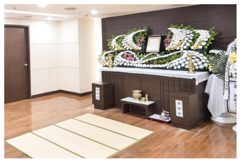
Figure 3: An example of present-day funeral hall

hospital funeral halls and 121 private funeral halls around South Korea, expanding to total amount of 714 halls by 2005 (Park 2008, 129) and then to 839 in 2008 (Kim 2011).