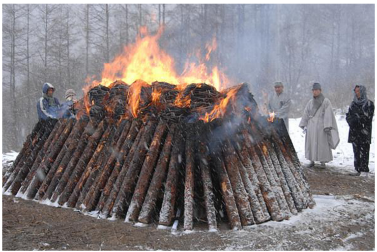
Figure 1: Buddhist cremation

relics are collected and enshrined in stūpas, in the case of ordinary people, urns are enshrined either in a columbarium or in and outdoor urn graves.