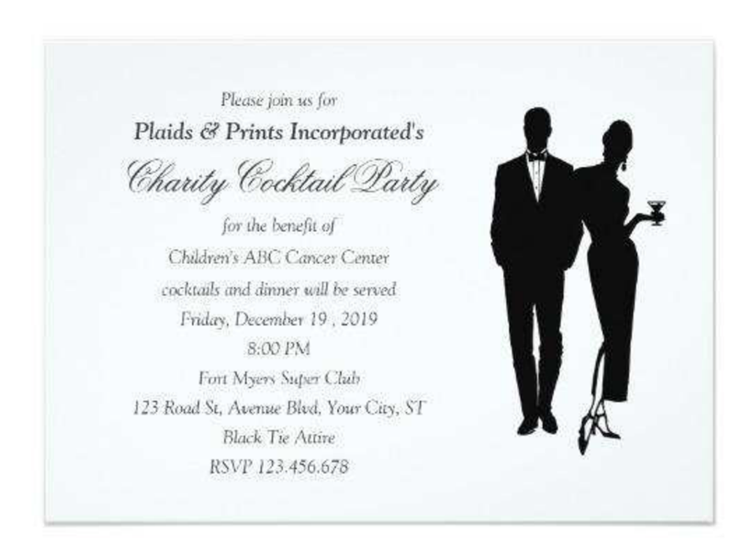
Figure 1. Invitation card for Cocktail party.

To demonstrate the basic rules of promotional written documents, the same invitation card as in previous part, Theory of planning (3.), is used, but will be analysed in more detail from the viewpoint of the design and language of advertising.