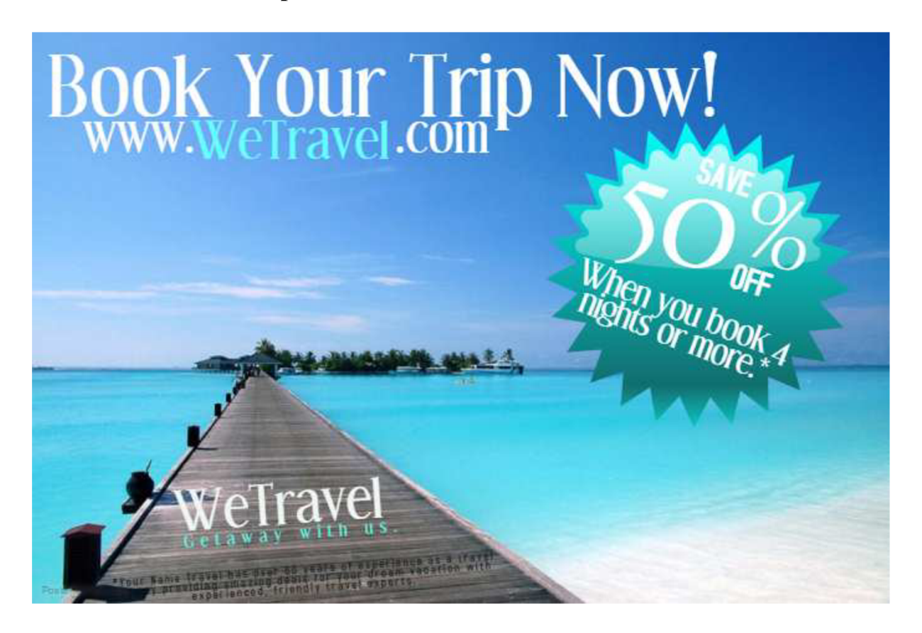
Figure 2. Promotional poster.

As a second example, the promotional poster of the travel agency is used. The poster does not refer to particular tours, but informs about tour's prices reduction and its aim is selling.