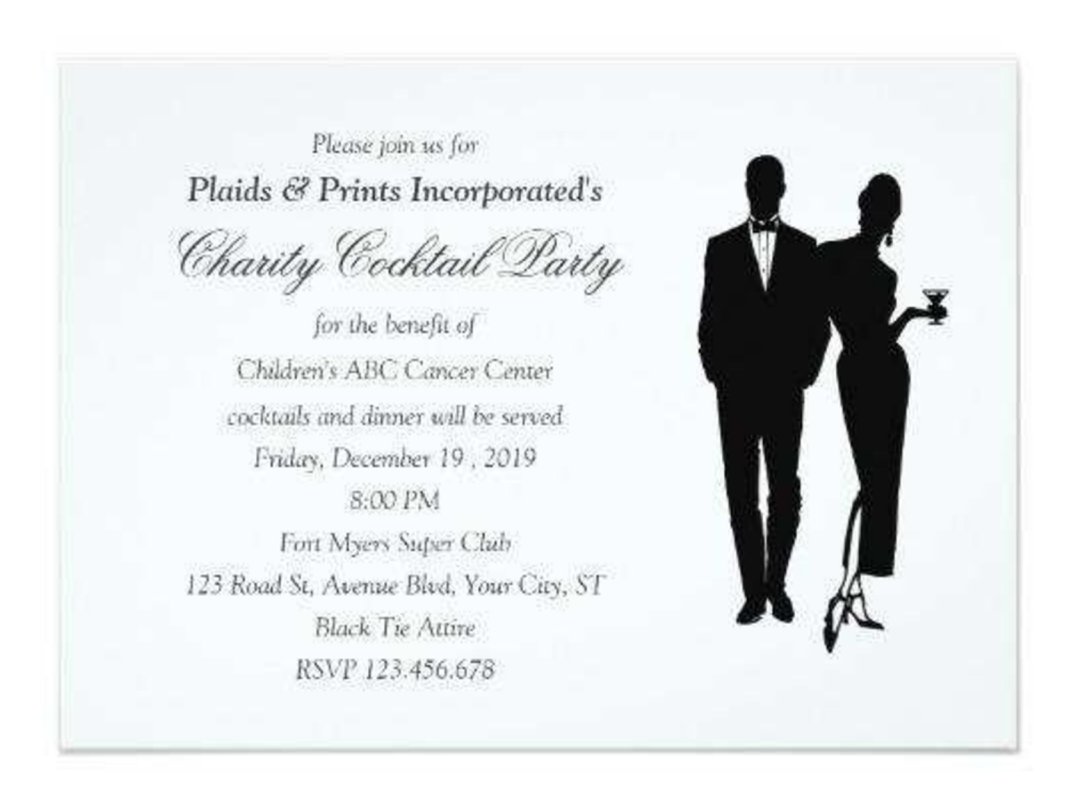
Figure 1. Invitation card for Cocktail party.

For an illustration, an invitation card to formal evening is included: