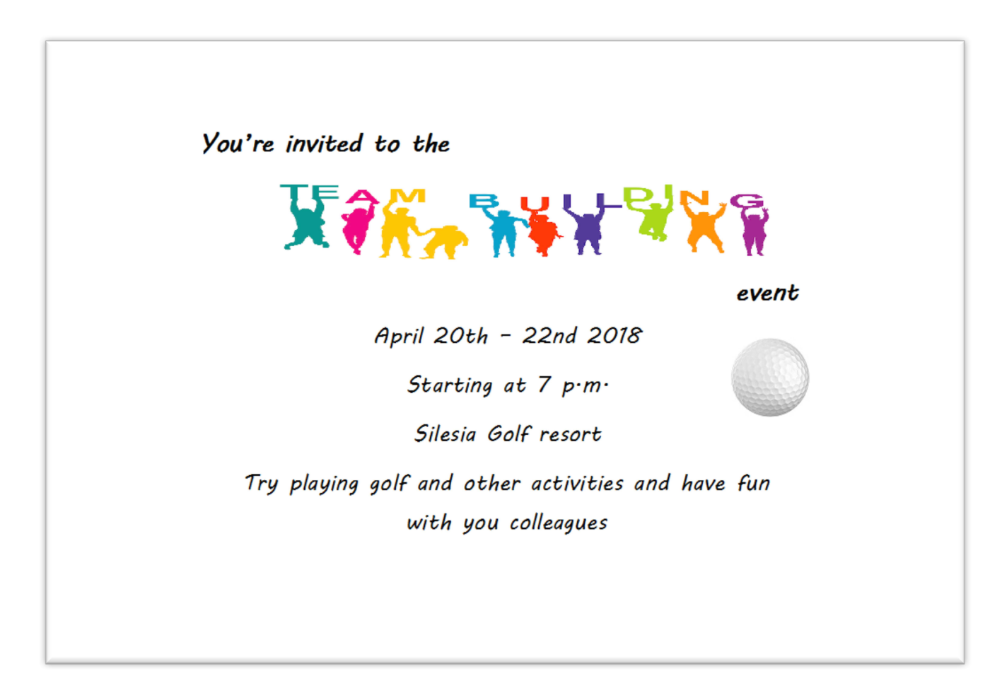
Figure 4. Invitation card to the teambuilding event.

When commenting on this invitation card, the aspect that this event is for really small group of people (12 people) must be taken in consideration. Two documents were analysed in the previous part, Communication strategies, while the first one was an invitation card for big group of people and the second one was promotional. If the organizer works with participants in the same company, there is no need to include all information, for example, the schedule. An invitation card includes the date, place and purpose and uses again the direct communication with participants using "with your colleagues". Printed coloured pictures of people holding letters, indicate the event where employees will spend time and collaborate together. In this case, there are colour shadows representing people holding letters, which indicates the event where people will spend time and collaborate together. The combination of so many colours in not over-embellished in this card, since the background is white and font colour is black.