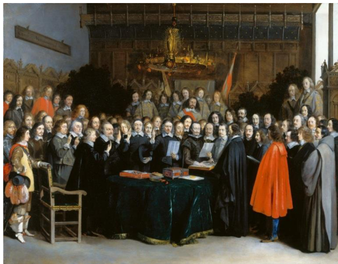
[XIV] Gerard ter Borch, The Ratification of the Treaty of Münster , 15 May 1648, 1648