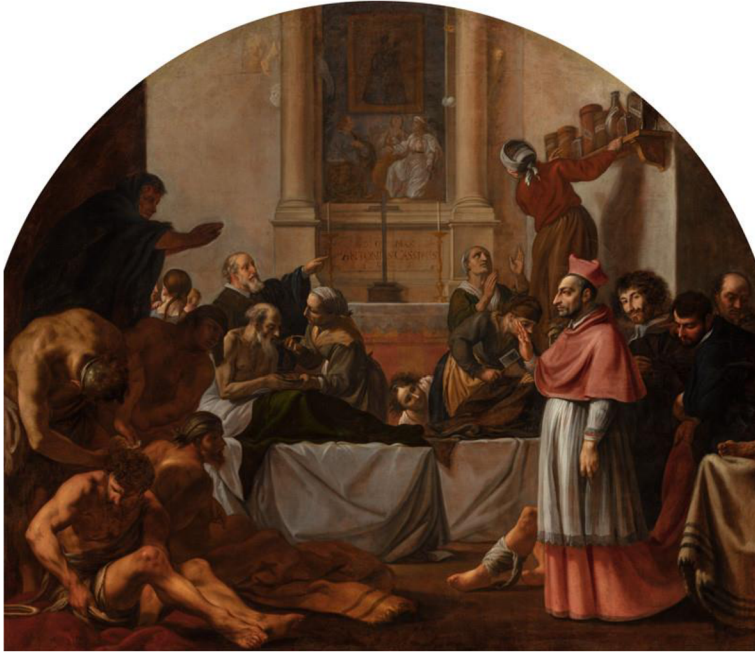
[II] Karel Škréta, St Charles Borromeo Visiting Plague Victims in Milan, 1647, National Gallery Prague