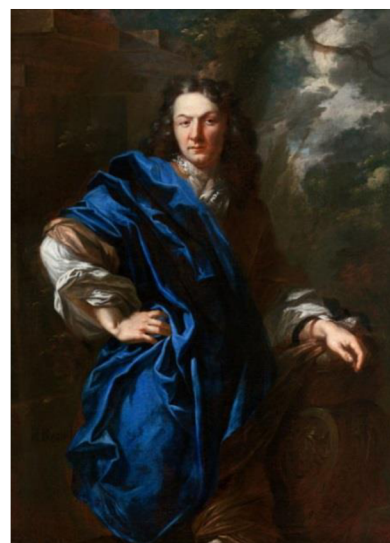
[XVI] Petr Brandl, Portrait of a Nobleman in a Blue Cloak , 1710, National Gallery Prague

Among Škréta's followers can be named Jan Jiří Heinsch (1647–1712), who received many ecclesiastical commissions, mainly altar paintings. For the Jesuit order, Heinsch was also commissioned to paint 34 portraits. The life and work of Heinsch is discussed in the publication Jan Jiří Heinsch (1647 – 1712). Painter of Baroque Piety , which aims to liberate Heinsch from the traditional dependence on Karel Škréta 84 . In the late Baroque period, Petr Brandl (1668–1735) and his contemporary Michael Václav Halbax (1661–1711) were also ranked significant painters in the Czech lands. Both painters are considered to be influenced by the work of Karel Škréta, and in both painters, but especially in Petr Brandl, a distinct dynamism is present with rich colours, flowing draperies and chiaroscuro. In the case of Brandl, this can be seen, for example, in his Portrait of a Nobleman in a Blue Cloak (1710), signifying the importance of Karel Škréta's legacy in the Czech lands.