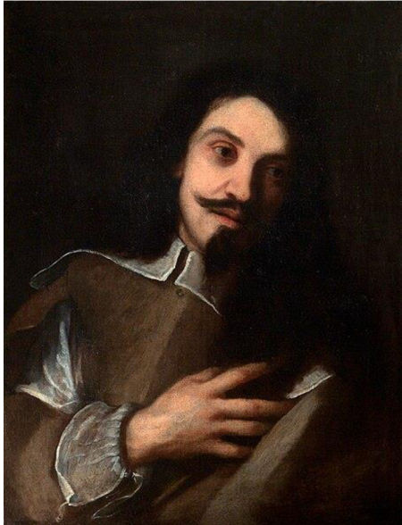
[IV] Tiberio Tinelli, Portrait of Karel Škréta , 1635, National Gallery Prague