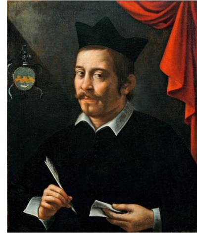
[XI] Michelangelo Merisi da Caravaggio, Portrait of a Prelate , 1592 - 1599

In the Dutch Republic, the leading painter of the 17th century is considered Rembrandt Harmenszoon van