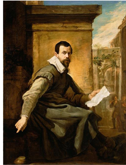
[IX] Domenico Fetti, Portrait of a Man with a Sheet of Music , 1620

Although there were no foreign artists, who would come to the Czech lands and bring new trends in painting, there was Karel Škréta, who, as described in the previous chapters, travelled to Italy and Germany, where he became acquainted with the works of Italian artists and artists active in the north of the Alps. At that time, several important painters were active in Italy, whose work Karel Škréta could follow. While in Venice, where Škréta travelled first among the Italian cities, it was Domenico Fetti (1589–1623), who was during that time one of the leading authors of many portrait works, such as the Ideal Portrait of Gonzaga (1620), Portrait of an Actor (1621), or Portrait of a Man with a Sheet of Music (1620), in Rome Škréta got acquainted with the legacy of Michelangelo Merisi Caravaggio (1571–1610), whose