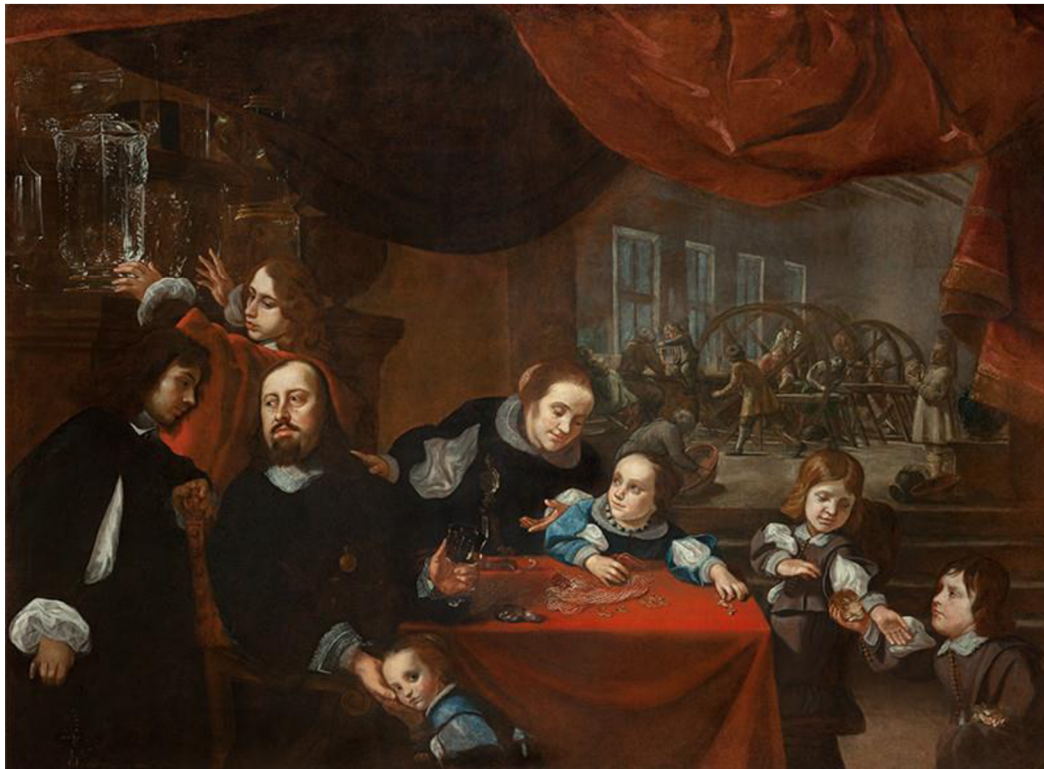
[III] Karel Škréta, Portrait of the Gem-Cutter Dionysius Miseroni and His Family , 1653, National Gallery Prague

The Portrait of the Gem-Cutter Dionysio Miseroni and His Family 41 is a painting of a detailed composition that impresses the viewer at first sight with its composition and an emphasis on sophisticated processing of details. The foreground of the painting occupying the majority beautifully captures the Miseroni family in an intimate domestic setting. Positioned at the left with a distinguished presence is Dionysio Miseroni, surrounded by his sons, Johann Octavius and Ferdinand Eusebius. The eldest son, Johann Octavius 42 , leans towards his father. In the following years, he will be embodying his role as a secretary of the court office and a key member of the inspection and liquidation committee of the Kingdom of Bohemia. Ferdinand Eusebius 43 , the younger son, reaches towards a crystal vase on a sideboard, an actual artefact produced by the Miseroni workshop. It can be assumed that Karel Škréta was already indicating