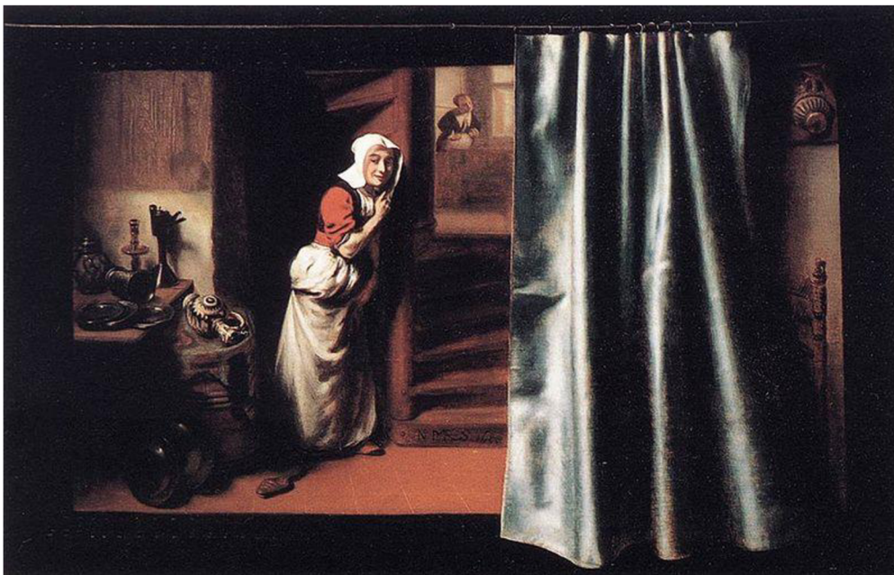
[XX] Nicolaes Maes, The Eavesdropper , 1655, Private collection