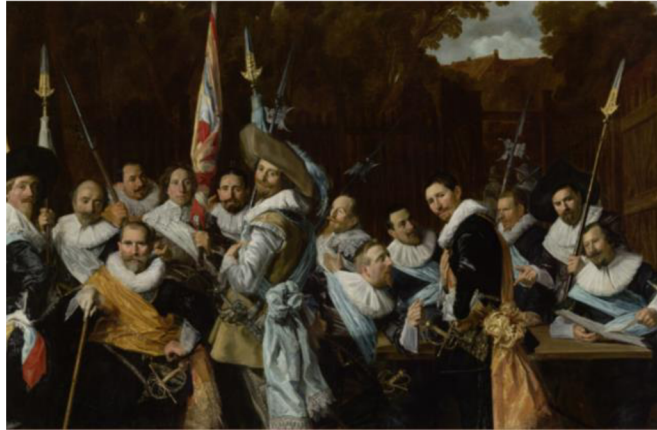
[XIII] Frans Hals, Meeting of the Officers and Sergeants of the Civic Cavalry Guard , 1633

Rijn (1606–1669), who is believed to never travel to Italy. His work is nevertheless characterised by chiaroscuro, which he used across themes, from portraits and self-portraits to genre scenes, allegorical and historical scenes. Apart from numerous self-portraits, his famous likenesses include the Portrait of Jan Six