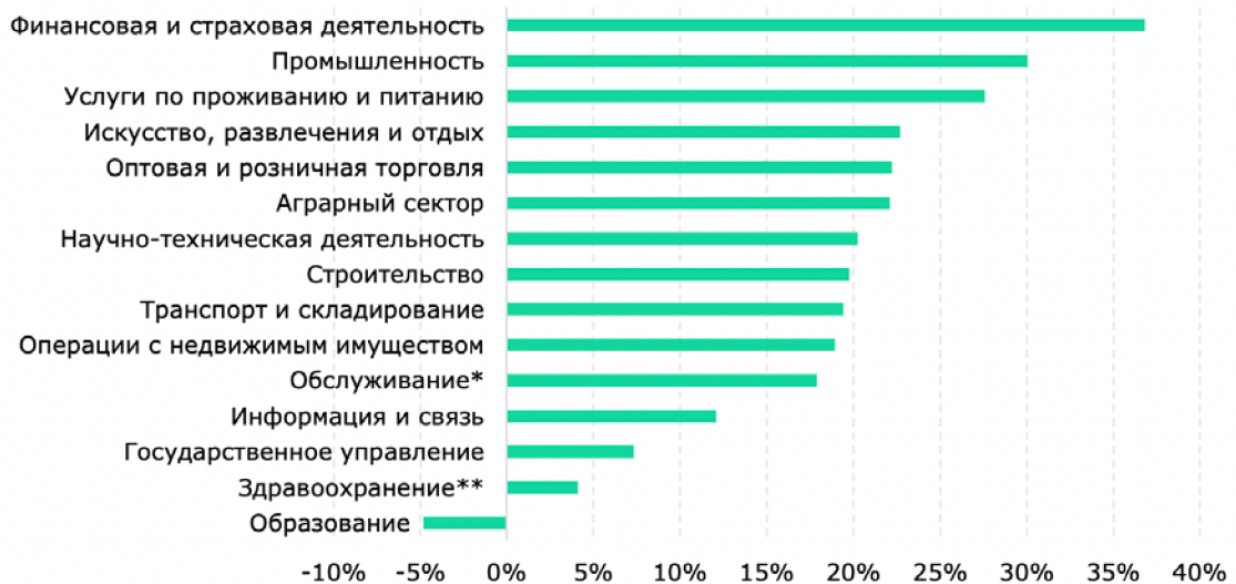
Figure 3: Gender gap by economic sector at the end of 2022