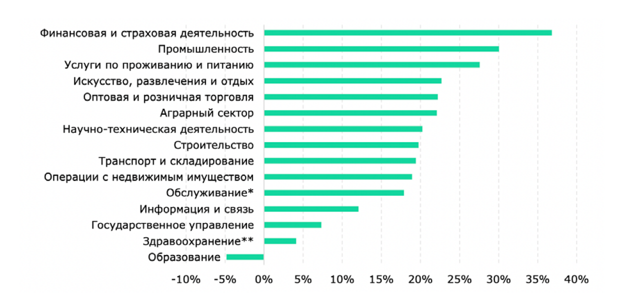
Figure 3: Gender gap by economic sector at the end of 2022