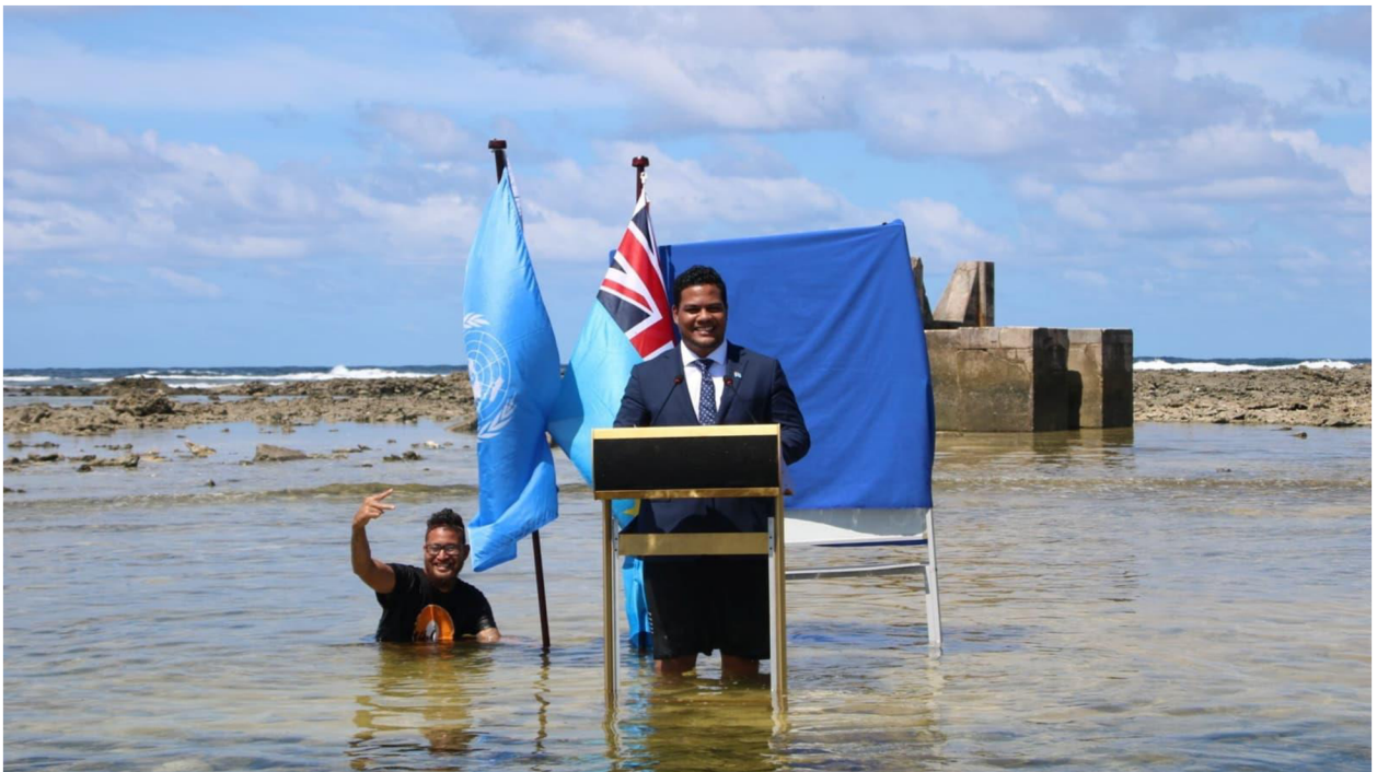
Photo 2.: The COP26 speech of Tuvalu's foreign minister Simon Kofe was filmed as he was standing knee-deep in the ocean to highlight the effect of rising sea levels on the small island state in the South Pacific.

COP26, it was fossil fuel lobby who had the largest delegation of all, and as such outnumbered the delegates from every single country. It had more than double the number of the Indigenous delegates, and it even outnumbered the delegations from eight countries that are the most impacted by climate change (BBC, 2021). It is important to mention that this was the first time since COP officially stressed the need to scale down on fossil fuels, however in the final document the wording of the Glasgow agreement changed last minute from a phrase phase out to phase down , also for the fact that “while more than 40 countries agreed to quit coal for power generation and 23 countries signed for ‘COP26 Coal to Clean Power Transition Agreement’ for the first time, some of the largest coal producers went missing from the agreement including Australia, China, India and US” (Arora and Mishra, 2021, p. 586).