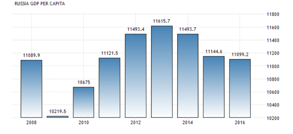
Table 1. Russian Federation: GDP per capita (money, $)