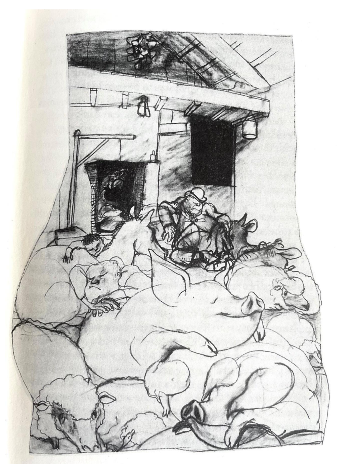
The sheep used often start fighting and many times I went without a wink of sleep from the bleating and the roaring they used have.