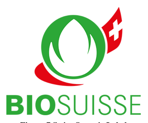
Figure 7 Swiss Organic Label