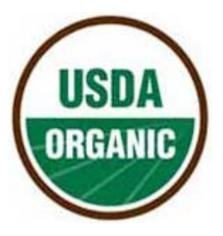
Figure 8 United States Organic Label