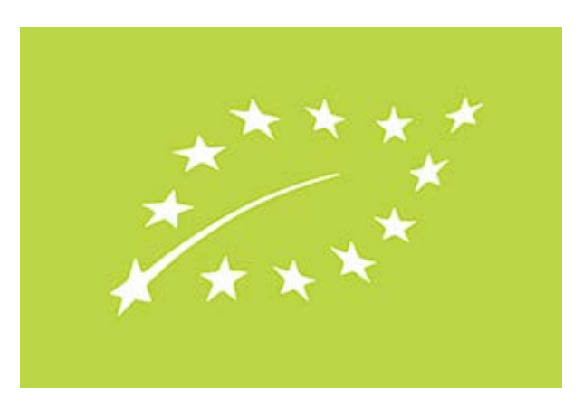
Figure 2 European Union's logo "Euro-leaf"

The EU organic legislation is constantly striving to improve the regulatory system, reduce the cost of certification and inspections, in order to increase attractiveness to farmers. Now certification is quite a risky and expensive process. Thanks to support from the EU government and the use of its own obligatory logo, it makes the EU organic certification system the potentially most effective regulatory system in organic agriculture (European Commission, 2019).