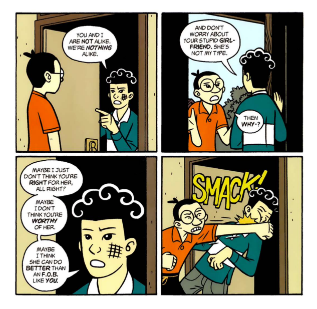
Figure 6 (Yang, American Born Chinese, 191).

just like he was forced to conform. There seems