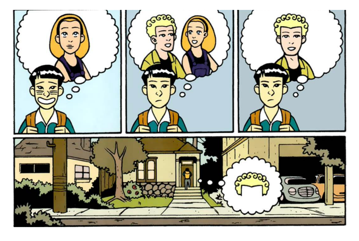
Figure 7 (Yang, American Born Chinese, 97).

I want to also mention the struggle of Jin to accept himself. If we put aside that we now know that Danny is actually Jin and focus only on Jin's story, he struggles to see himself in a good light. He tries to change himself to look more