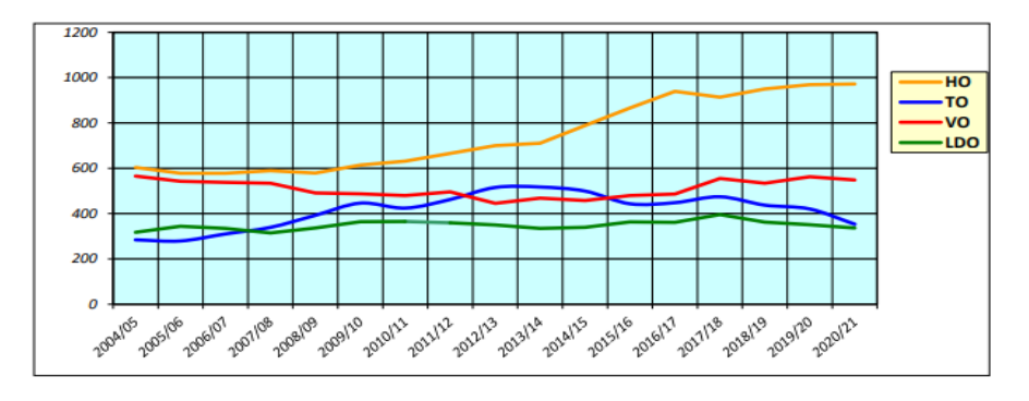
Figure 1 Change of interest in different art school departments (ZUŠ Střezina 2021) Legend: vertical axis represent the number of students attending each department, the horizontal axis represents the change in time.