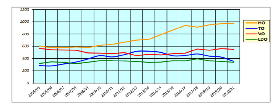
Figure 1 Change of interest in different art school departments (ZUŠ Střezina 2021)