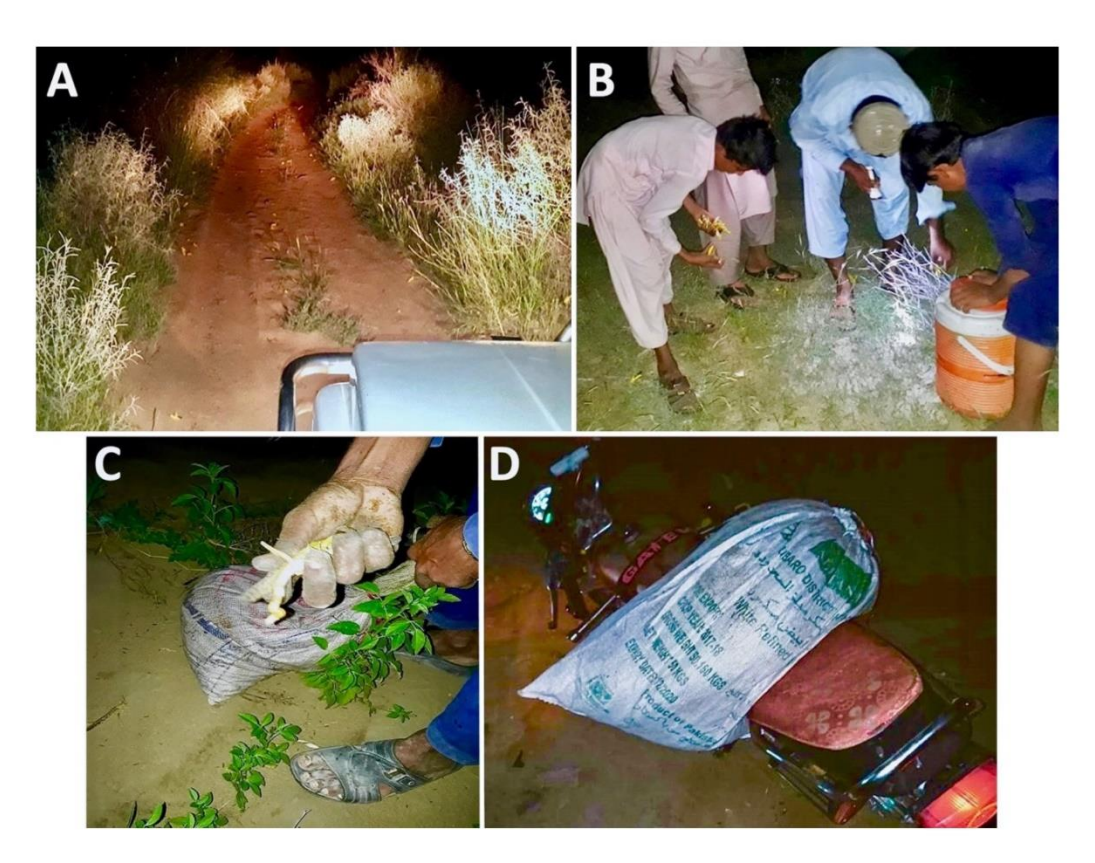
Figure 2. Trapping Schistocerca gregaria in the evening in the field (A) Lights from the vehicle as a trap (B) Light and containers for collection (C) Placing insects in a bag (D) Cargo of insects ready for transport (Samejo et al. 2021).

The locust nymphs are easy to collect, creating 40 cm deep trenches along their migration route. These trenches should be vertical so that the insects cannot climb up the walls. Fallen nymphs can then be collected and further processed. As this insect specie is cold-blooded (like all insects), the best way to capture it is in the evening or early morning hours, as it is almost immobile in colder weather. Before the insect can take flight, it must spend some time in the sun to warm up. Therefore, trapping in the morning and evening hours is the best way. Adult locusts can be trapped using hands, buckets, or bags. Insects can also be prepared for consumption by dropping them into boiling water, drying them, or frying them. Insects can be seasoned with available spices for the best flavour results (Samejo et al. 2021).