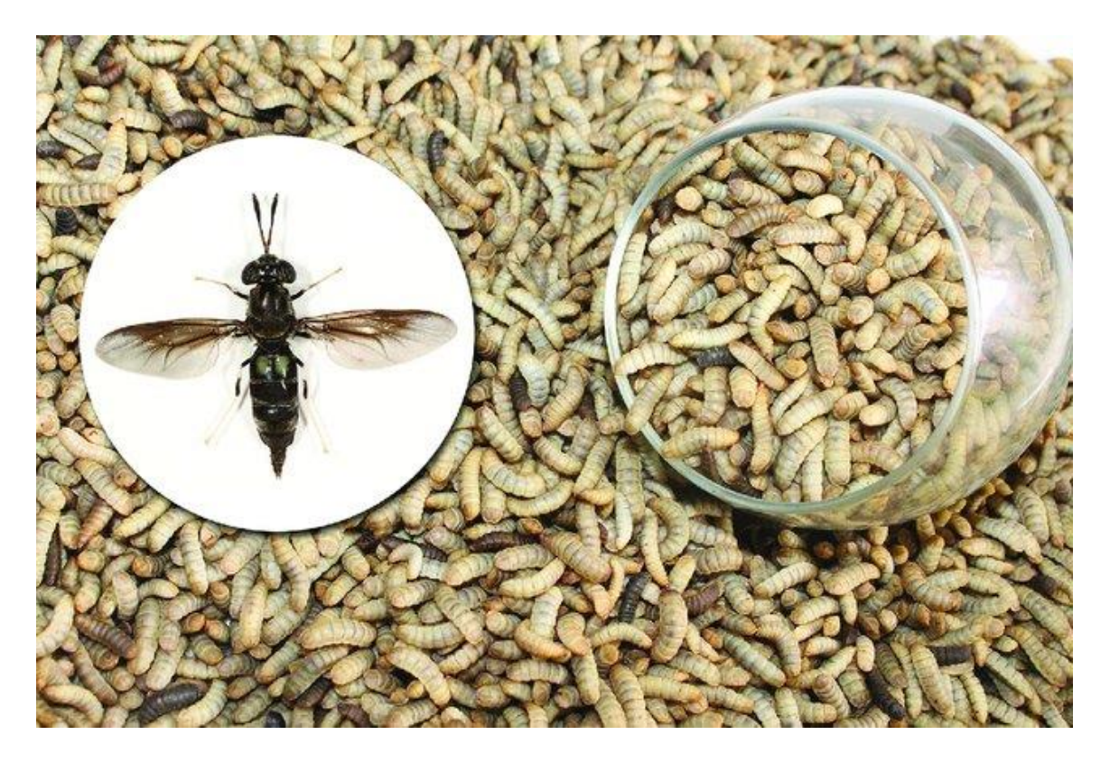
Figure 3. Hermetia illucens in the adult and larval stage (Chia et al. 2018).

Black soldier fly meal and oil are already being considered as an alternative to fish meal and fish oil as fish feed. This is because the larvae contain a high protein and lipid content (Kroeckel et al. 2012). Larvae can accumulate lipids in their bodies if fed a diet suitably enriched with lipids. These enriched larvae produce omega - 3 fatty acids when the diet is supplied with fish guts (St-Hilaire et al. 2007). Such enriched larvae are very high quality and suitable food even compared to fish meal. Experiments with African catfish ( Clarias gariepinus ) confirmed that replacing fishmeal with black soldier fly larvae did not affect altering growth rate or other growth rate utilization, so they were recommended as a suitable alternative that is also more affordable (Aniebo et al. 2009). This has led to suggestions that they can completely replace fishmeal and thus contribute to sustainable aquaculture (Diener et al. 2009).