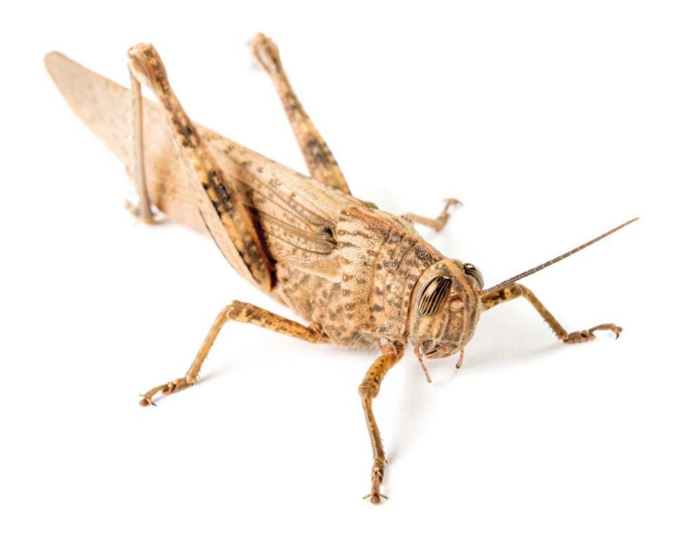
Figure 1. Schistocerca gregaria (World Meteorological Organization and Food & Agriculture Organization of the United Nations 2016).

other hand, malnutrition and food security could be greatly improved by consuming these insects.