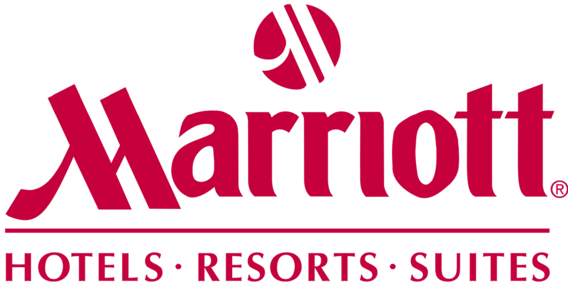
Figure 1, the logo of the Marriott group