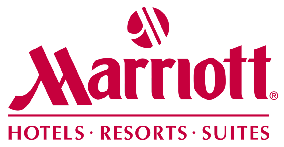
Figure 1, the logo of the Marriott group