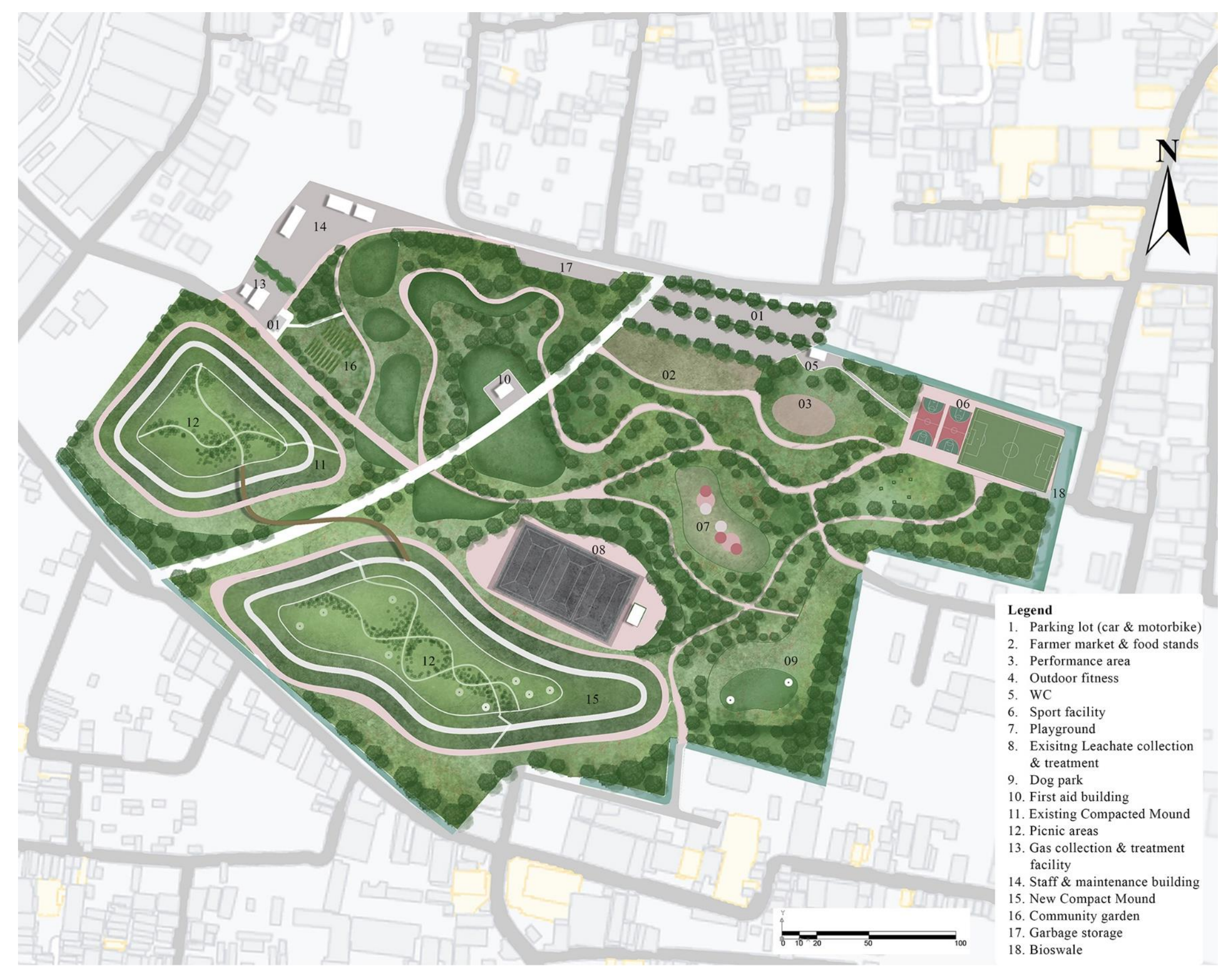
Appendix 1. Master plan proposal