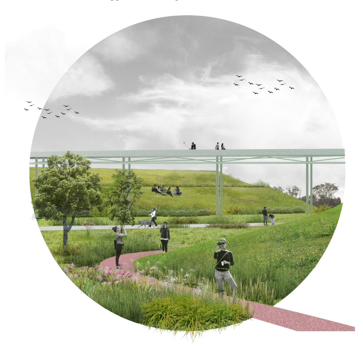
Appendix 3 . 3D perspective