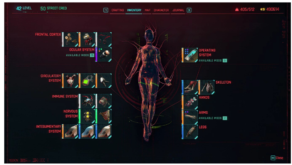
Figure 8: Cyberware Slots

The dangers behind attempts to transform humans into cyborgs are a frequent theme in cyberpunk fiction. For example, in Pat Cadigan's Symners , paranoia and schizophrenia frequently stem from the human desire for cybernetic enhancements and change in human status, rather than the cybernetics itself (Goicoechea 2008, 9). This vision is more similar to the empathy mechanic of Cyberpunk 2013 , rather than to how cyberpsychosis is depicted in Cyberpunk 2077 . In Neal Stephenson's Snow Crash (see Chapter 1.4.1), the warning of transforming humans to cyborgs is rather metaphorical, as it can make people vulnerable to a virus, which causes information overload (Goicoechea 2008, 9).