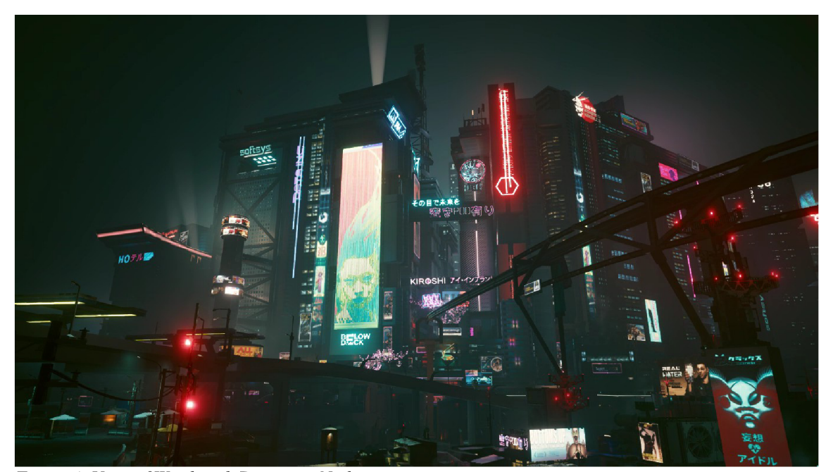
Figure 4: View of Westbrook District at Night

differences between corporate culture and street subcultures. Manifestations of light are a crucial visual element, as in many other cyberpunk games (Frelik 2018, 93), such as the Deus Ex series.