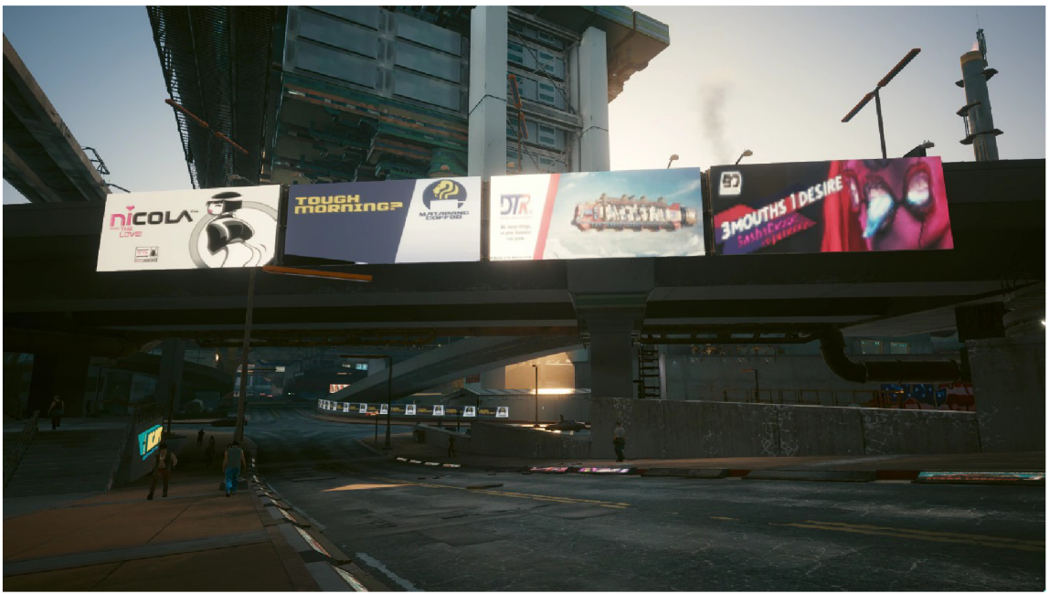
Figure 7: Advertisements

to those already present in other cyberpunk media. It should be emphasised, that Cyberpunk 2077 does not bring anything new to cyberpunk aesthetics, adhering rather strictly to visual signifiers set by its predecessors. Despite this, some of these signifiers exceed their visual role and play a part in the narrative. For example, advertisements often refer to actual game objects, locations, or characters; instead of being purely decorative. Another example includes nearly omnipresent television screens, which in addition to short clips and advertisements feature news reports related to events in the game and as such play a supportive role in the game's narrative.