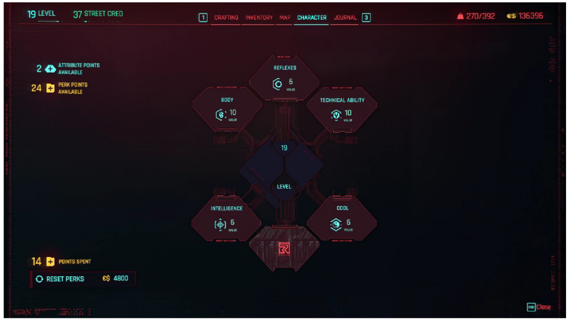
Figure 1: The Attributes

The combination of attributes and skills represents a crucial role-playing element, as it allows the player to specialize the character in certain activities. This specialization is critical for completing missions, especially with higher difficulties of the game.