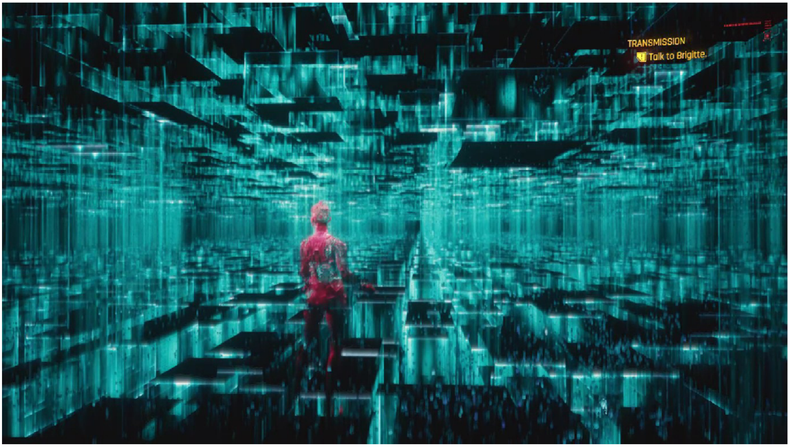
Figure 5: The Cyberspace

2018, 140–52). In Cyberpunk 2077 , the player enters cyberspace only briefly during two missions. It is represented by flickering particles, which form a grid. Data fortresses (representations of computer systems) have neon blue colour, while representations of people, AI, and Blackwall (a representation of firewall program) are red. The data fortresses have rectangular shapes, whereas the people in cyberspace are represented by avatars shaped akin to their real appearance. The only AI encountered in the game's cyberspace, Alt Cunningham, bears its former human shape. The Blackwall is composed of strips of data which represent an actual wall. Thus, Cyberpunk 2077 adheres to representations of cyberspace, which were established in cyberpunk video game in the 1980s and 1990s, since it uses the typical wireframe grid, familiar shapes and colours.