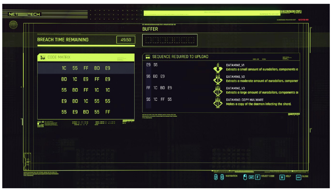
Figure 9: Breach Protocol Interface

Mankind Divided, where they fulfil a similar role: opening doors and accessing data through specific objects (Ng and Macdonald 2018, 188).