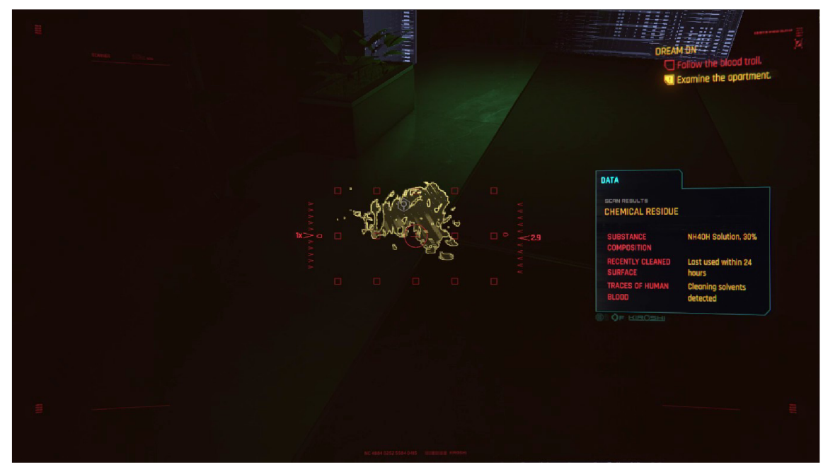
Figure 2: Using the Scanner to Investigate

ctOS, whereas in Cyberpunk 2077 , the player can scan NPCs to see their cybernetics enhancements and their criminal records from a police database.