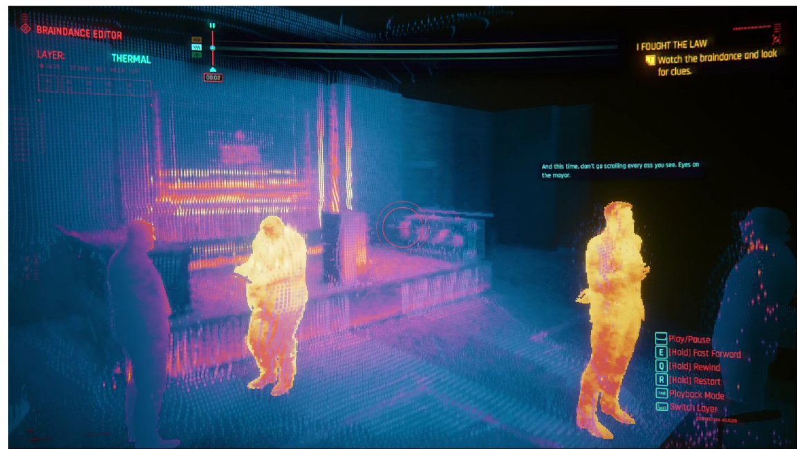
Figure 3: The Thermal Layer of the BD Editor