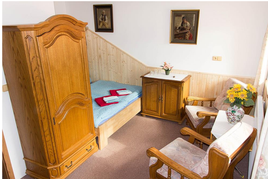
Figure 3.2.1.2 – rooms of the penzion U Veselých