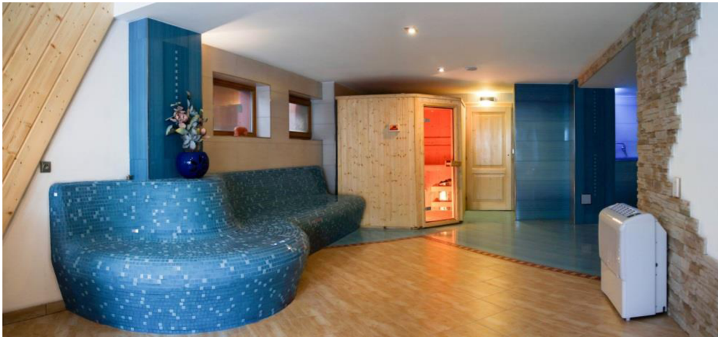
Figure 3.2.1.1 – Alpine design elements in the wellness centre