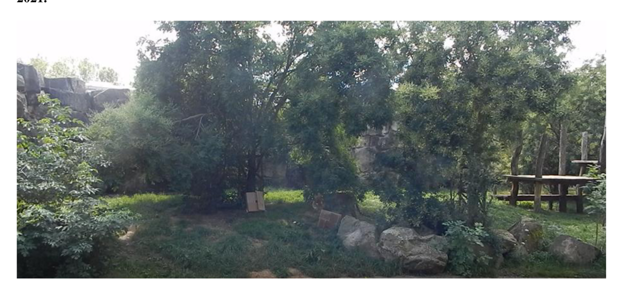
Figure 4: Outdoor Malayan Tiger Enclosure. Credit: CR, 2020.