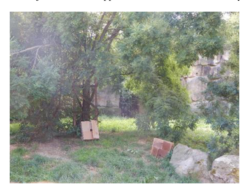
Figure 6: Fish oil Enrichment Displayed on a Box.

Each presentation option (wicker ball, cardboard box, spread on ground) was used at least once examples of the presentations can be seen in Figure 6 & Figure 7). When the individual approached the object, the approach time stopped upon contact with the object, and the total interaction time was recorded. If the individual did not approach or stopped interacting with the object, the time stopped after 10 minutes of inactivity.