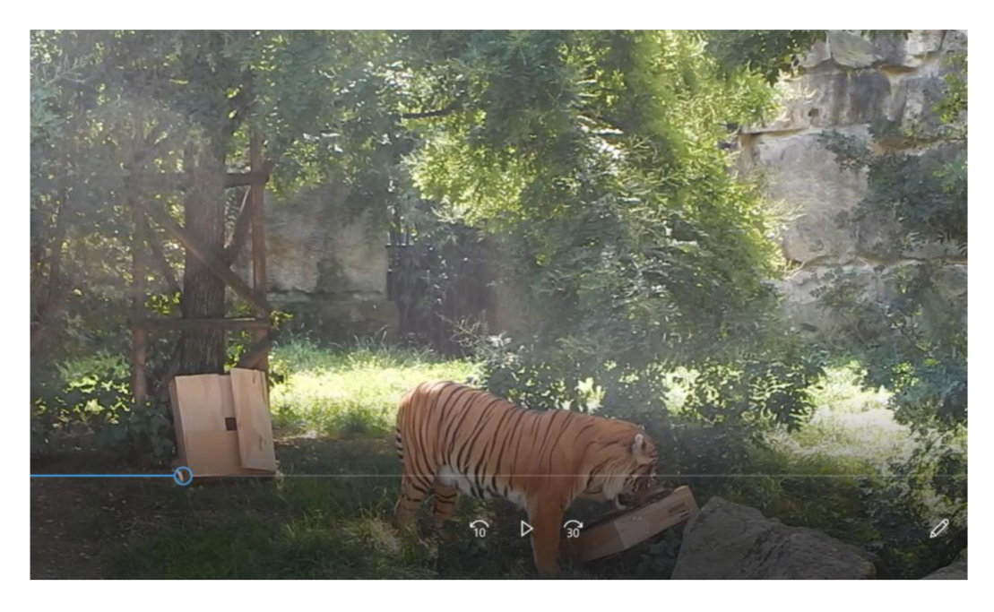
Figure 10: Johann Interacting with the Odorized Enrichment

Although the results are not significant for the enrichment display and the approach time or the enrichment display and the interaction time, the results show slight preferences. For example, the box enrichment display had both the fastest approach time and longest interaction time. While the ground display had both the slowest average approach time and shortest interaction time. There are a couple of reasons that the ground enrichment seemed to be less appealing to the tigers. First, it may have been harder to locate since there was no visible object within the enclosure. Secondly, since there was not a visible object, it might have been less visually interesting.