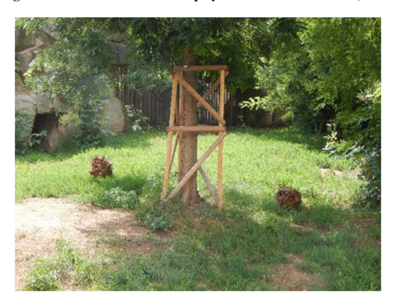
Figure 7: Catnip Enrichment Displayed on a Ball.