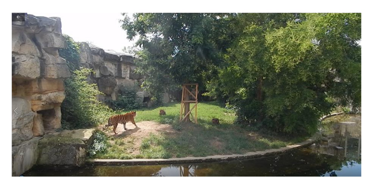
Figure 5: Outdoor Sumatran Tiger Enclosure.