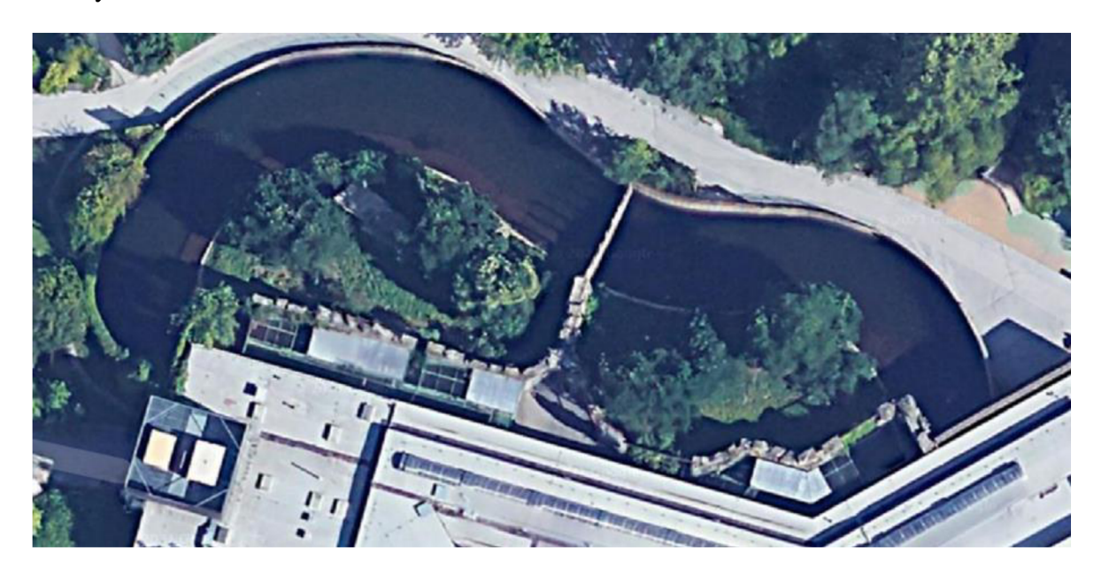
Figure 3: Malayan enclosure (left) and Sumatran enclosure (right)

(Figure 3). Part of the indoor area is away from visitor sight, and in the other part, the visitors can see the tigers. Both indoor areas are primarily concrete with metal bars and have little or no natural aspects. The enclosures' outdoor areas include a large swimming area, a grassy area, a two-tiered raised platform, logs, shrubs, rocks, and trees as seen in Figure 4 and Figure 5 below. The two outdoor areas align with the essential aspects of tigers' enclosures as described by Pistsko (2003); each enclosure is comprised of enough space for the individuals to run and explore, natural vegetation, high shaded places, and a body of water.