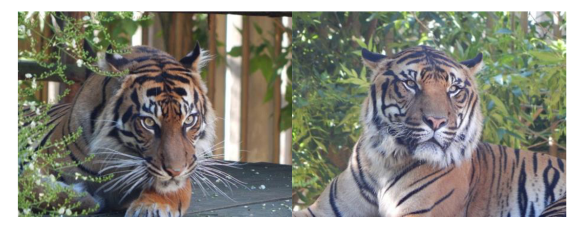
Figure 2: Cinta (left) and Falco (right).

Cinta (Figure 2) is the youngest of the tigers at seven years old during this study. She was born on February 3rd, 2014. Falco is the male Sumatran tiger (Figure 2); he was born on May 27th, 2007, and was thirteen years old at the time of this study.