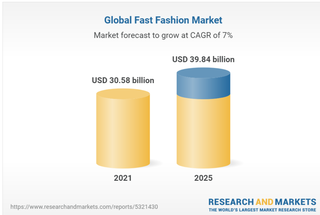
Figure 4: Global fast fashion market growth

Source: "Fast Fashion Global Market Report 2021: COVID-19 Growth and Change to 2030" (54)