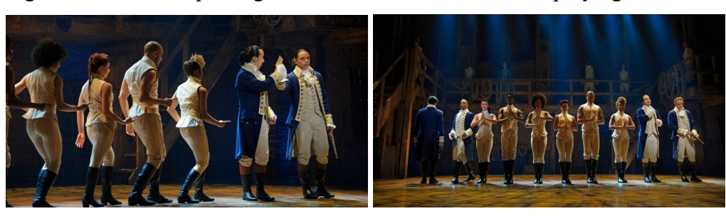
(14) Figure 10: Laurence passing Hamilton a note, the ensemble praying

This means that in this case, the syntax of the TT should be governed by these speech acts, and the translator should take this into account if their goal is a singable and performable translation, despite the fact that this may cause the TT to appear slightly unnatural. Another example of choreography dictating what should be in the TT is when Laurens passes Hamilton a note when Hamilton is saying: "Leave a note for your next of kin (...)" (ibid). When Hamilton continues with saying "Pray that hell or heaven lets you in" (ibid), the ensemble follows his words and starts praying,<sup>27</sup> see the following screenshots: