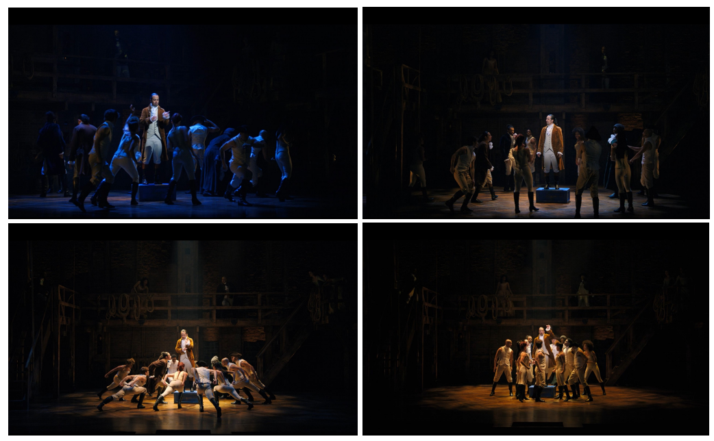
(6) Figure 4: Lighting change during Hamilton's public speech, the ensemble reflects the buildup in his words

the gradation in the impact of what he is rapping about.<sup>18</sup> The translator should construe the text accordingly with this in mind; the change from a soliloquy to a public speech and the impact of Hamilton's words should also build up until the lighting dims for a second and the actors go on to sing the main motif of the song. See the following screenshots: