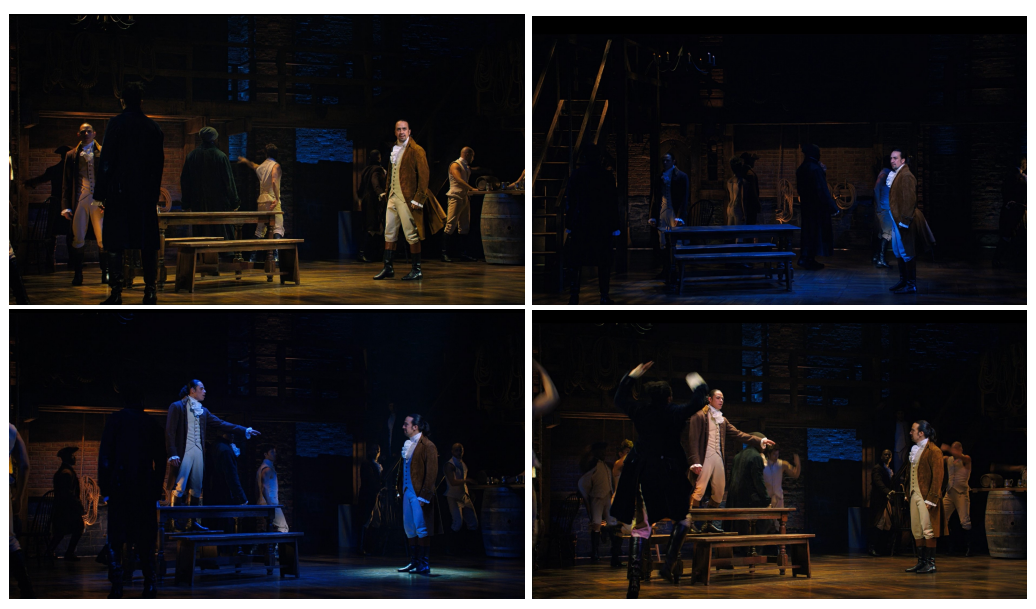
(5) Figure 3: Lighting signifies Hamilton's change in thinking and remains blue until Laurence speaks

This is not the only instance of lighting being used as a sign-vehicle in the song, another example may be its abrupt change accompanied by a "swoosh" sound effect when Hamilton suddenly realizes he accidentally went on a tangent.<sup>17</sup> In this case, the lighting signifies the change in Hamilton's thinking process, which is also reflected in the change in the tone of his voice and the cessation of his previous rhyming and rhythmic structure. If the translator were not to consider it, they most likely would not be able to recognize this difference when focusing on the text only. The lighting remains dimmed and blue-tinged until Laurens points at Hamilton and proclaims: "Let's get this guy in front of a crowd," (ibid, 27), then everything changes to its previous state. The changes are illustrated in the following screenshots: