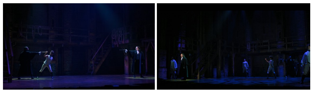
(20) Figure 13: The lighting dims as in My Shot when Hamilton starts his final words

way from purple to blue once he stops addressing Burr and starts talking to himself,<sup>36</sup> as can be seen in the following screenshots: