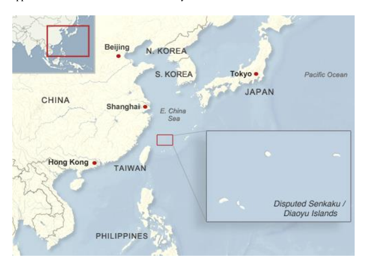
Appendix D: Location of the Senkaku/Diaoyu Islands