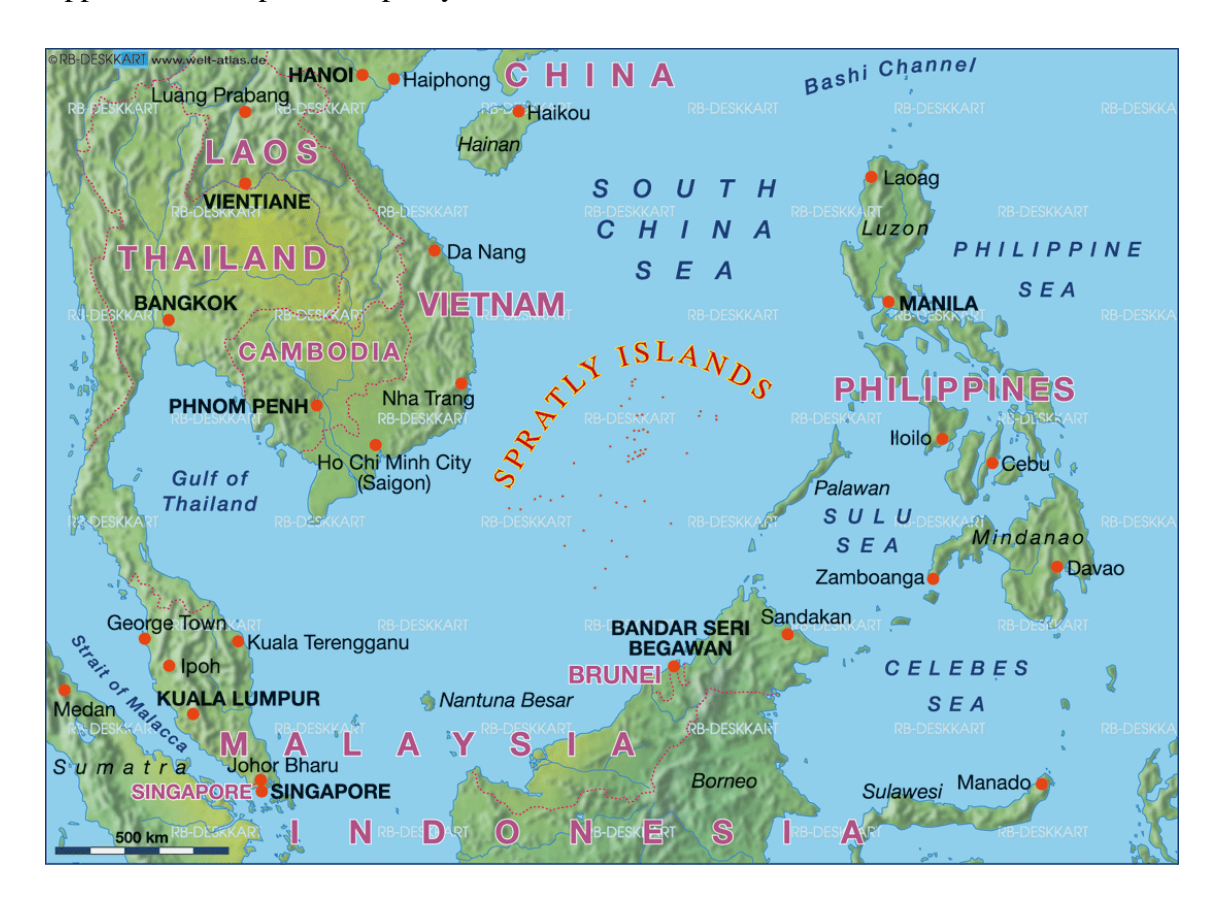
Appendix A: Map of the Spratly Islands