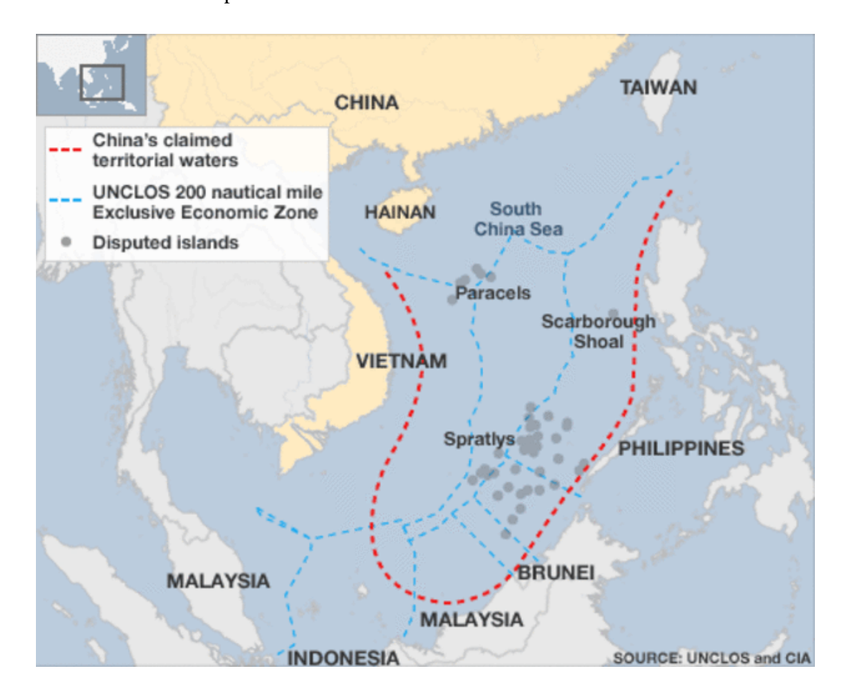
Appendix B: Map of South China Sea dispute with graphical projection of the EEZ of each claimant in comparison with Chinese claimed area

( Source : NATO, 2014. Available at: http://natocouncil.ca/territorial-disputes-in-the-south-china-sea/)