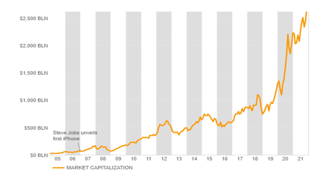
Figure 6, Apple market capitalization

Apple's market value has hit 2.5 trillion dollars as of the 5th of September 2022, which is unquestionably a major financial accomplishment for the corporation and the administrators of the company. In fact, it is the best result ever achieved by the firm, and there is a good chance that the total will be much higher in the future. On the chart that follows, you can see how Apple's market capitalization has changed over time.