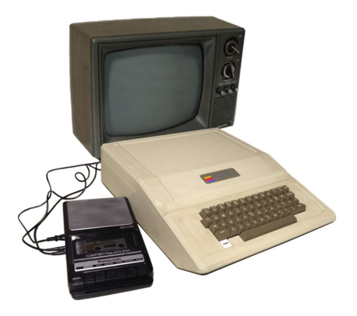
Figure 2, Apple II

Apple saw its first phenomenal achievement in the year 1977, when the firm introduced its second personal computer, known as the Apple II. This product was a huge hit, and it enabled Apple to build a positive reputation and cultivate a following of devoted customers for the business (Johnson, 2012).