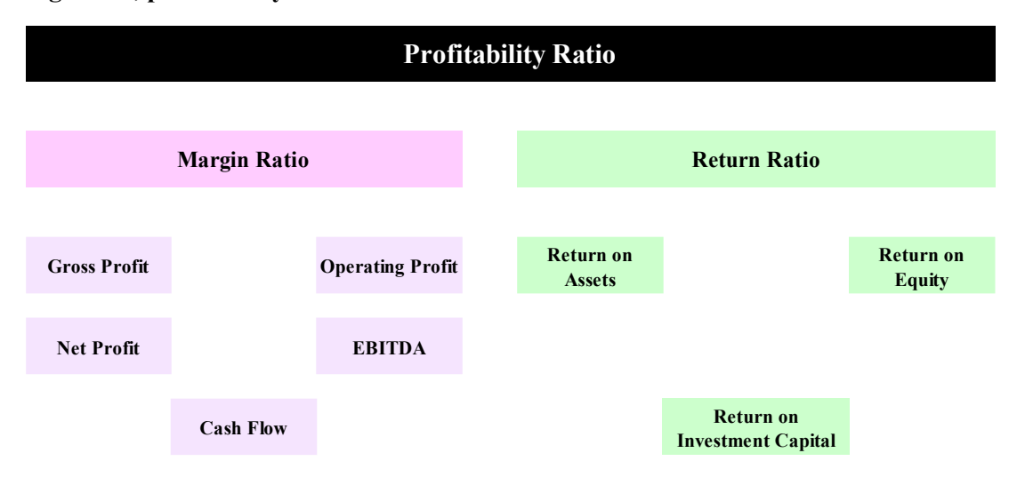
Figure 13, profitability ratios