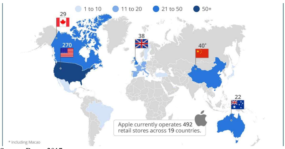
Figure 5, Apple branches