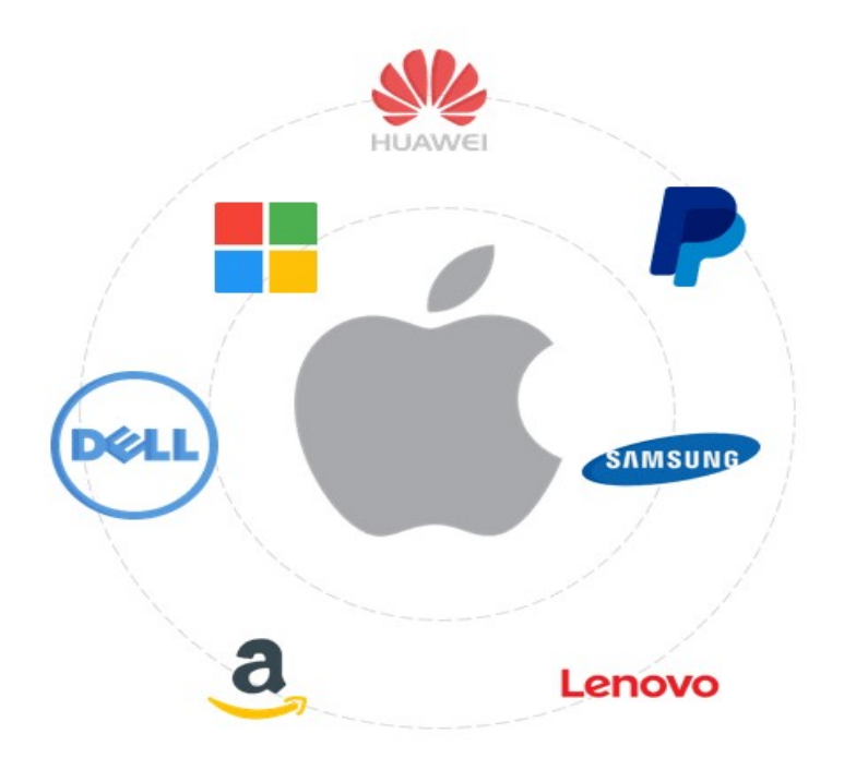
Figure 8, Apple main competitors

In addition to all of this, it is important to point out that Apple has only relatively recently entered the streaming sector, and that the corporation is now even specialized in the creation of films and series with the assistance of the service invested by them and given the name Apple TV. Because of this, it is also vital to point out that the corporation is now a rival of Netflix, Amazon, and HBO, all of whom opted to explore the streaming market alongside Apple. Due to the fact that just a short amount of time has gone since the event in question, it is still too soon to determine whether or not the company's foray into streaming has been fruitful (Addison, 2022).