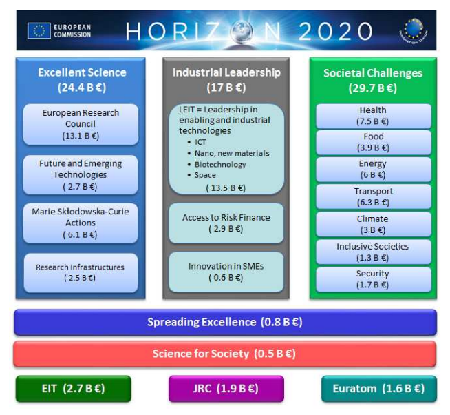
Figure 2 - Horizon 2020 sections

The current Framework Programme for Research and Innovation is called Horizon 2020 and is implemented for the period 2014-2020 with the budget of almost 80 billion euros. It is the biggest European Research and innovation programme that aims to transfer ideas from laboratories to new innovative products or technologies that should easily be put on the market. Horizon 2020 is based on 3 main pillars. Under the main pillars, diverse actions are encompassed. It can be seen in the picture below.