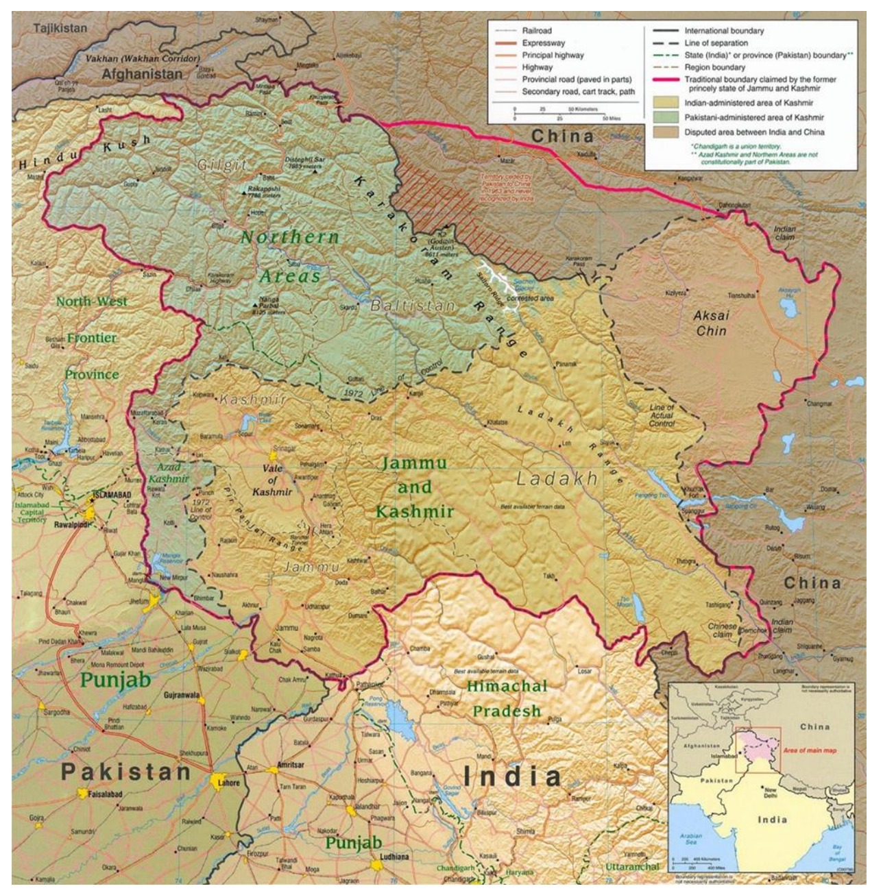
Figure 1: Kashmir disputed region