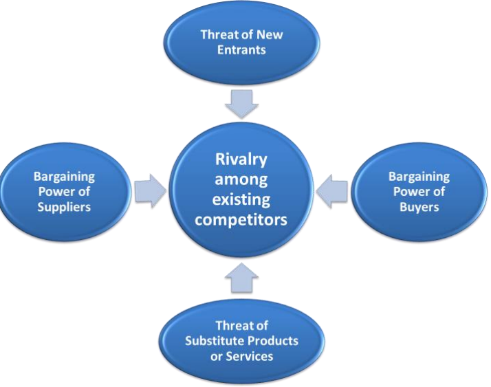
Figure 7. Porter's Five Forces Model