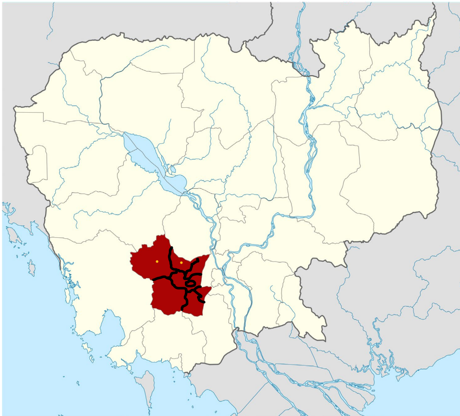
Figure 1: Map of Cambodia and study area (Kampong Speu province)

The province of Kampong Speu is located west of Phnom Penh, between Sihanoukville and the capital city as showed in Figure 1(USAID 2008; Tourism Cambodia 2020). Kampong Speu is situated along the primary transportation route. Kampong Speu is ideally situated to give access to high-quality inputs as well as to export and domestic markets since a good national route connects the two. Population was 762.500, aged between 15-64 and 65% were employed in Agriculture. The size of the province was 7.017 km 2 divided into eight districts and 87 communes (USAID 2008).