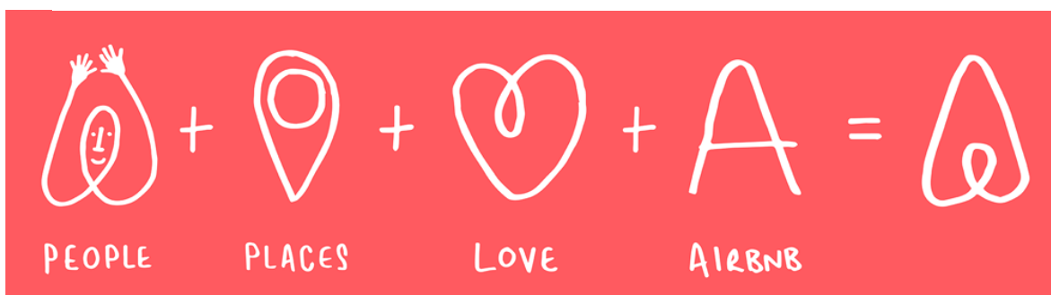
Figure 4: Explaining of each letter in Brand Logo of Airbnb

The silhouette of a person, a heart, a geotag, and the word A are the components that come together to form the logo. It is a sign of the establishment of a community in which individuals may share their travel experiences with one another and feel a sense of belonging to that group (Figure 4). This concept is regularly disseminated via social media, blogs, and other online platforms by means of videos and other types of information.