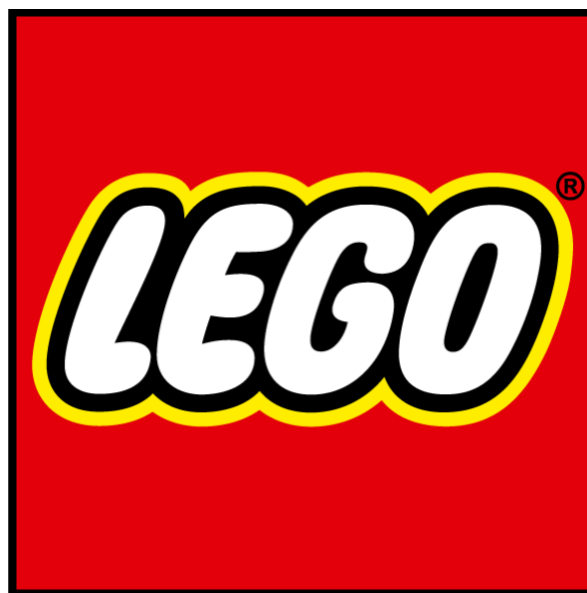
Figure 1: Lego Brand Logo

LEGO is a company that is driven by its goal. This company makes it very clear that the objectives of the product are to encourage youngsters, to educate them to work together and solve problems, and to foster their creative potential. The acquisition of all of these talents