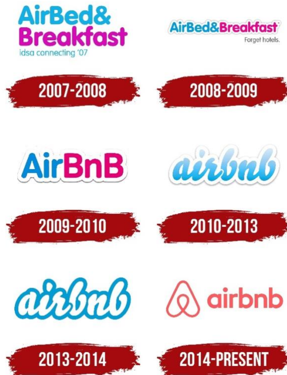
Figure 3: Airbnb Brand Logo Evolution

Airbnb takes great satisfaction in being one of the leading platforms that enables homeowners to throw up their doors to travelers in search of the best possible travel experience for themselves and their guests.