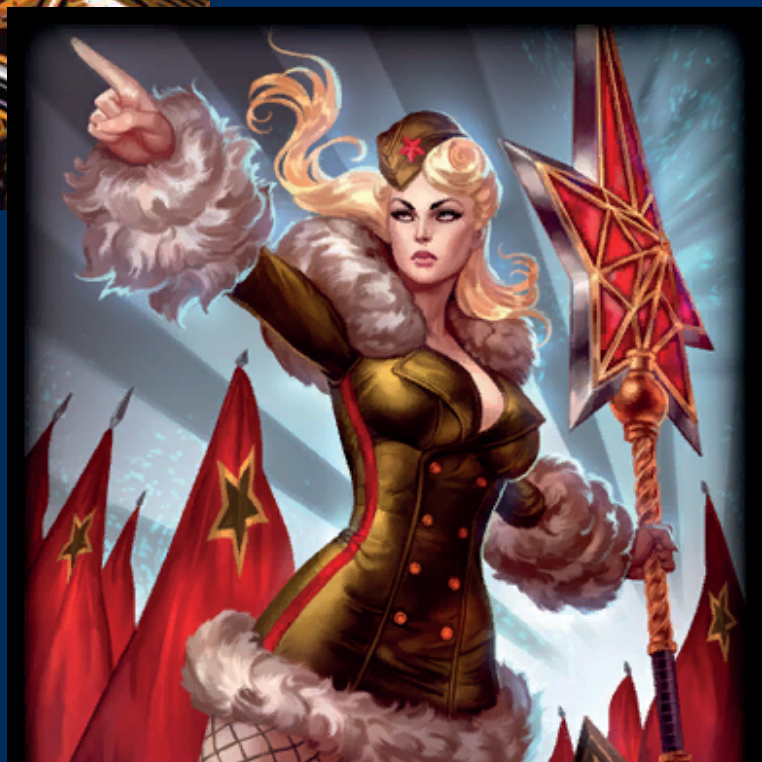
Command & Conquer: Red alert 3, Electronic Arts Smite, Hi-Rez Studios