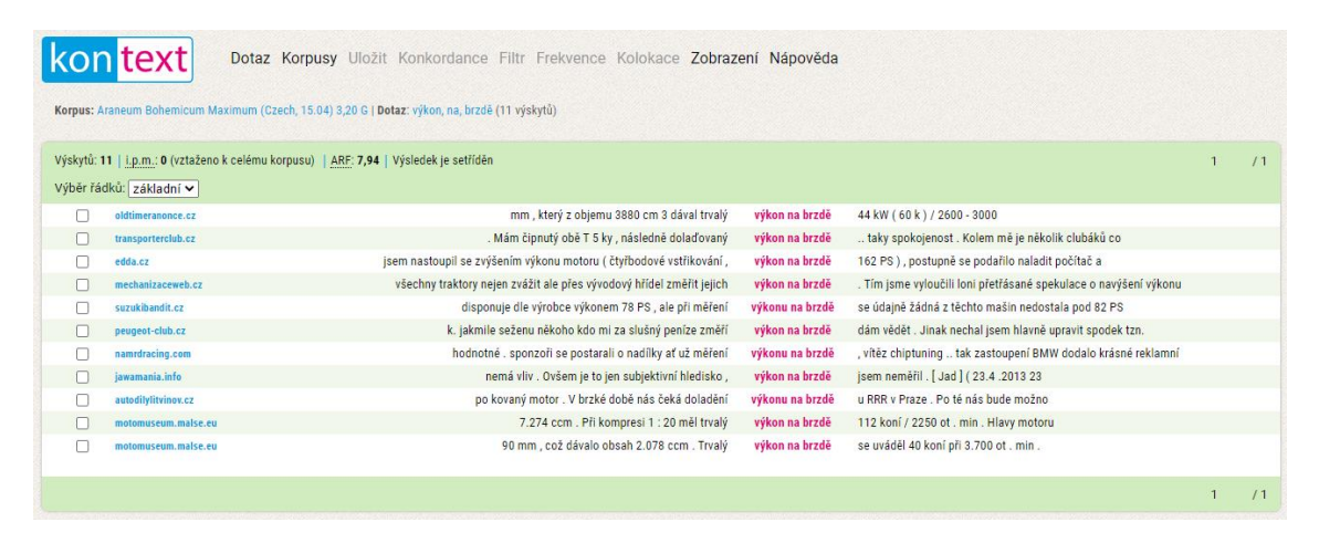
Figure 5.4-1 - Screenshot of corpora search

After researching this term on Czech corpora, none of the Czech corpora had any mention of this term. The correct term would be "výkon na brzdě," which was found in Araneum Bohemicum Maximum corpus 11 times. It is not frequently used term that is used only on websites, which are for car experts.