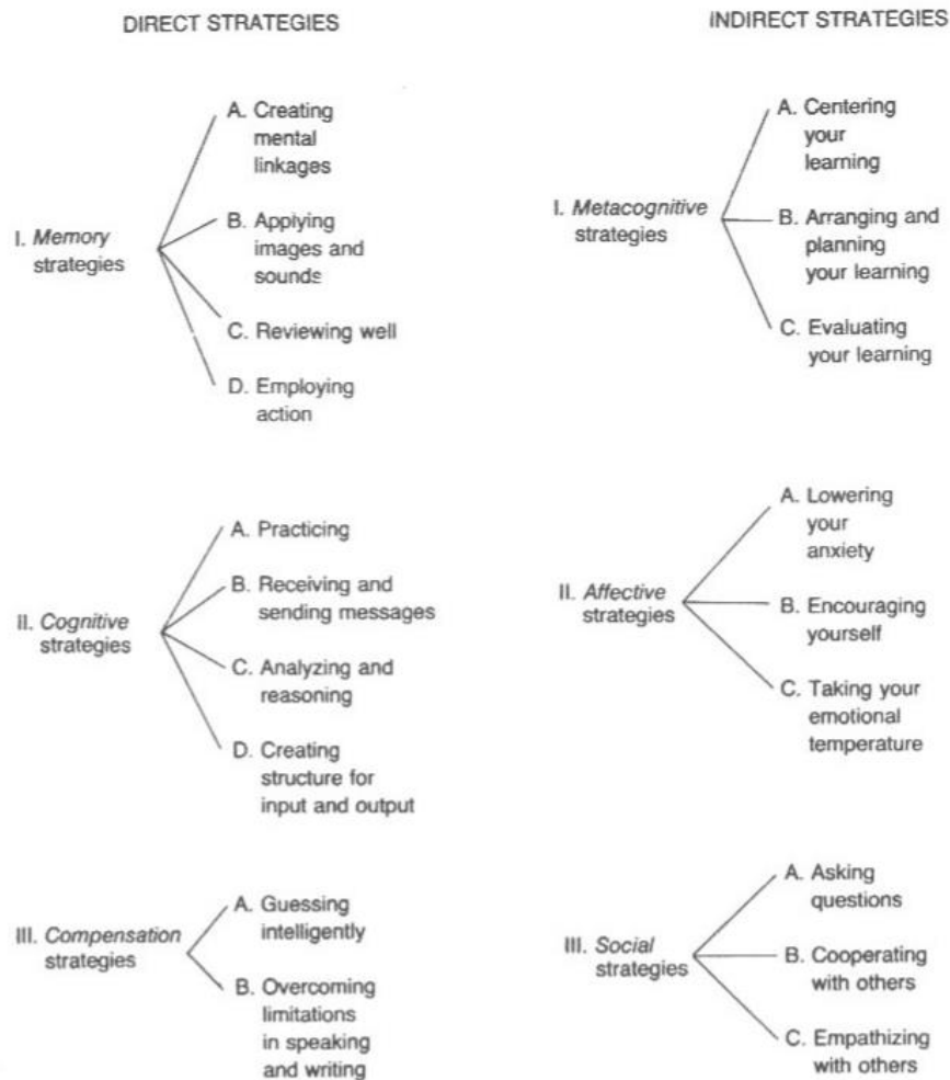
Table 2 Diagram of the Strategy system showing two classes, six groups, and 19 sets.