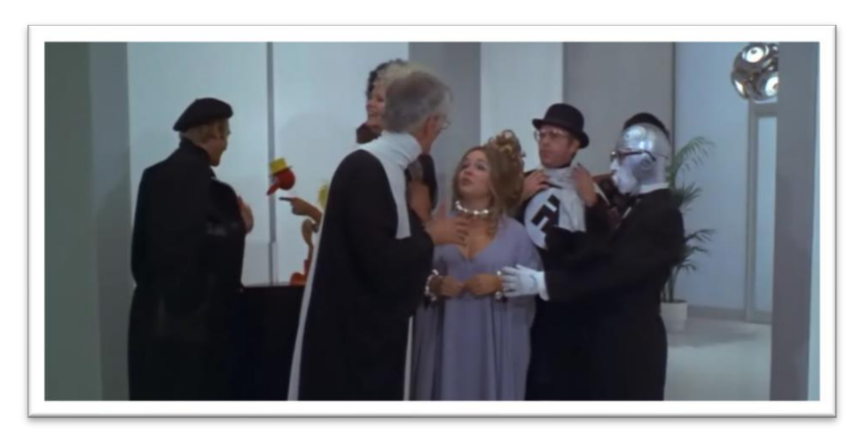
Figure 7. Allen's take on clothing in a dystopian society (26:51).

As shown in both examples the takes on clothing and "fashion" are completely different from both authors. George Orwell uses the clothing as a way to make every member of the dystopian society seem the same. Through the usage of uniforms, he deletes any social inequality, if there is any. On the other hand, Allen uses the means of fashion to demonstrate the decay of his dystopian society. He dresses people really nice and even uses symbols like swastika (very unusual from Allen given that he himself is Jewish) on their clothes. People are free to wear anything they like and the more fancy the better. From the picture above I see more of a "Hunger Games" (a dystopian movie adaptation from 2012 that has been made on the base of Suzanne Collins's novel) where people from the prominent districts have bizarre clothing. It is the same case in "The Sleeper" where bizarre pieces are also used such as the coat with a swastika on it, the coat with a white turtleneck looking more like a member of the Church, or the very short dress supplemented by very long stockings. It is clear that Allen makes fun of the usual dystopian "fashion" by adding bizarre outfits to the common people of the society. He once more took it very far by adding the swastika symbol on one of the men's coat. It is fascinating to think about all the means that Woody Allen uses to parody society with clothing being one of the most surprising aspects that I found.