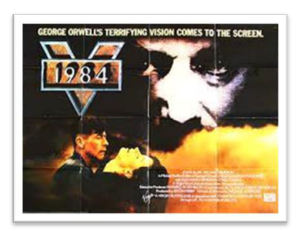
Figure 1. Poster of 1984 movie.

The movie adaptation of this famous novel came out in 1984, the same year as the title of the novel. This movie lasts almost two hours and closely follows the plot of the novel. This could be considered why this adaptation got such good reviews. The film director was Michael Radford, whose movie was nominated for the prestigious BAFTA award (IMDB, 2005).