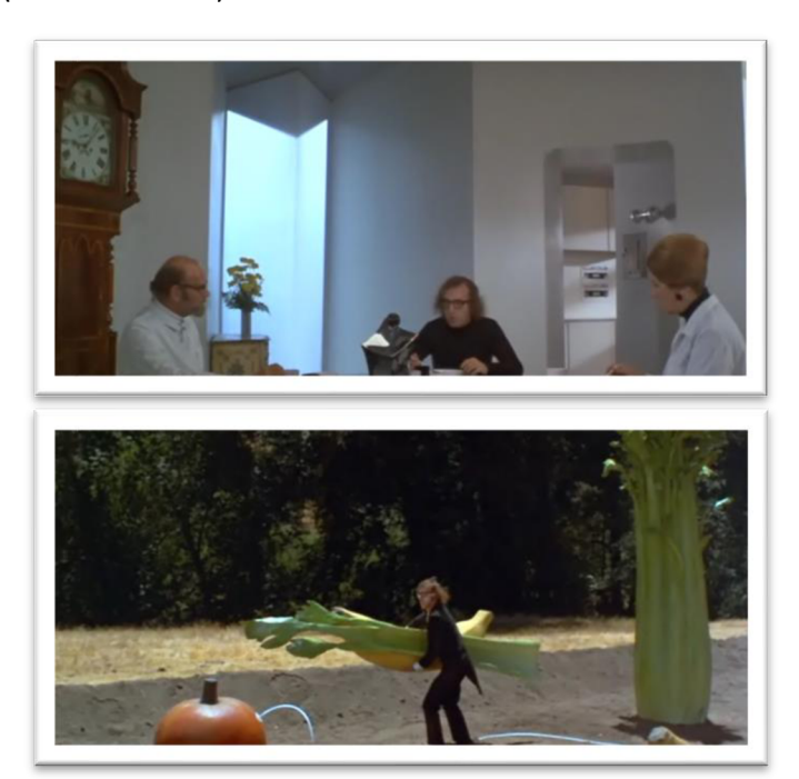
Figure 9. Allen's portrayal of food in his dystopian world; in the top picture there is a lunch of members of the underground (17:41); in the bottom picture there is Miles stealing huge portion of food for Luna (41:31).

In these two examples, I showcase a different attitude towards food in dystopian worlds. Orwell describes it like a something that does not look good nor taste good. Allen uses this to imply parody again. Members of the underground have lunch with Miles while the robots are serving them. In Nineteen Eighty-Four if there were any members of the underground, they would certainly not be able to have such a feast together. Food of higher demand was only for the members of the Party. Also, in Nineteen Eighty-Four food was a rare commodity, in "The Sleeper" however, huge food is being planted meaning that it is likely to have enough food. Another point connected to this topic is that Miles Monroe used to work as an owner of a health food store during his life before cryopreservation. After he is woken up, he is told that everything he thought was unhealthy is now considered healthy and vice versa. Allen certainly plays with parodying the food aspect from Nineteen Eighty-Four by exaggerating the size of the food and also by satirizing the feast that members of the underground enjoyed. This is a more subtle example of Allen parodying Orwell, and it certainly does not have that political thought behind it, but it is an interesting feature in the film, and it brings a certain level of originality to the plot. In my opinion, Allen did a brilliant job in relation