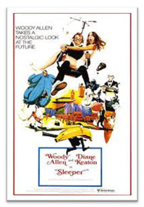
Figure 2. The Poster of The Sleeper (IMDB, 2005).

In this poster of "The Sleeper," plenty of features that appear in the movie are shown. In the middle, there are Woody Allen, who plays Miles Monroe, and Diane Keaton, who has the role of Luna Schlosser, escaping from the fight on a flying backpack, a scene that is also portrayed in the film. On the bottom, there is Allen holding a huge banana, which is bigger than him. On the right side, a robot is visible in the picture, feature of a robot is very important in "The Sleeper." On the other side, there is Miles escaping from another scene through an inflatable suit which helps him to escape on the water. The whole poster shows devices that have an important role in the movie. The quotation "Woody Allen takes a nostalgic look at the future" describes the idea behind the movie. Allen takes inspiration from the past, Nineteen Eighty-Four, and remakes it into the futuristic world using parody, satire, irony, and ridicule to picture Orwell's ideas.