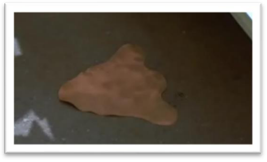
Figure 4. The remains of the Leader's nose (1:23:57).

What Woody Allen does from the all-feared character of Big Brother is only a disembodied remain of the nose. Allen chose the nose for obvious reasons. The nose in a Jewish culture can comically symbolize male genitalia, a penis. This symbolism is directly linked to Allen's Jewish roots. He used it in a way to parody the character of Big Brother . In Allen's film, there is an attempt of cloning back the Leader from his only remaining part which is a symbol of a penis. This means that Woody Allen tried to