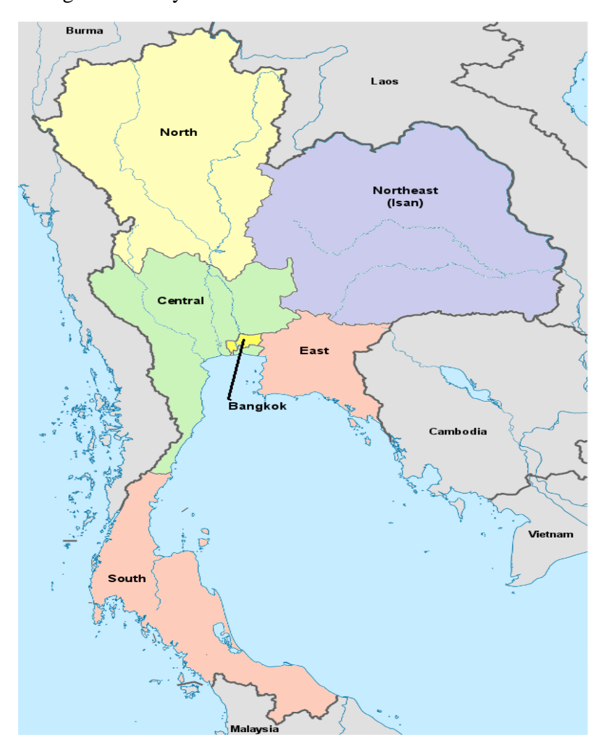
Figure 2: Study Area