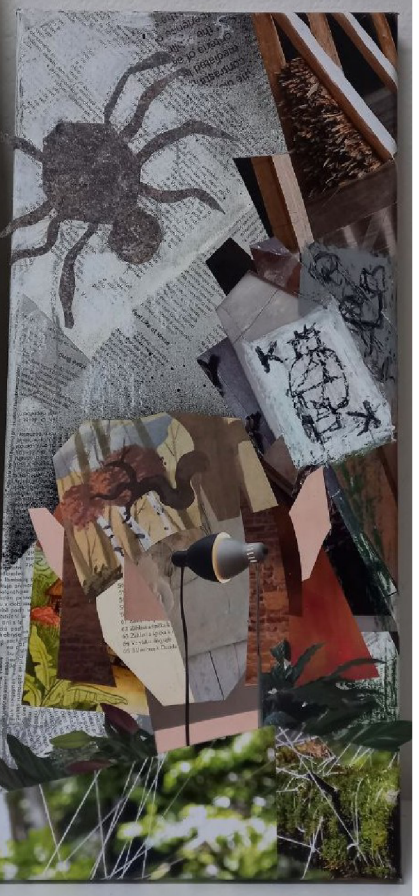
Fig. 2,3. Process of the central collaged canvases